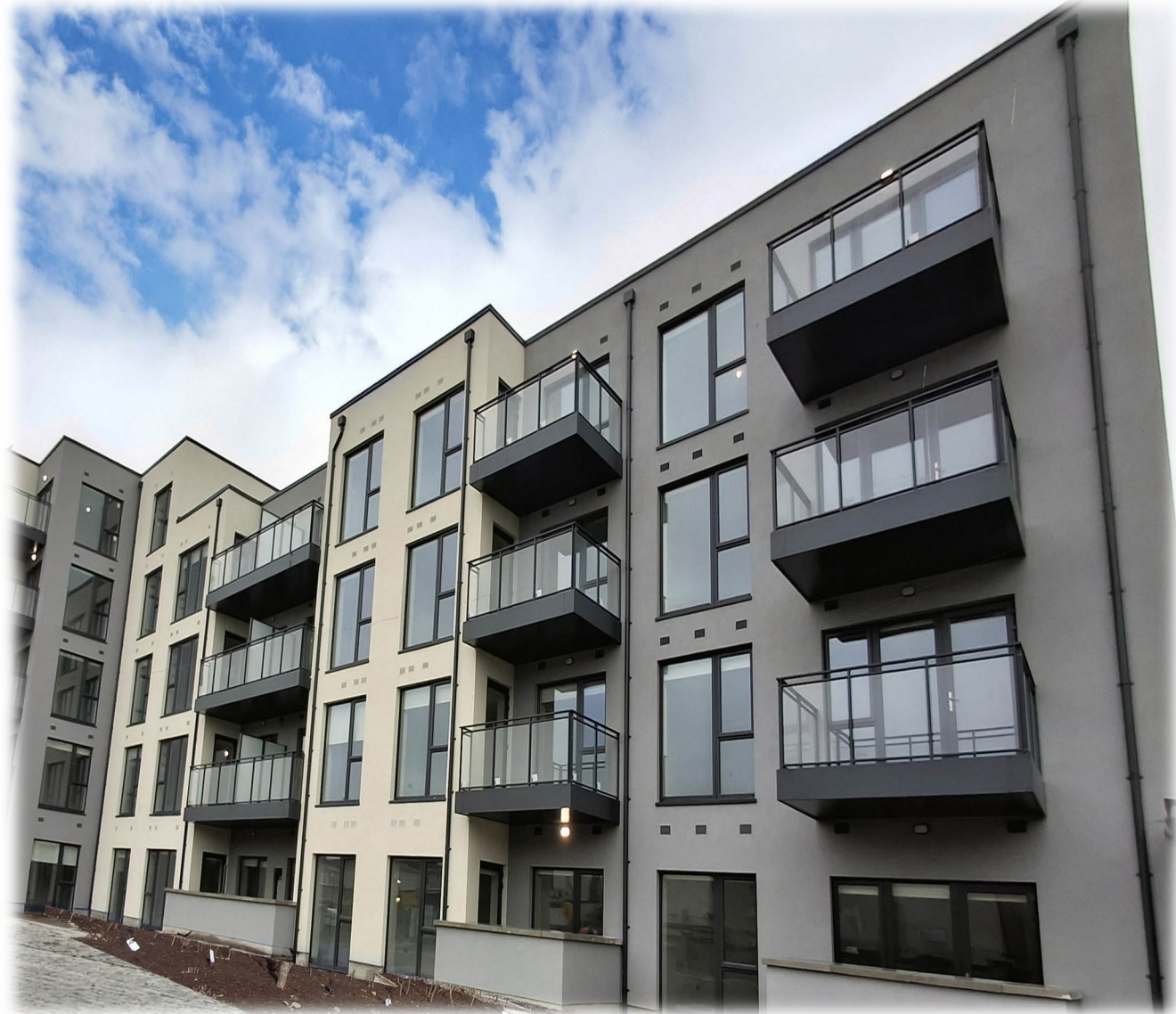
Somerton, Lucan, Co. Dublin