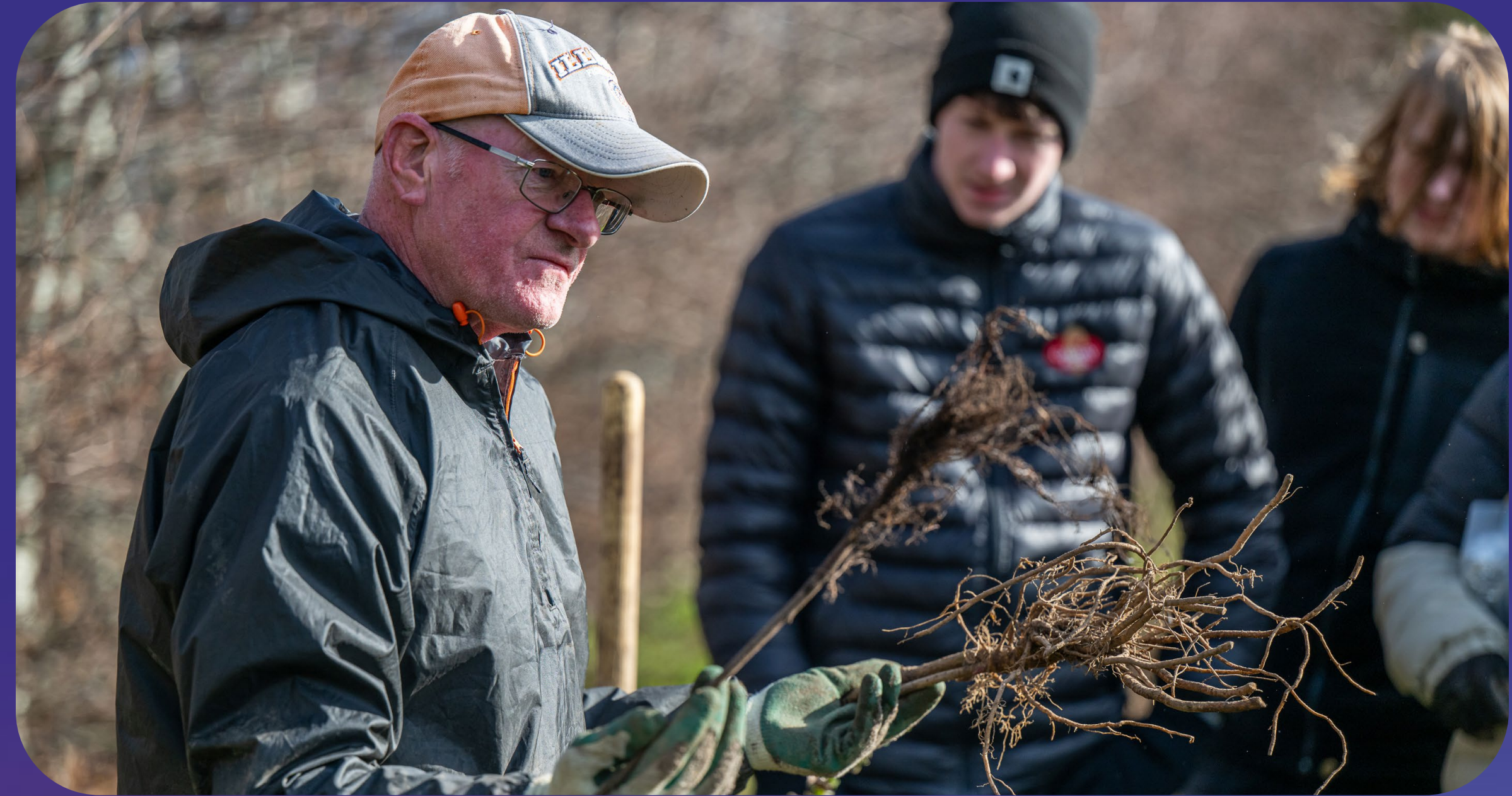
Tree planting at woodstown park