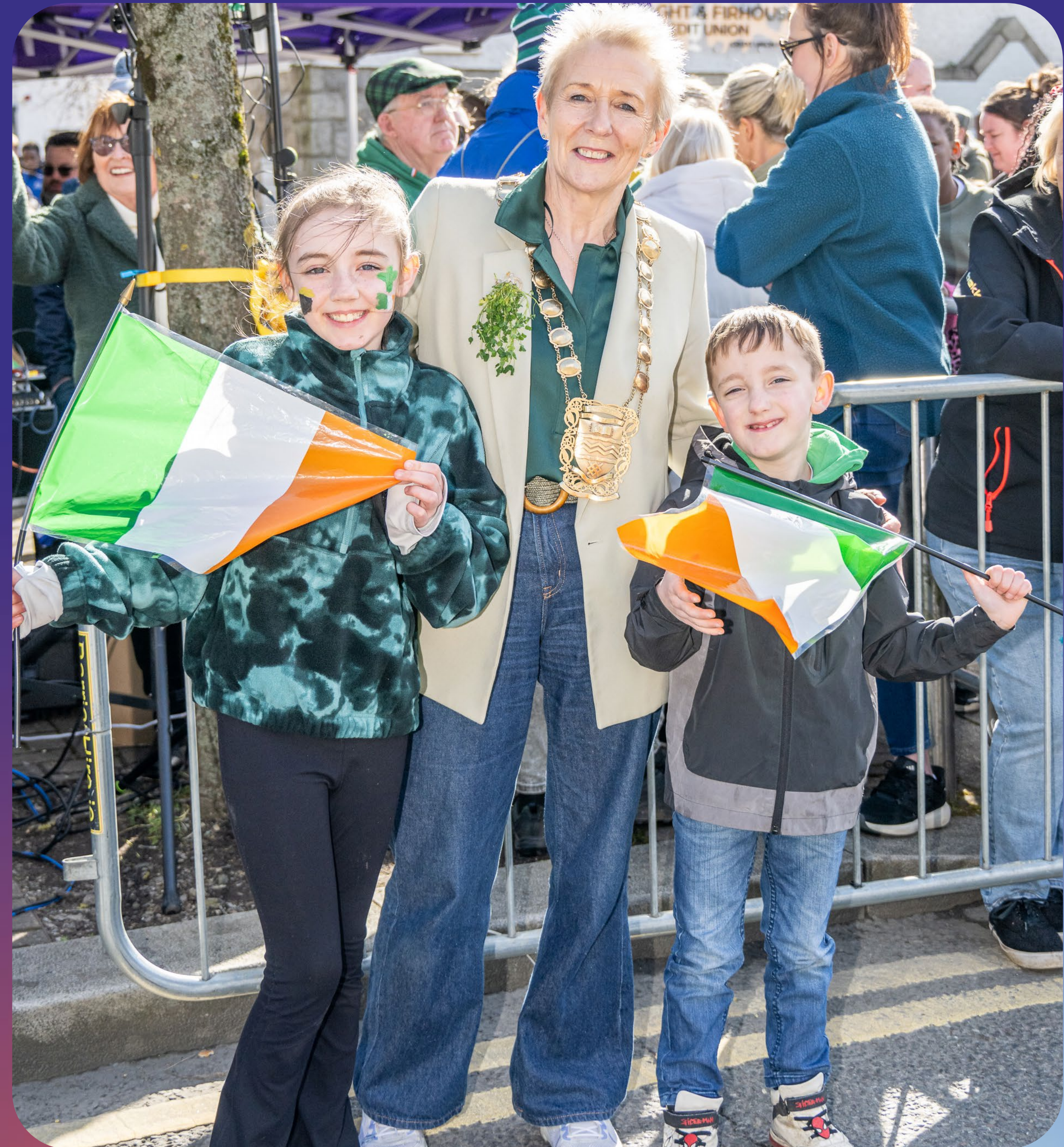
Tallaght St. Patricks day parade