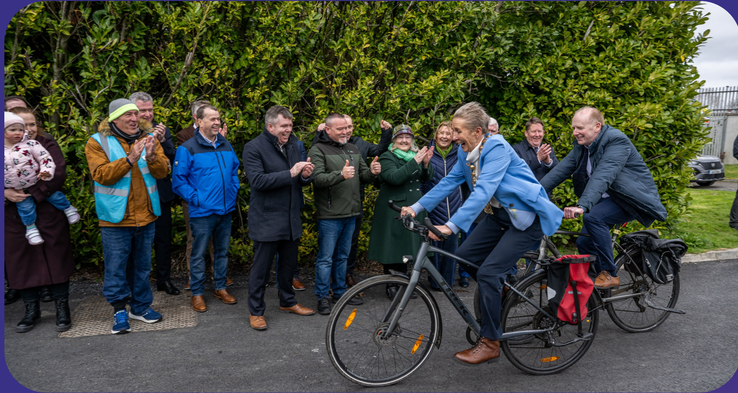
Opening of the 12th lock greenway