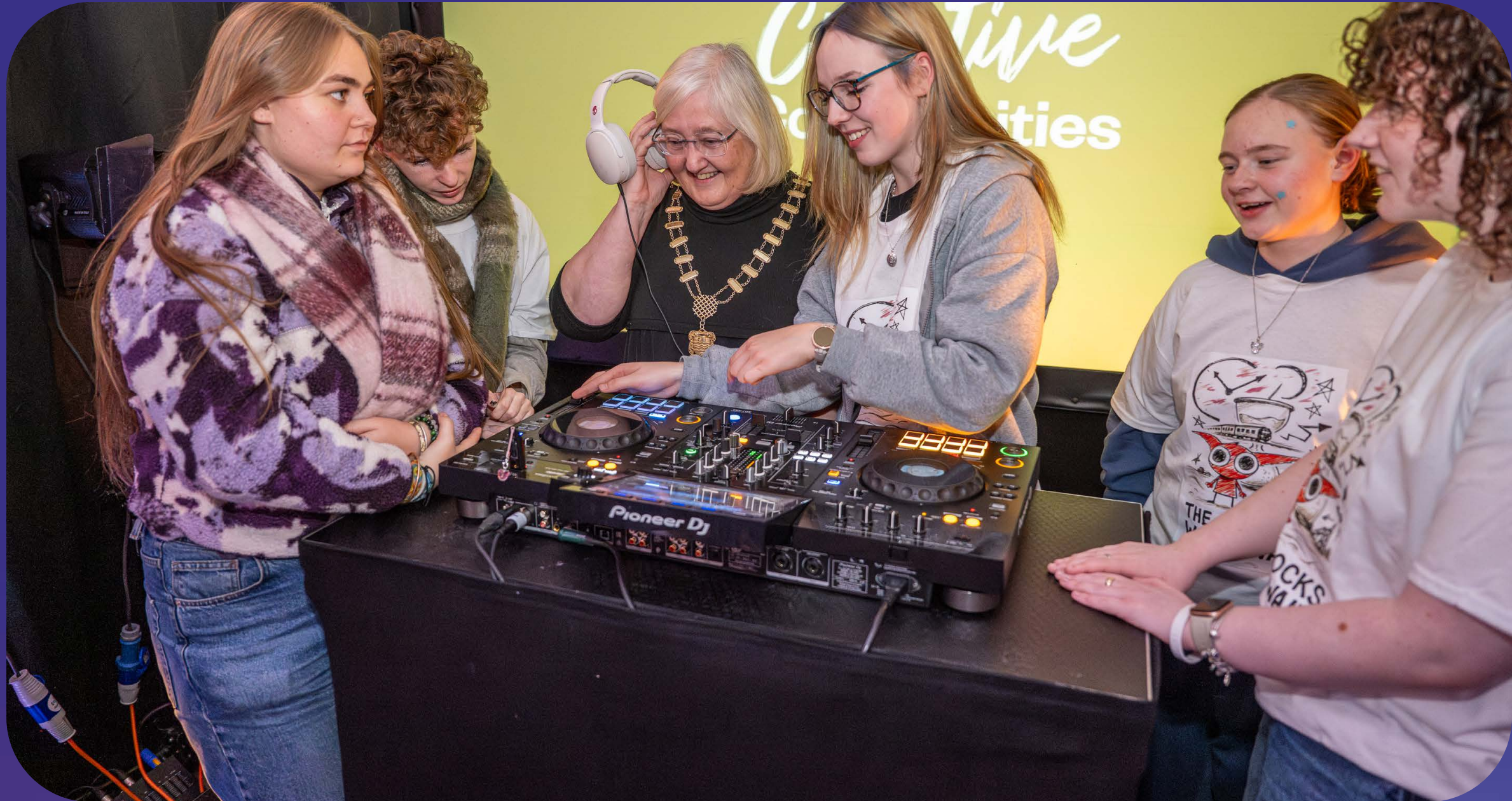
Creative Communities youth art project