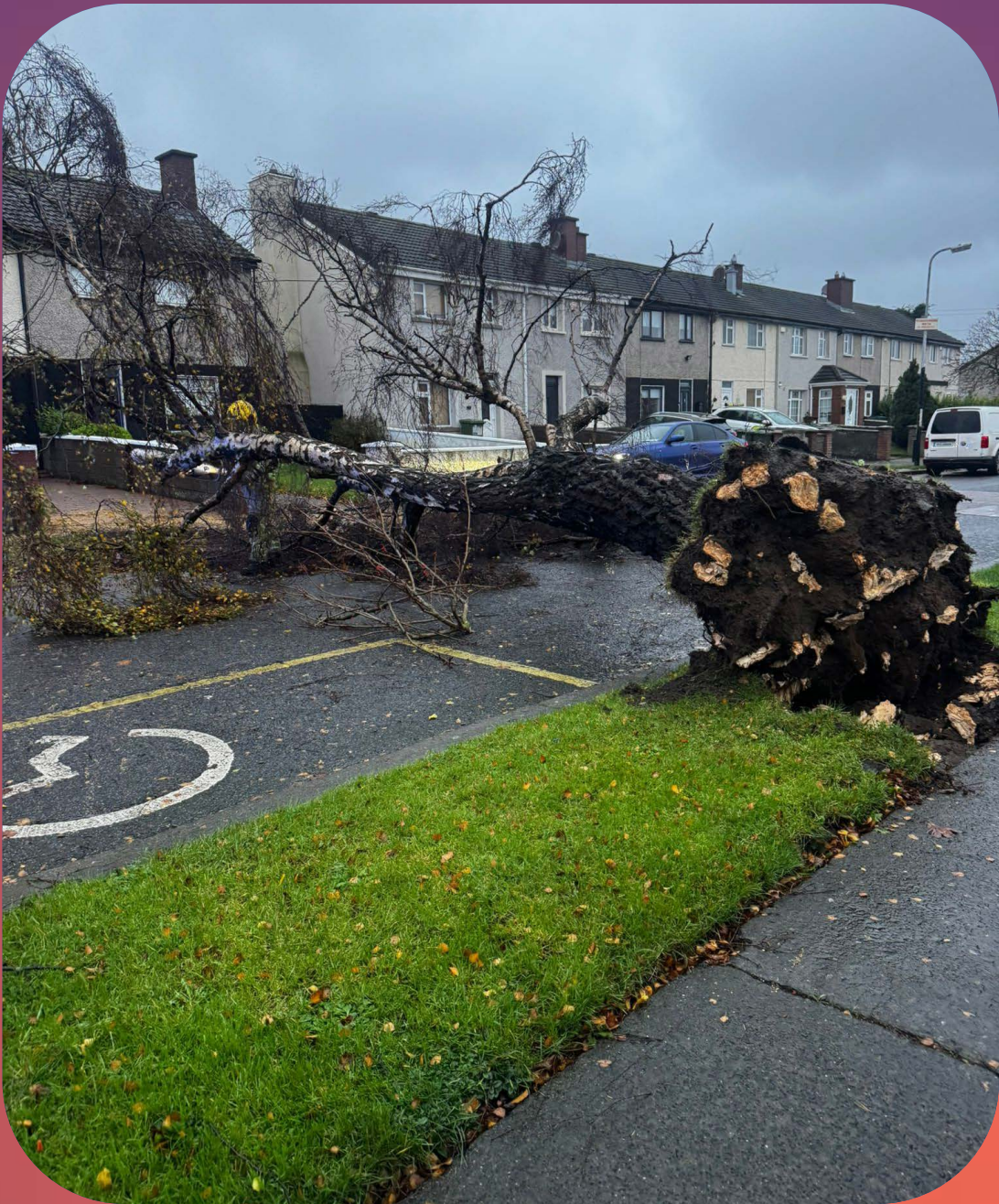
Summary of Severe Weather-related incidents reported to SDCC during the Orange weather alert

water levels and flooding, preventing impacts elsewhere on more vulnerable infrastructure such as roads and properties, and these areas fulfilled that purpose over the weekend. Our pitches were closed and some areas in parks were fenced off for safety reasons.