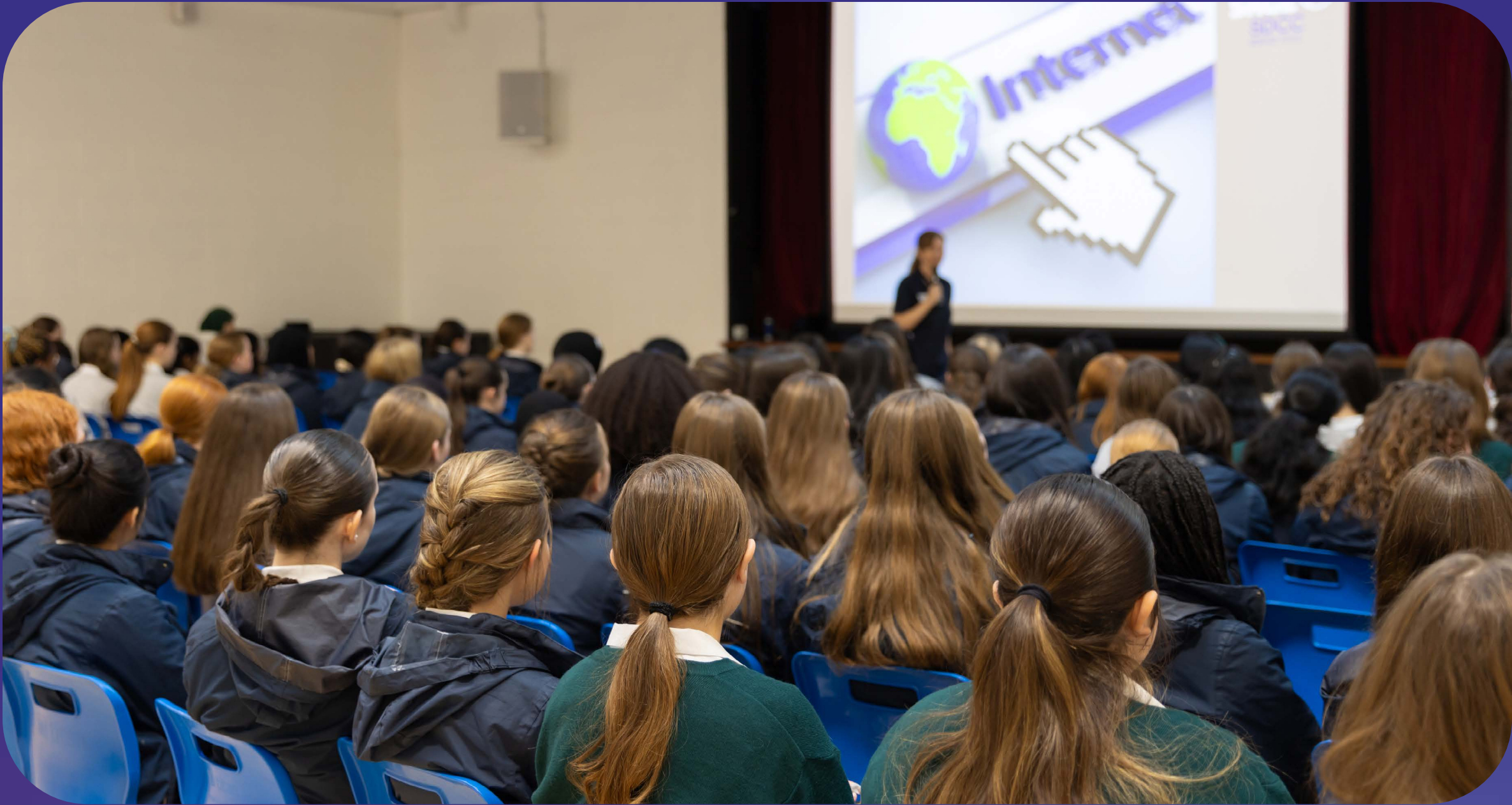
Cyber talk at St Josephs Lucan