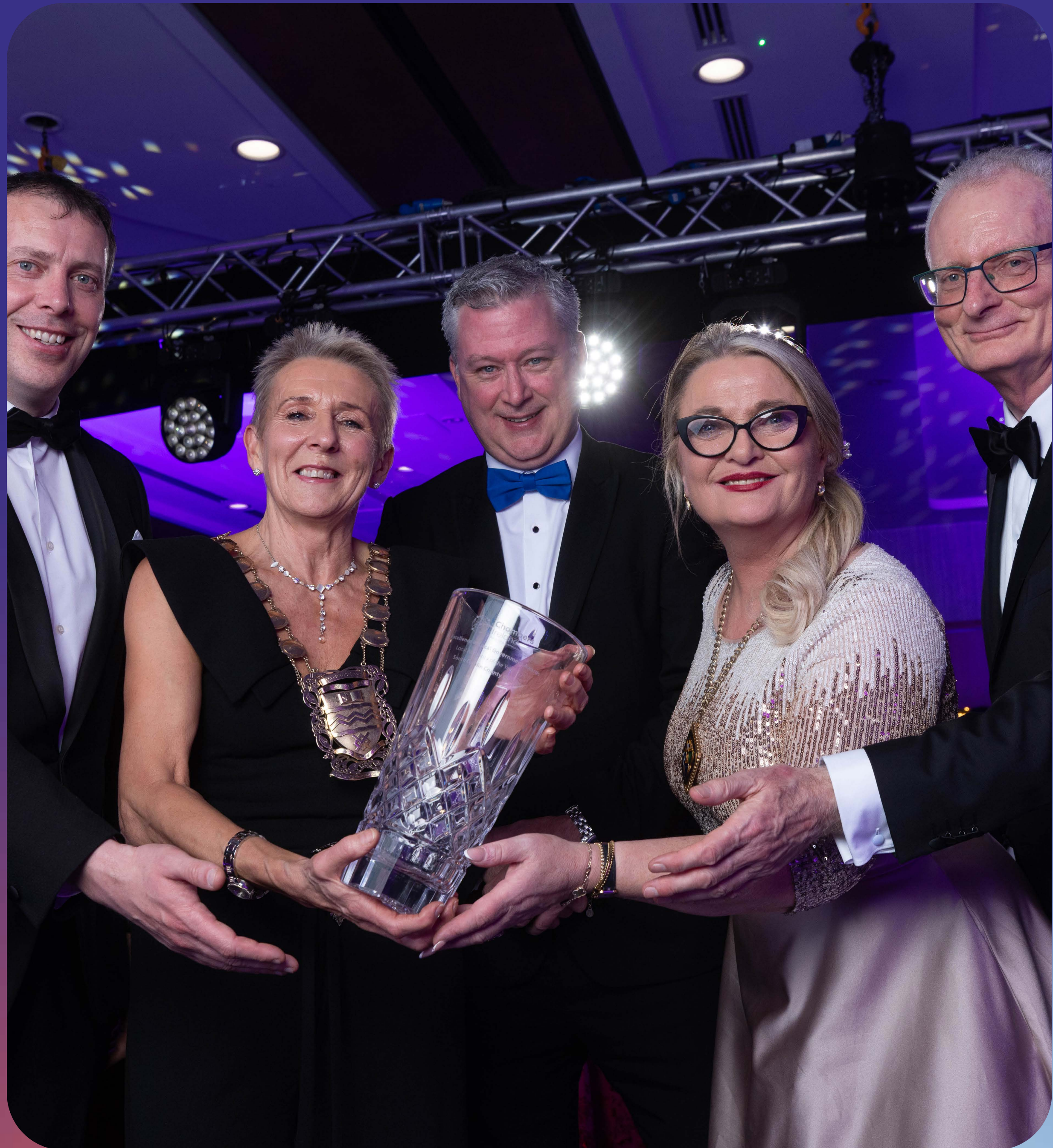
SDCC named Local Authority of the Year 2025