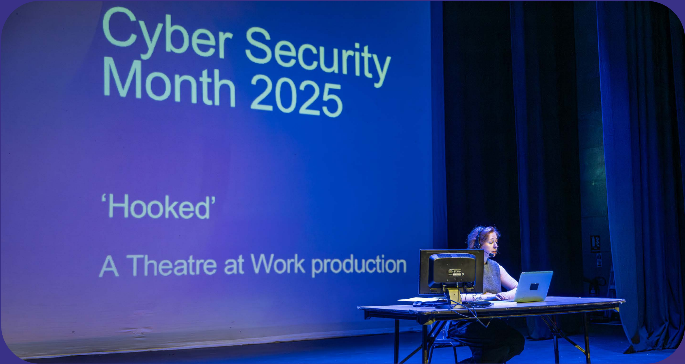
Cyber Security Month