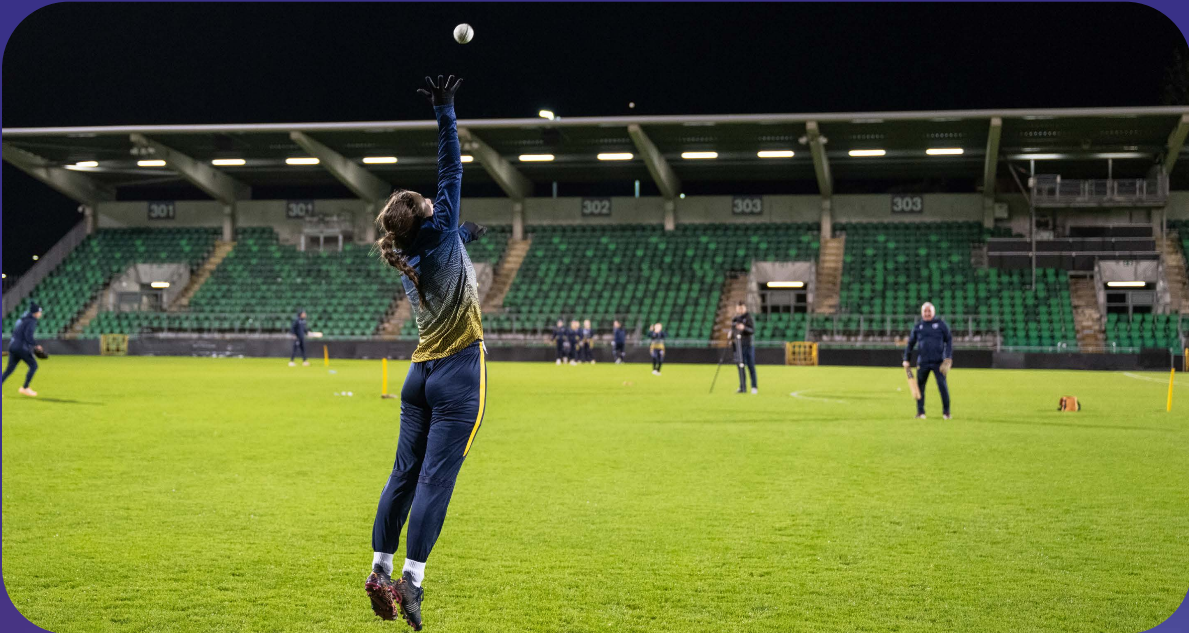
Women's Cricket Ireland training at Tallaght Stadium