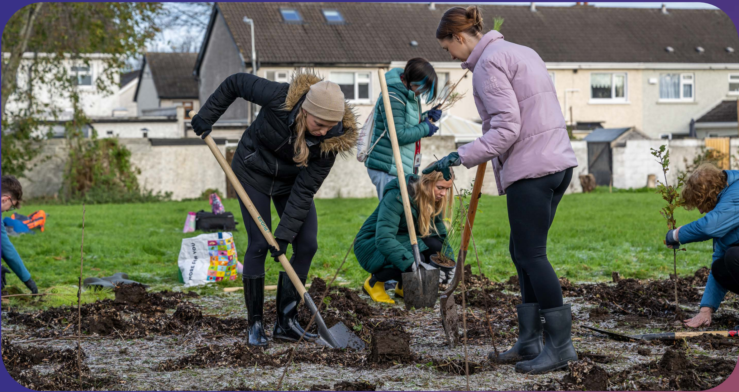
Mini woodland planting at Oakwood Grove