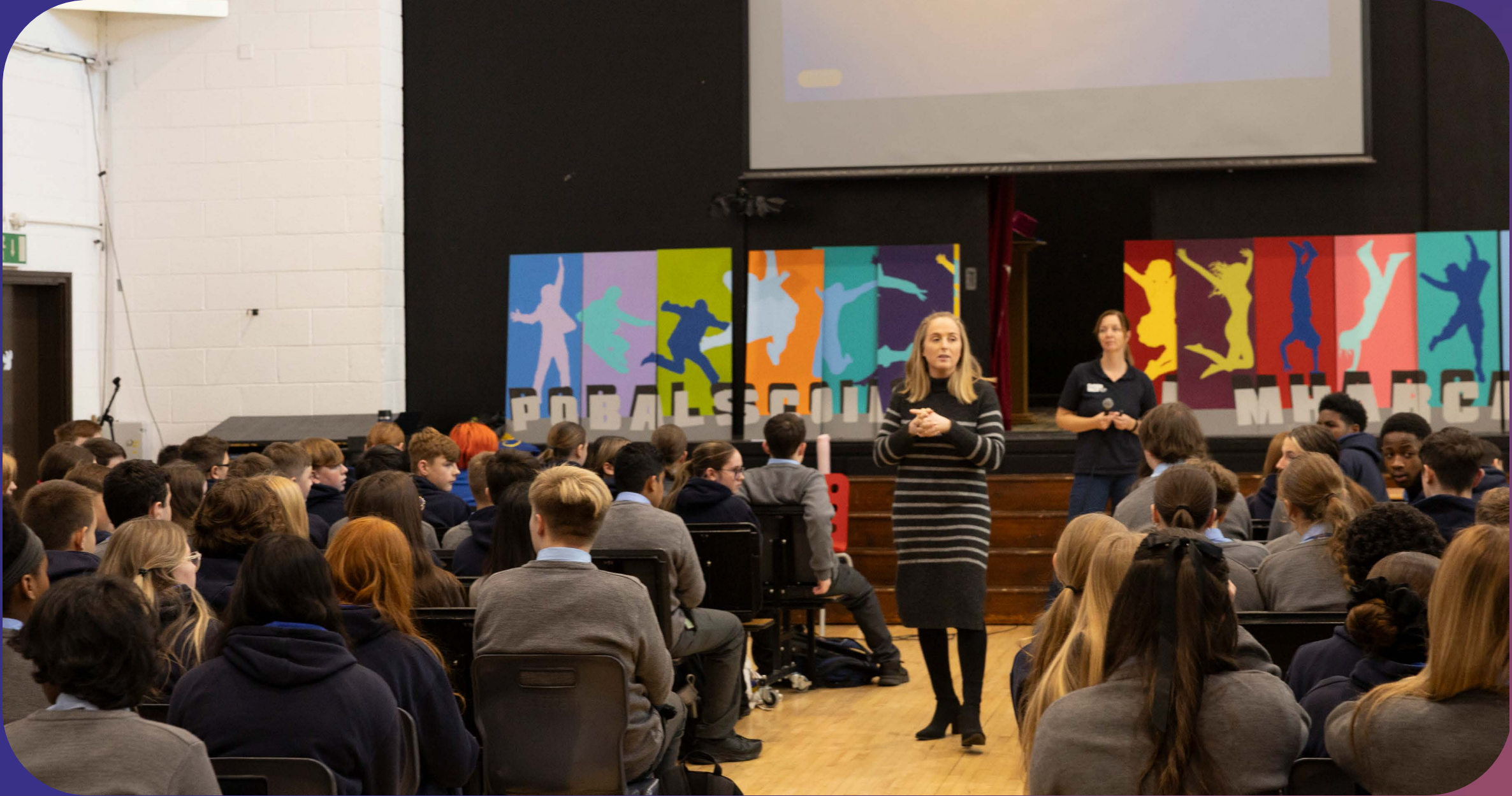
Cyber talk at St. Marks