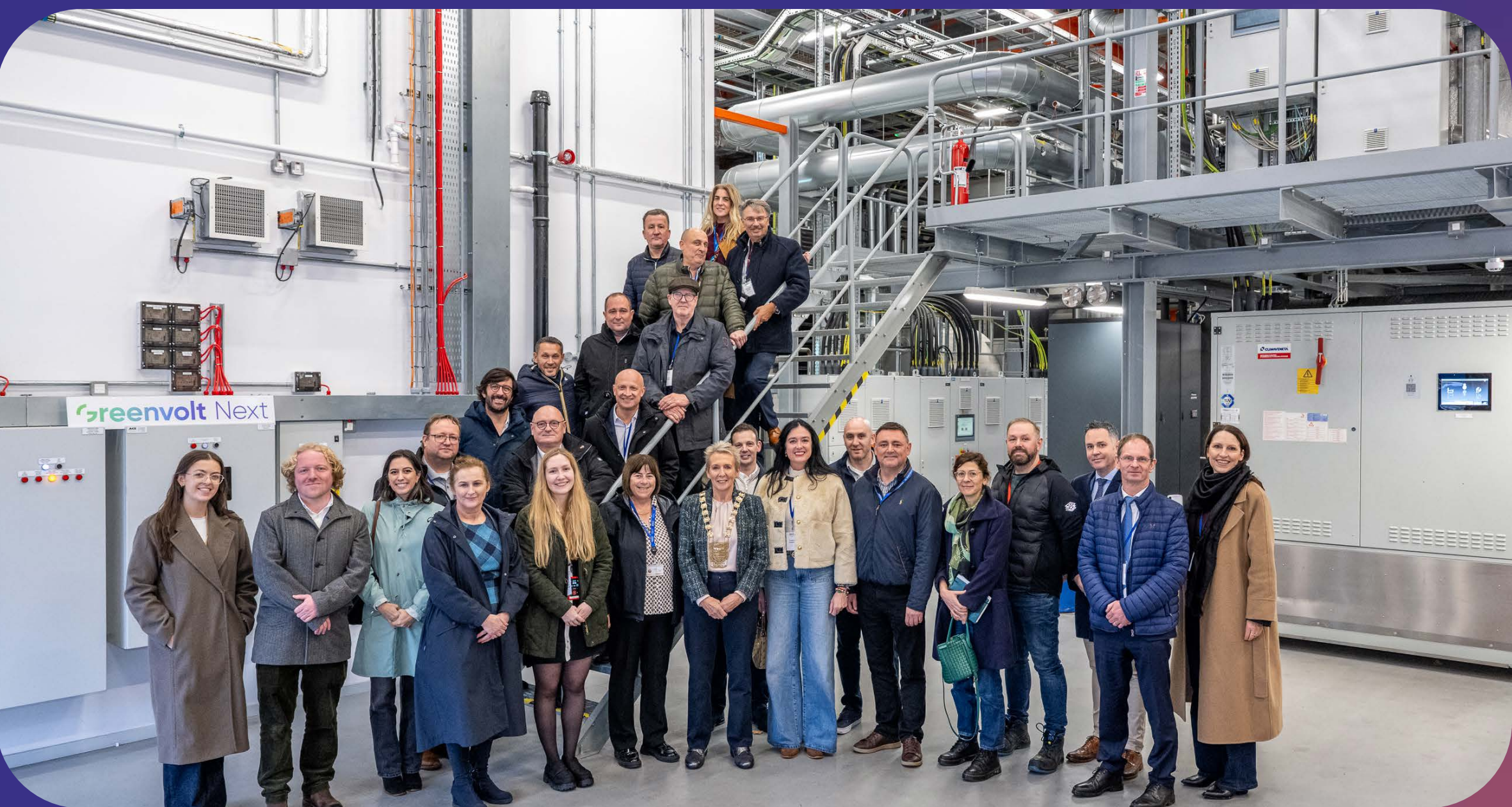
Tour of Heatworks plant