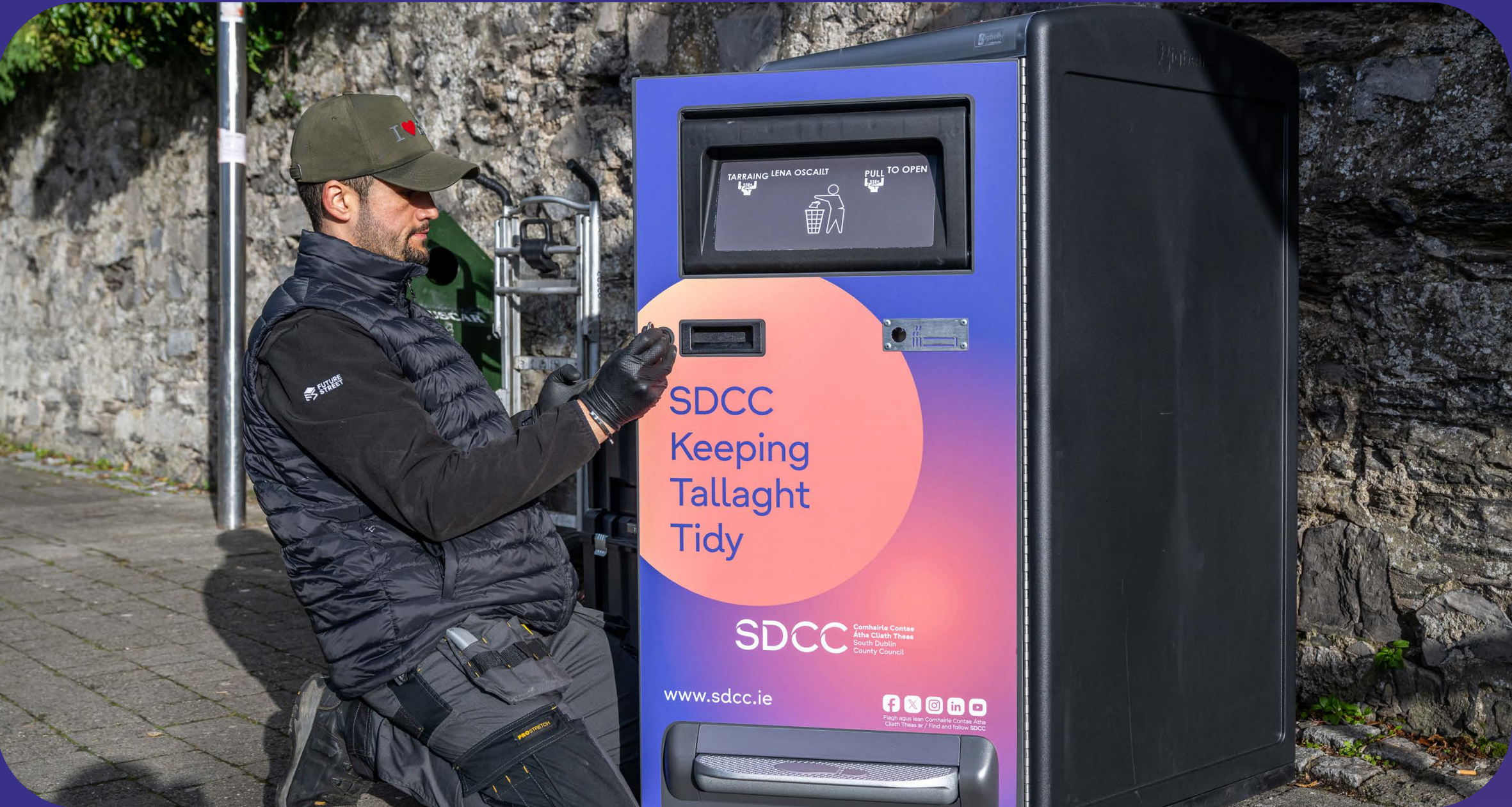
Installation of Big Belly Bins