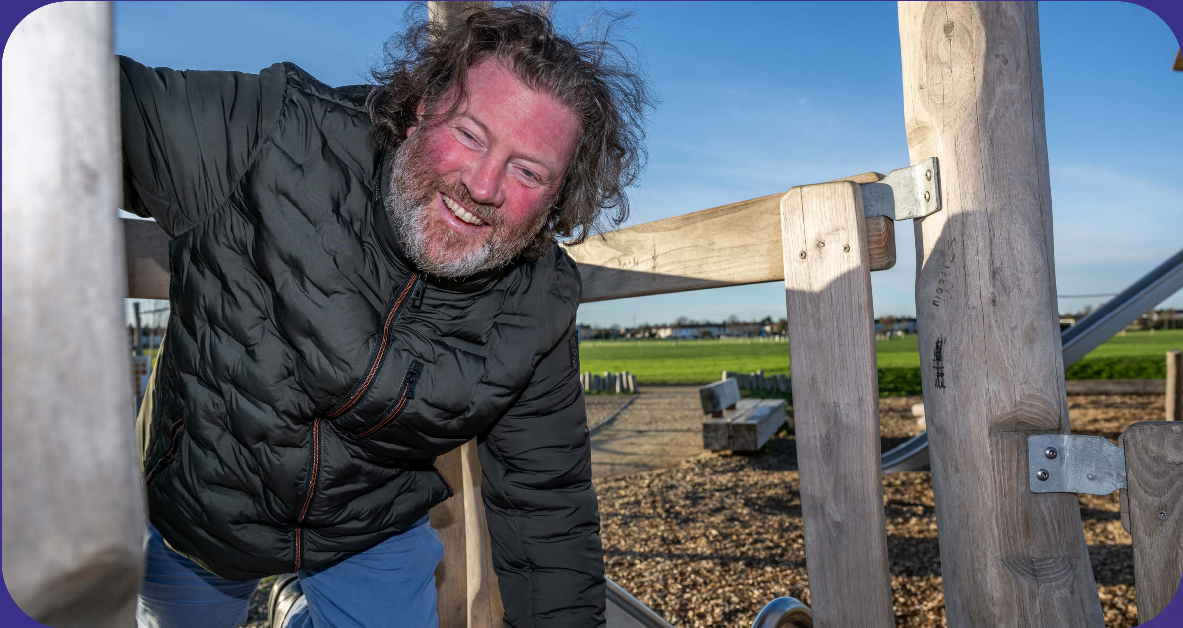
Green flag awarded for Jobstown Park