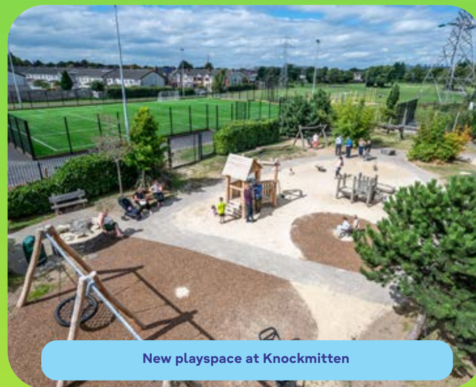
New playspace at Knockmitten

An updated leaflet on how to be a better dog owner with useful information and advice has been produced to coincide with the campaign and this was distributed via social media and at events in our parks which were attended by various SDCC staff including dog wardens, park rangers and litter wardens along with our licencing and enforcement team. Please see www.sdcc.ie for more information.