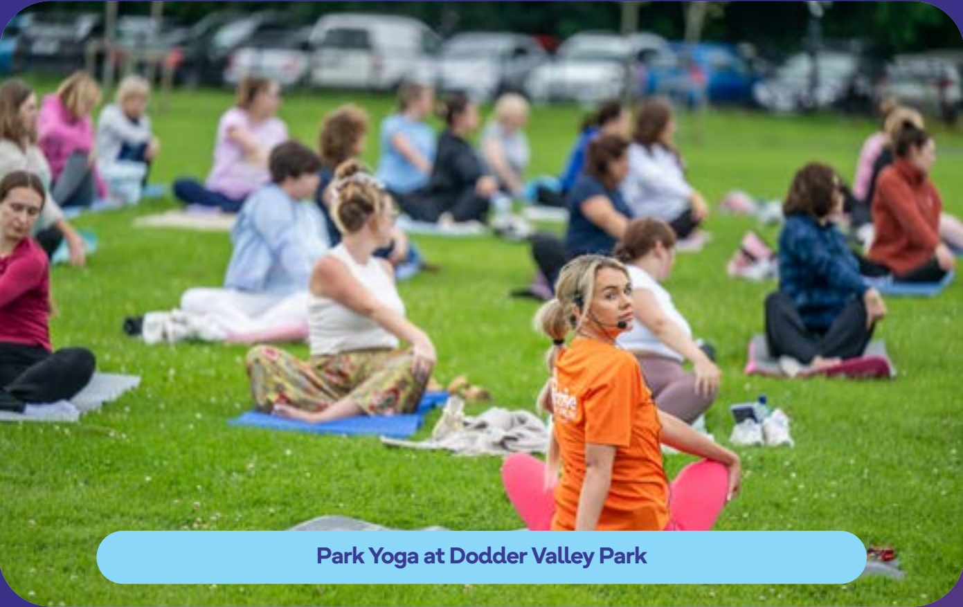
Park Yoga at Dodder Valley Park