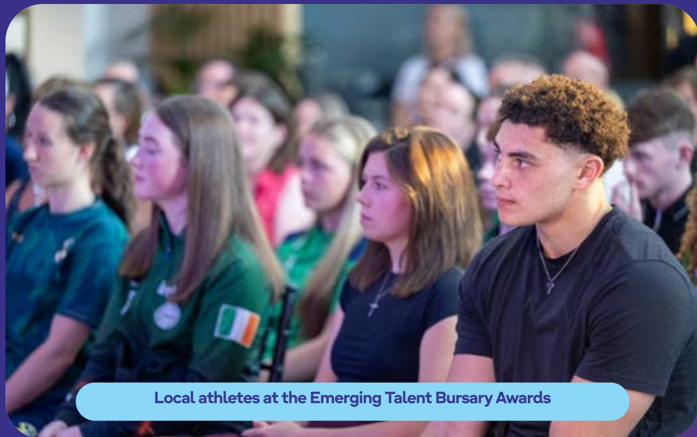
Local athletes at the Emerging Talent Bursary Awards