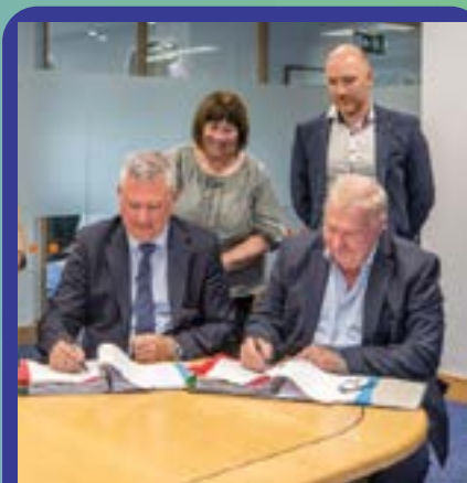
Pavilion contract signing

events, supporting health and wellbeing and maximizing local opportunities for participation in our wonderful parks and open spaces.