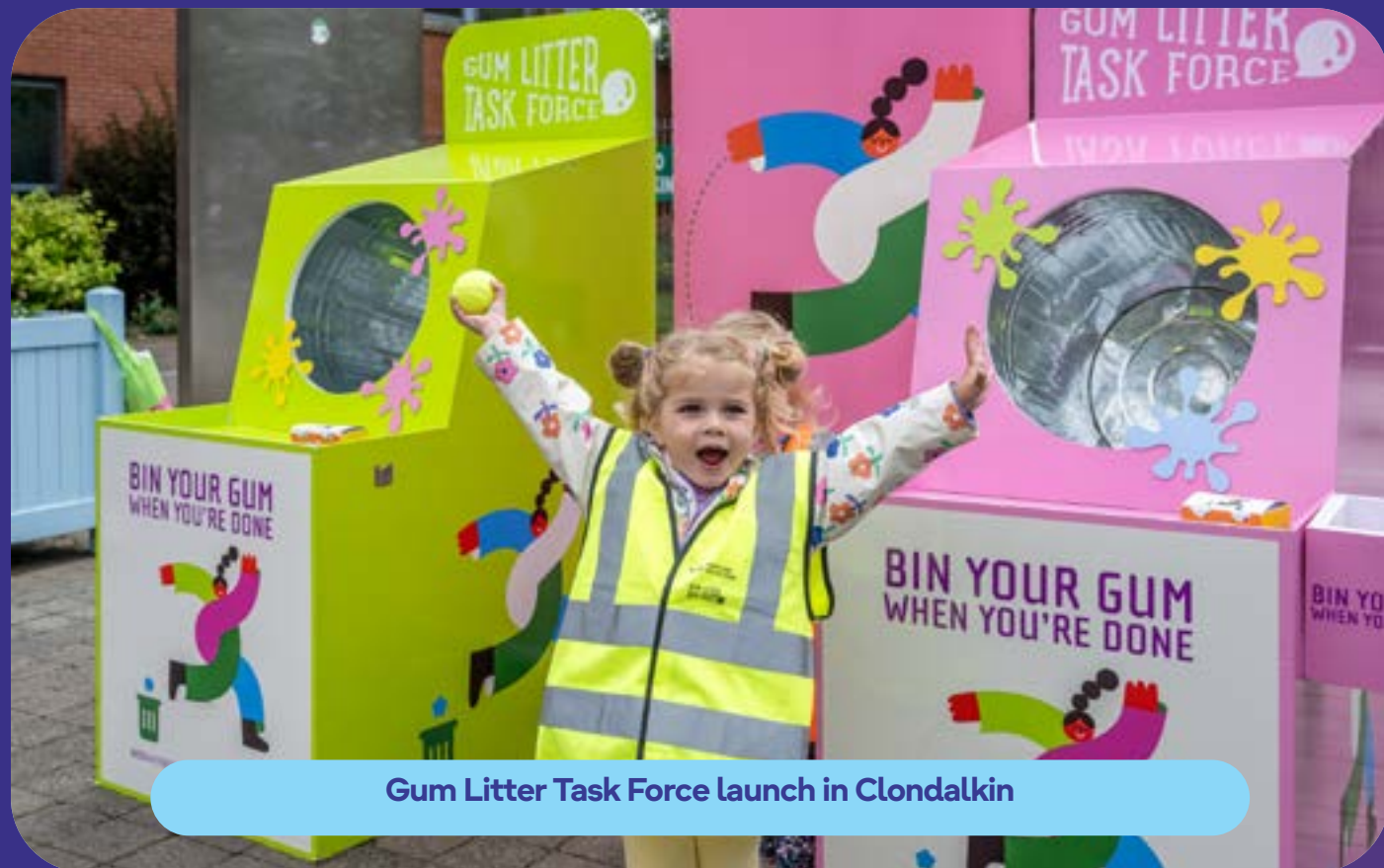
Gum Litter Task Force launch in Clondalkin