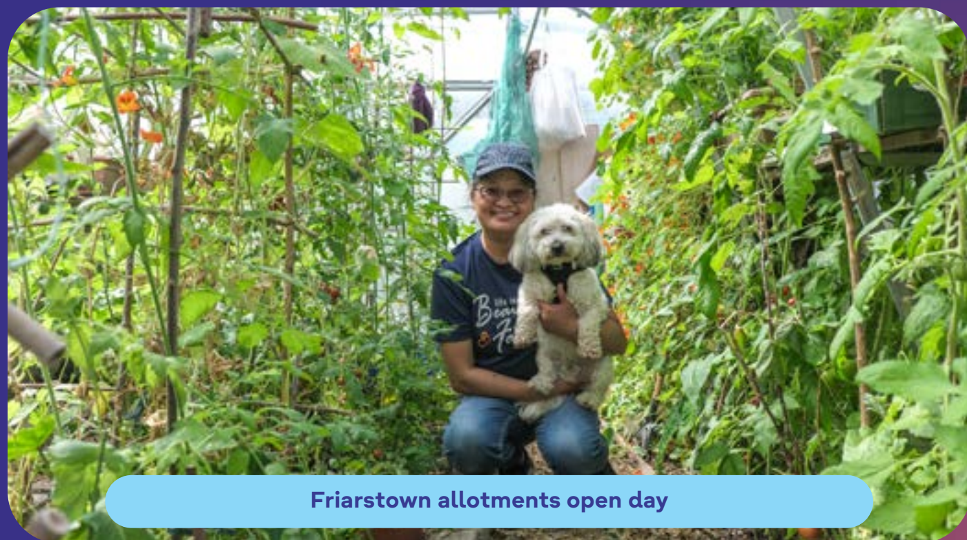
Friarstown allotments open day