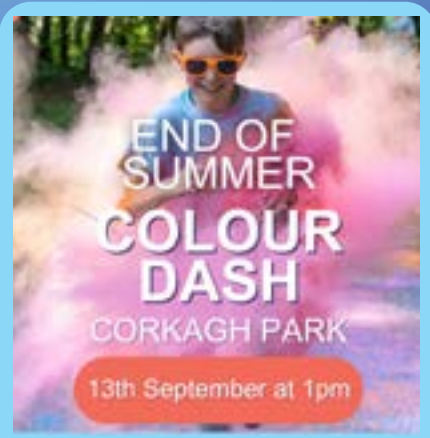
Popular Colour Dash is back at Corkagh Park