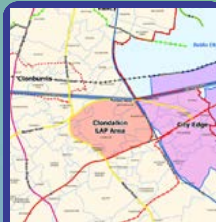
Clondalkin Local Planning Framework Consultation

capacity and recommendations to meet the objectives of the guidelines will be presented to councillors next month.