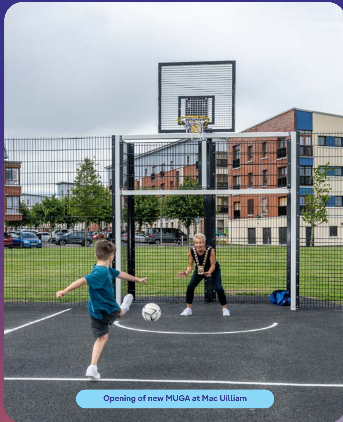
Opening of new MUGA at Mac Uilliam