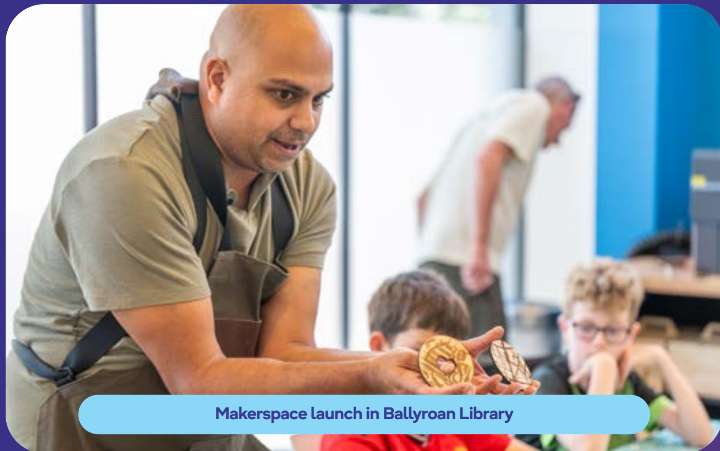
Makerspace launch in Ballyroan Library