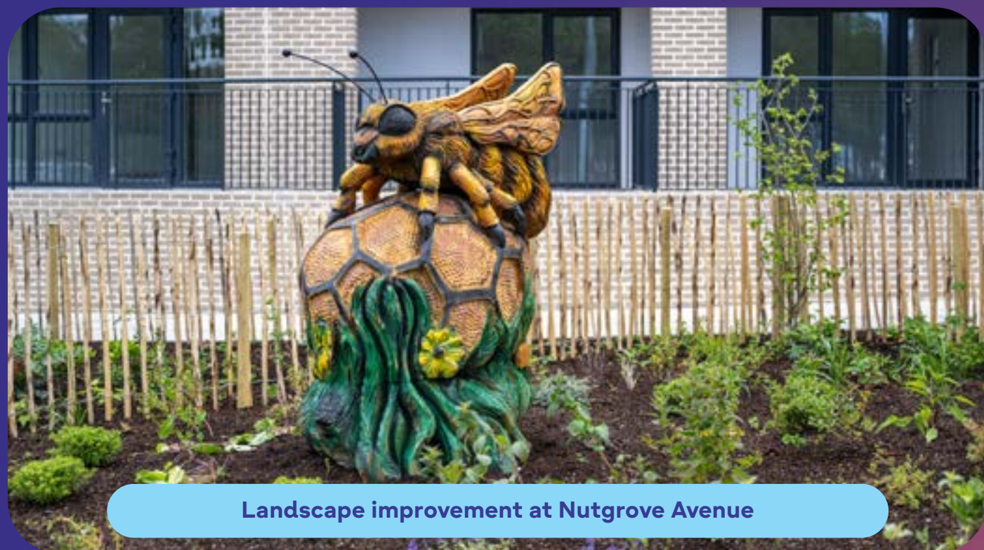
Landscape improvement at Nutgrove Avenue