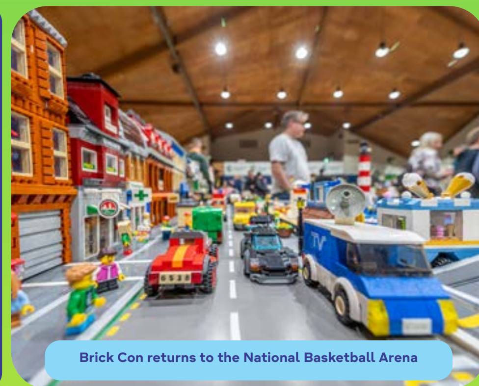
Brick Con returns to the National Basketball Arena

October is Hobby Month in South Dublin with events for all interests. Brick Con brings Ireland's largest LEGO showcase to the National Basketball Arena on 11 and 12 October, featuring custom builds and competitions while Octocon, the National Irish Science Fiction Convention, takes place at the Maldron Hotel in Tallaght the same weekend, celebrating sci-fi, fantasy and horror. On 4 and 5 October, model enthusiasts can visit the IPMS National Exhibition at the Spa Hotel in Lucan while Robo Riots also promises thrilling robot battles at the Basketball Arena.