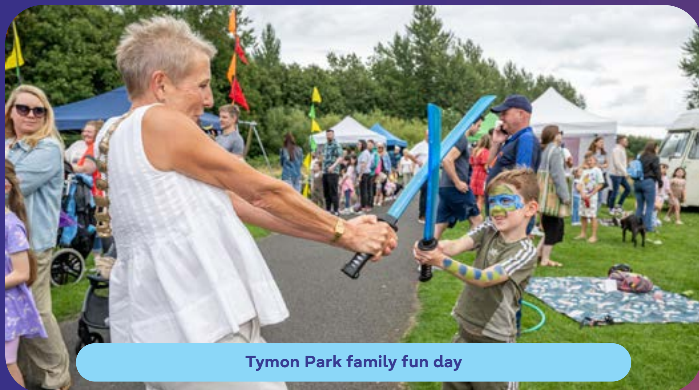
Tymon Park family fun day