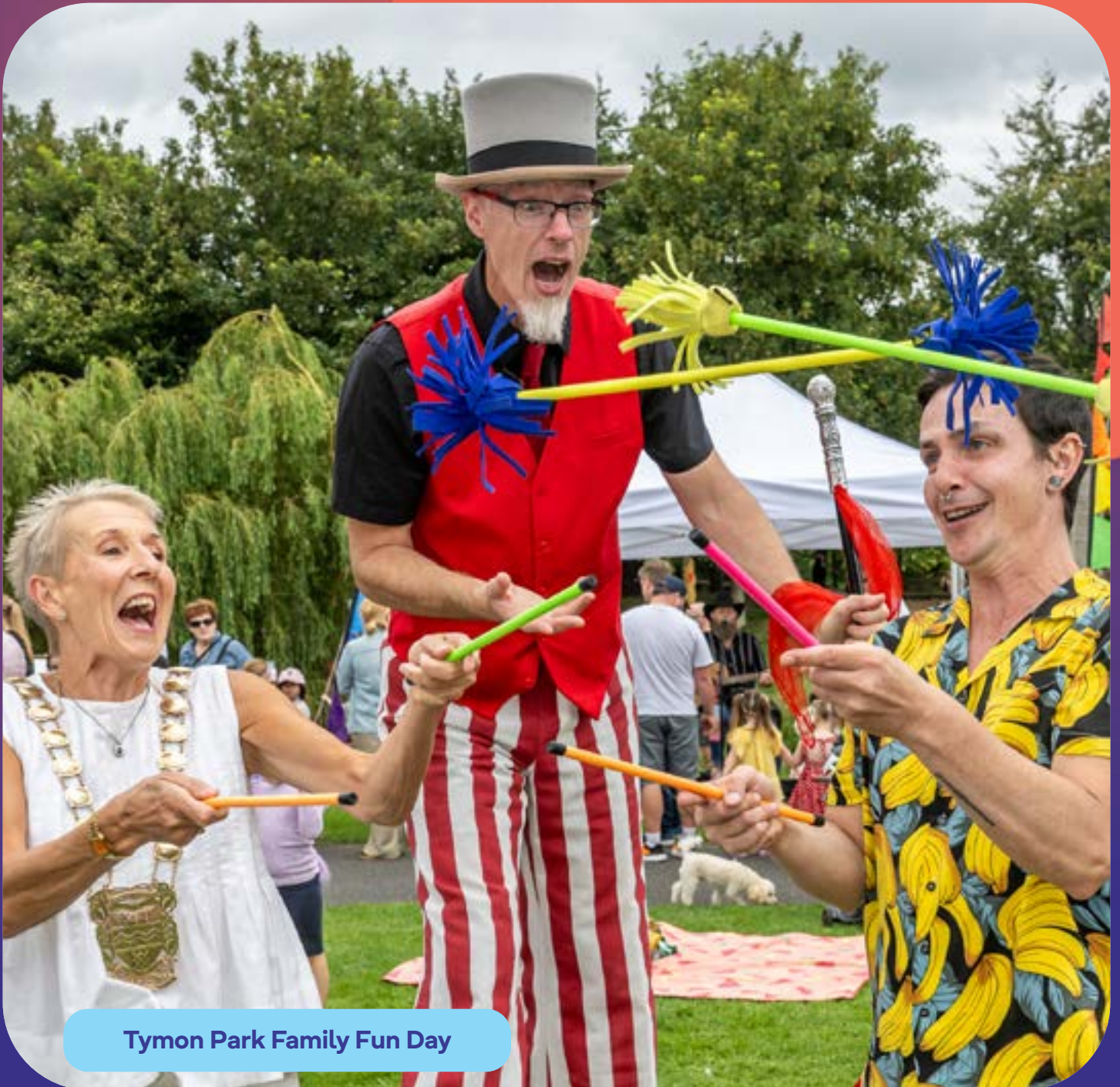
Tymon Park Family Fun Day