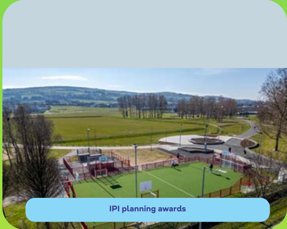
IPI planning awards

The project was delivered by O'Brien Landscaping who will maintain the planting for a 12 month period under the contract and we now plan to engage further with the local community on how to further enhance the village and to maximise the plaza's potential.