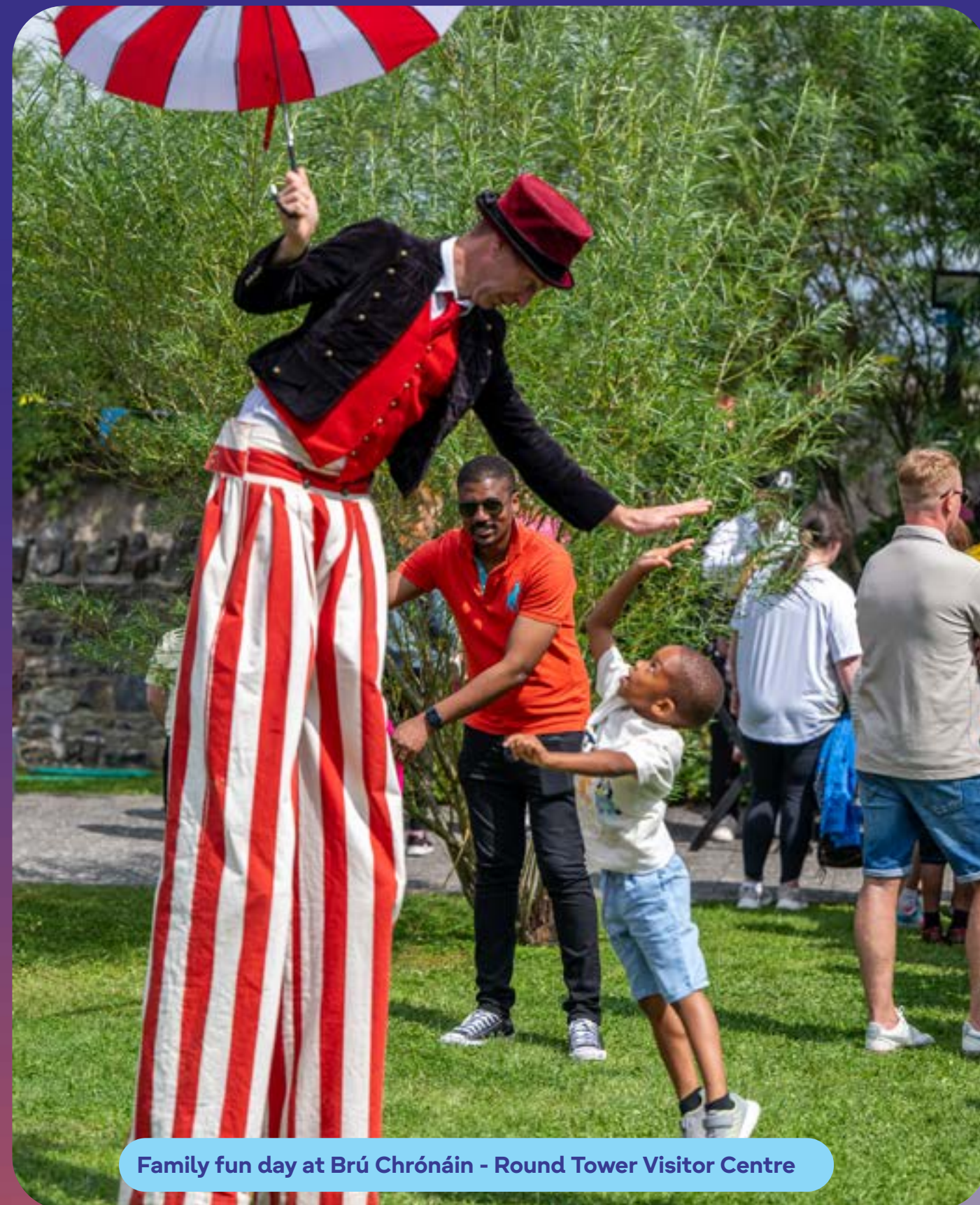
Family fun day at Brú Chrónáin - Round Tower Visitor Centre