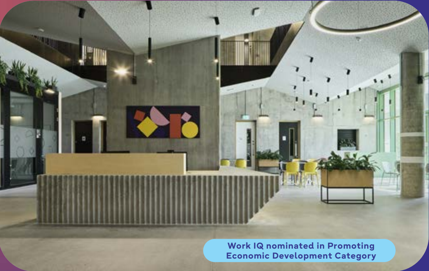
Work IQ nominated in Promoting Economic Development Category

This recognition reflects the commitment and dedication of our staff, elected members and partners to deliver these projects and initiatives as we continue to create greater opportunity for all in South Dublin by being a place that meets the needs and ambitions of everyone here.”