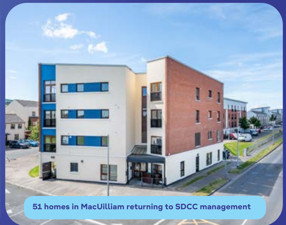
51 homes in MacUilliam returning to SDCC management

Completed by our construction partners Cleary Doyle supported by SDCC Architectural Services, this high-quality development consists of seven three-bedroom houses and nine two-bedroom apartments and provides modern and energy efficient new homes that will contribute to meeting local housing need under our housing delivery action plan.