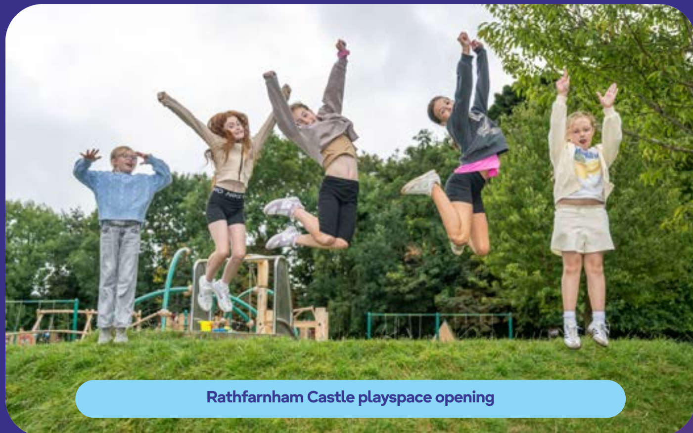
Rathfarnham Castle playspace opening