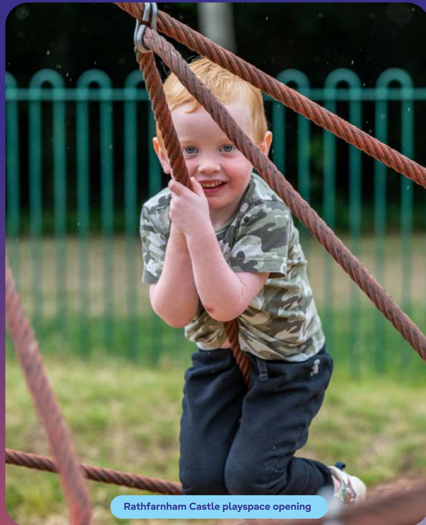
Rathfarnham Castle playspace opening