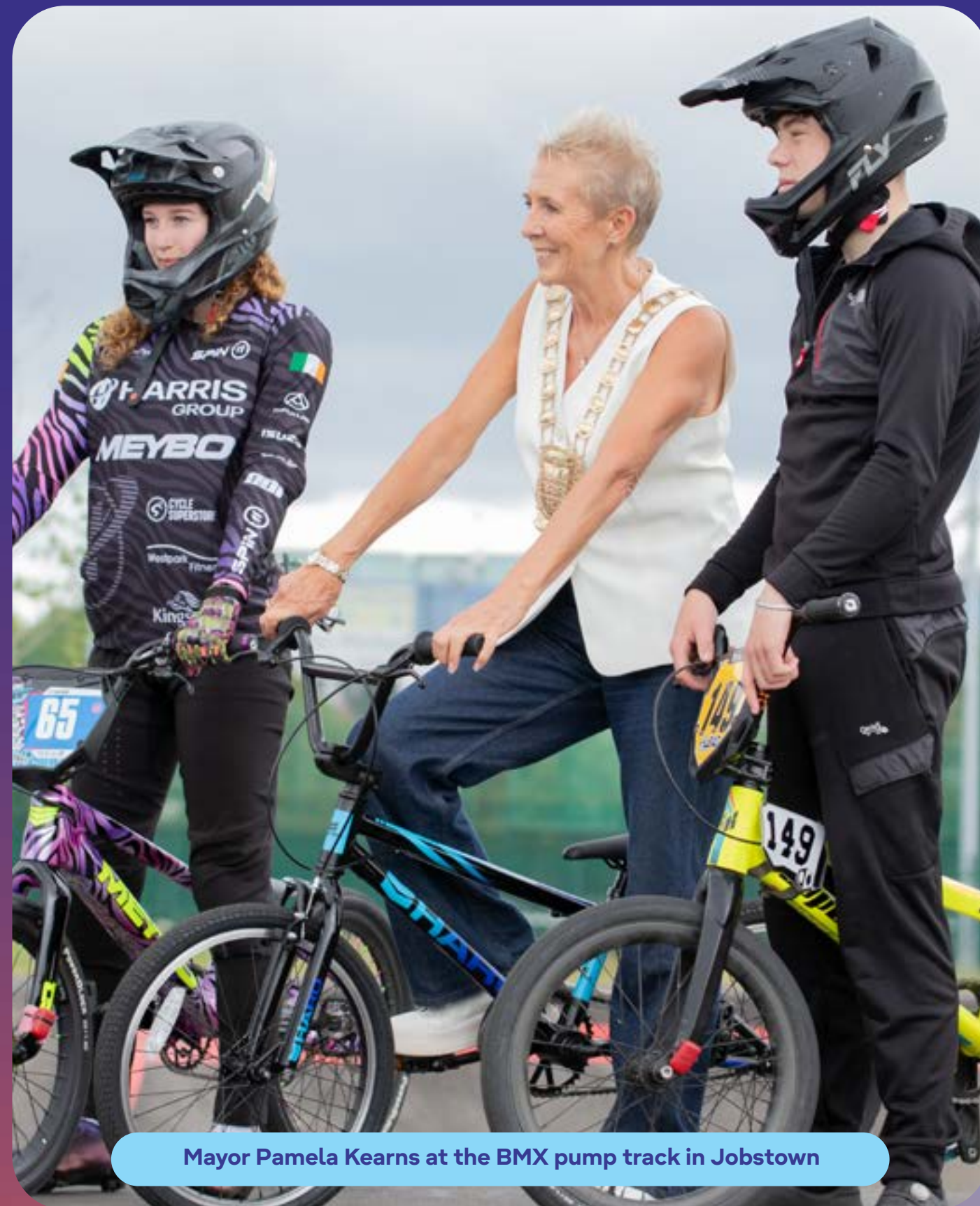
Mayor Pamela Kearns at the BMX pump track in Jobstown