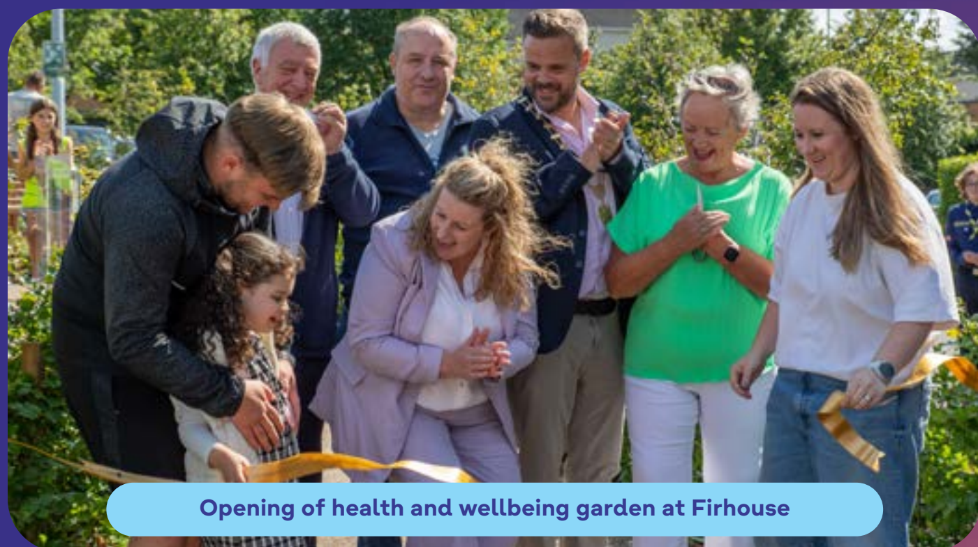
Opening of health and wellbeing garden at Firhouse