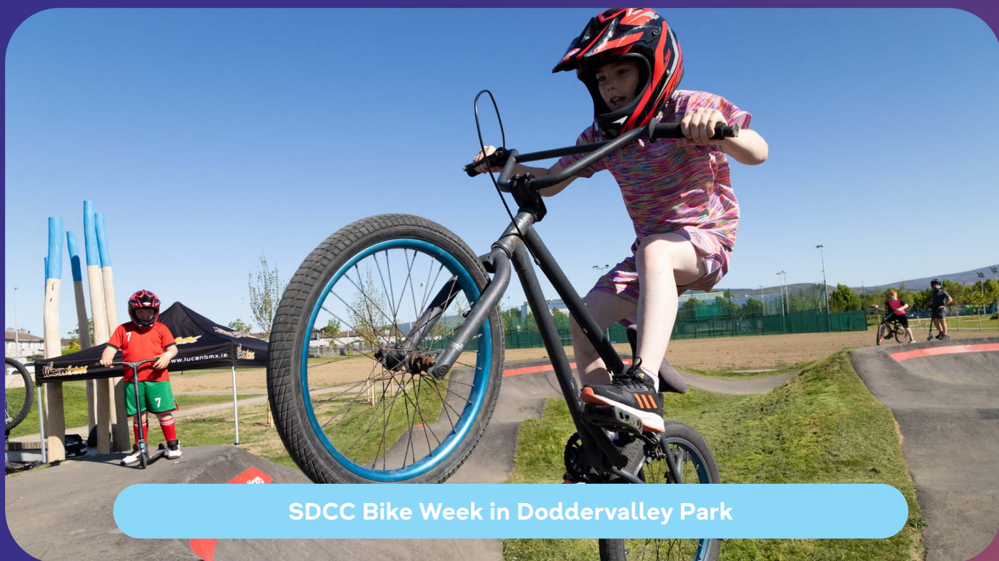
SDCC Bike Week in Dodder Valley Park