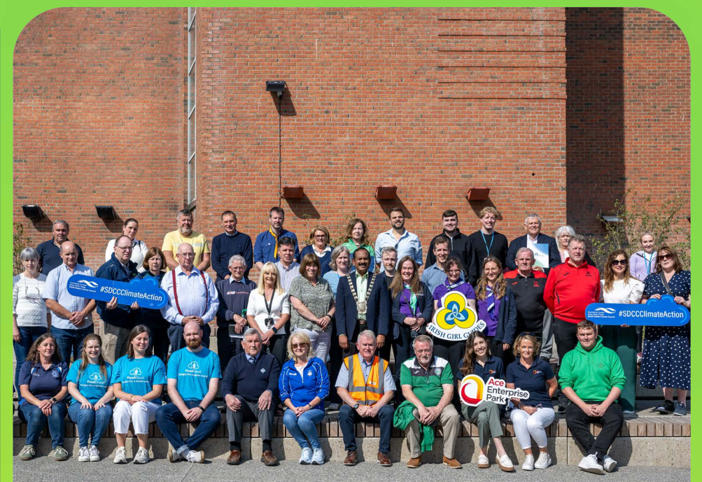
Community climate action projects are underway

Let's take action for cleaner and more sustainable communities.