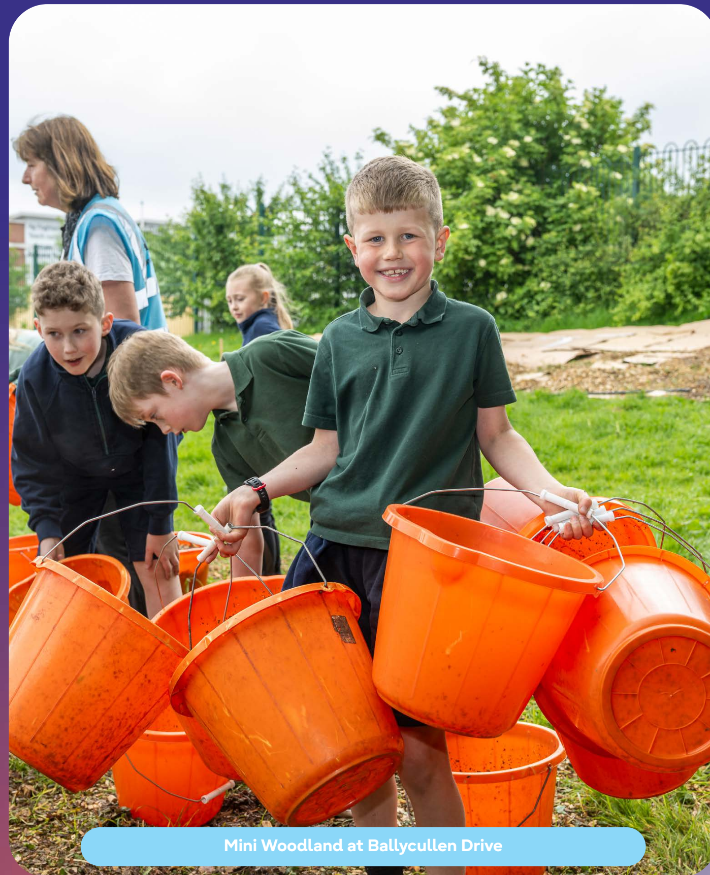
Mini Woodland at Ballycullen Drive