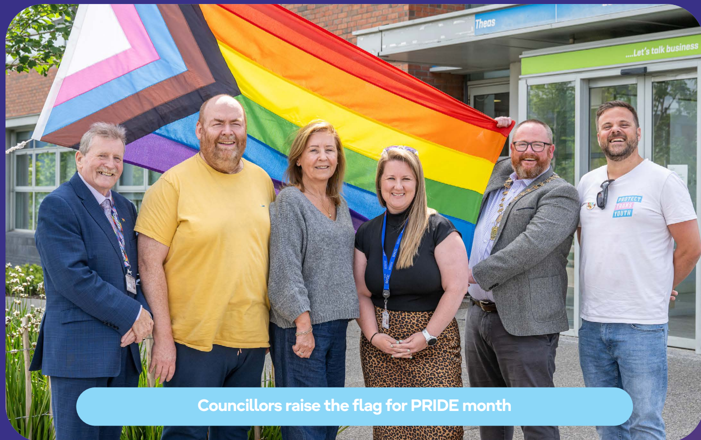
Councillors raise the flag for PRIDE month