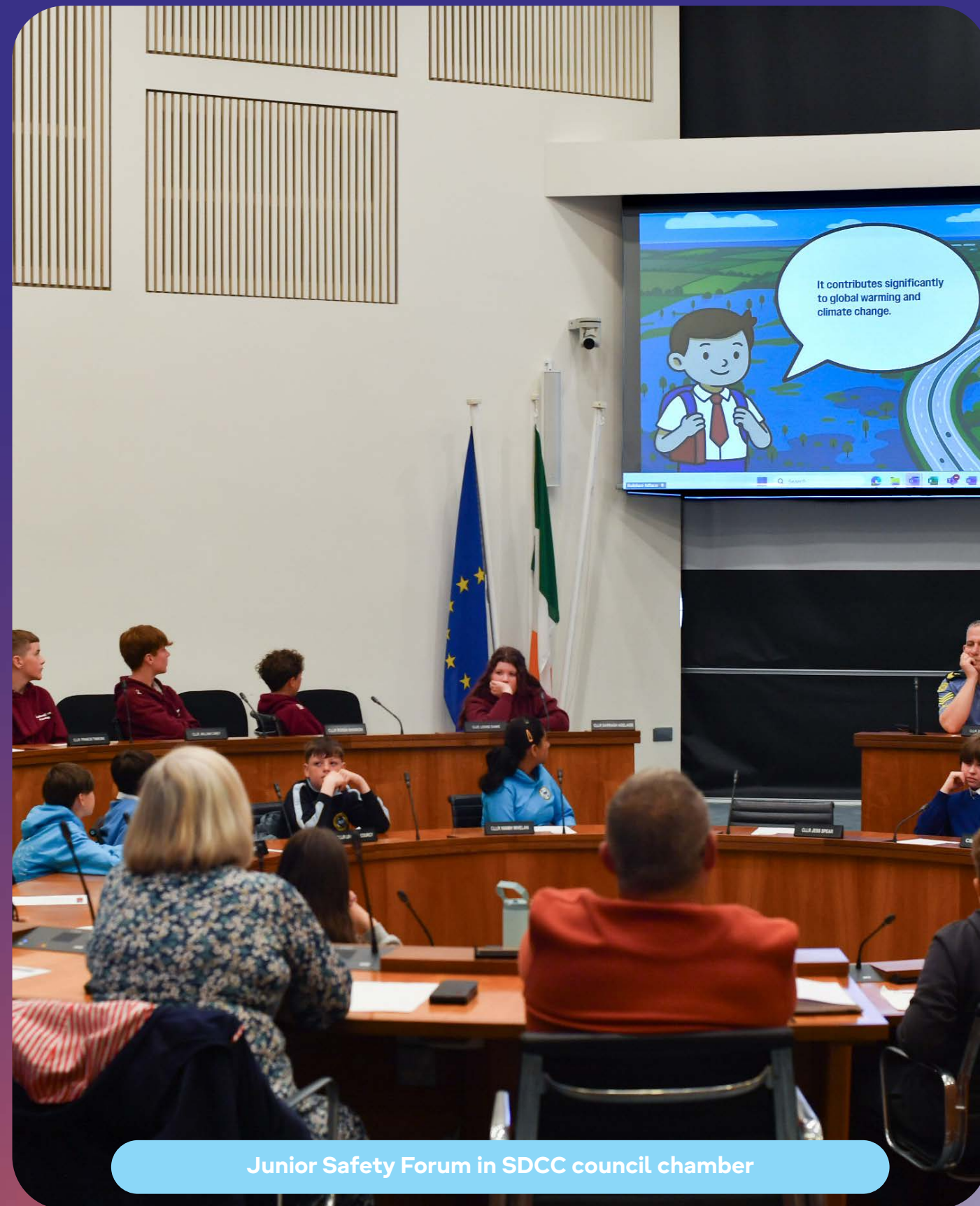
Junior Safety Forum in SDCC council chamber