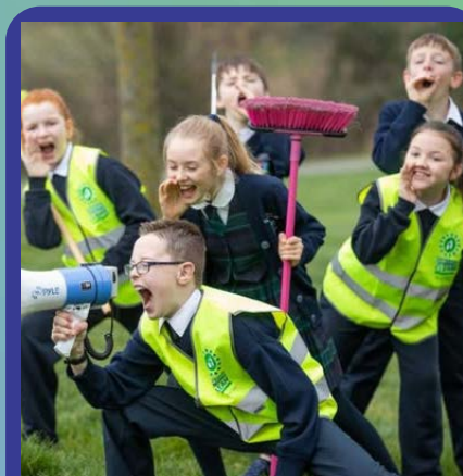
Anti-litter & anti-graffiti grants announced for 2025

provide modern changing facilities in our larger parks with the contract signing for manufacture and installation of modular pavilions.