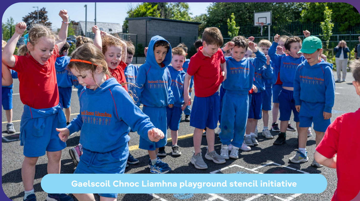
Gaelscoil Chnoc Liamhna playground stencil initiative