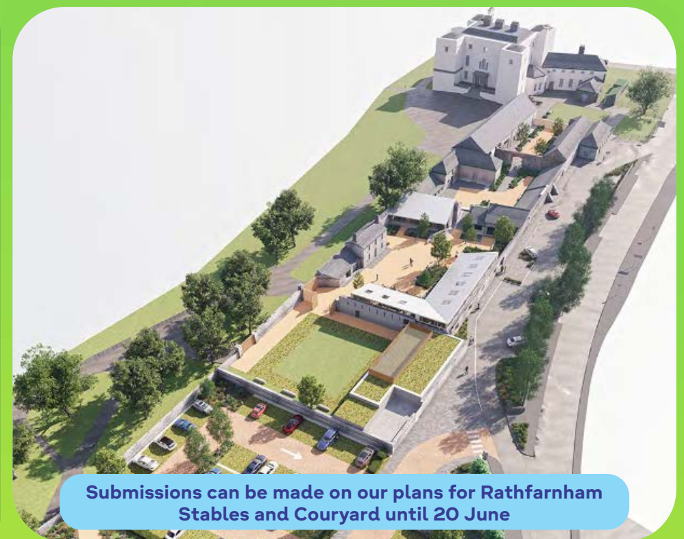
Submissions can be made on our plans for Rathfarnham Stables and Courtyard until 20 June