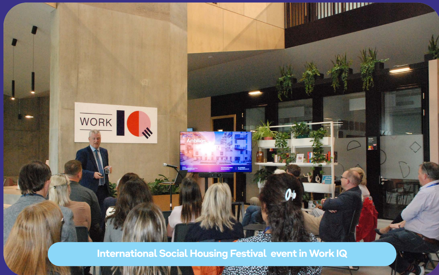
International Social Housing Festival event in Work IQ