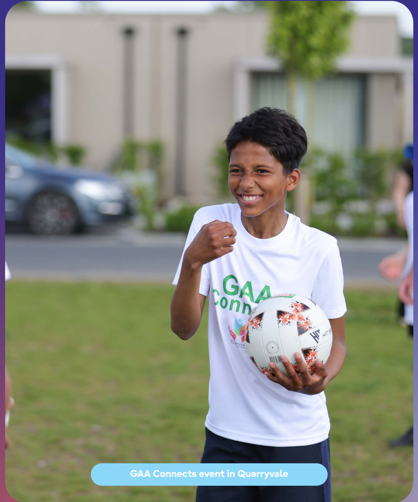
GAA Connects event in Quarryvale