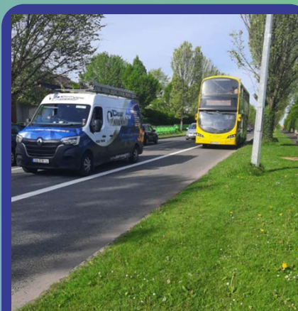
Active Travel enhancements at Killinenny Road

This project reflects our commitment to designing spaces that are inclusive, sustainable, and community-focused.