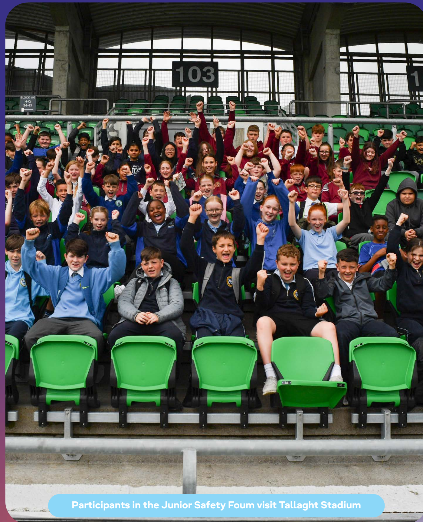
Participants in the Junior Safety Foun visit Tallaght Stadium