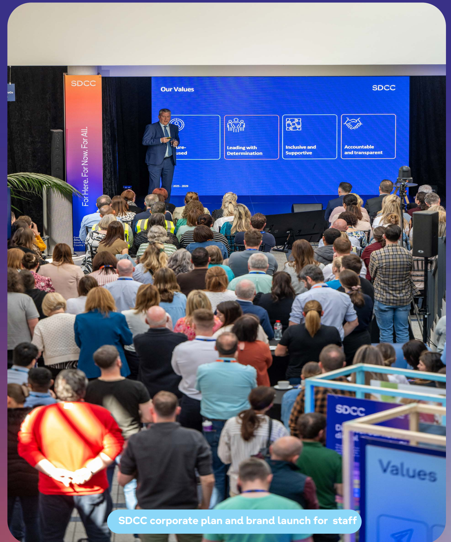
SDCC corporate plan and brand launch for staff