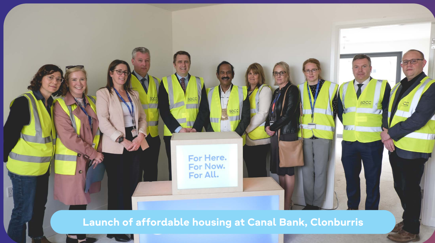
Launch of affordable housing at Canal Bank, Clonburris