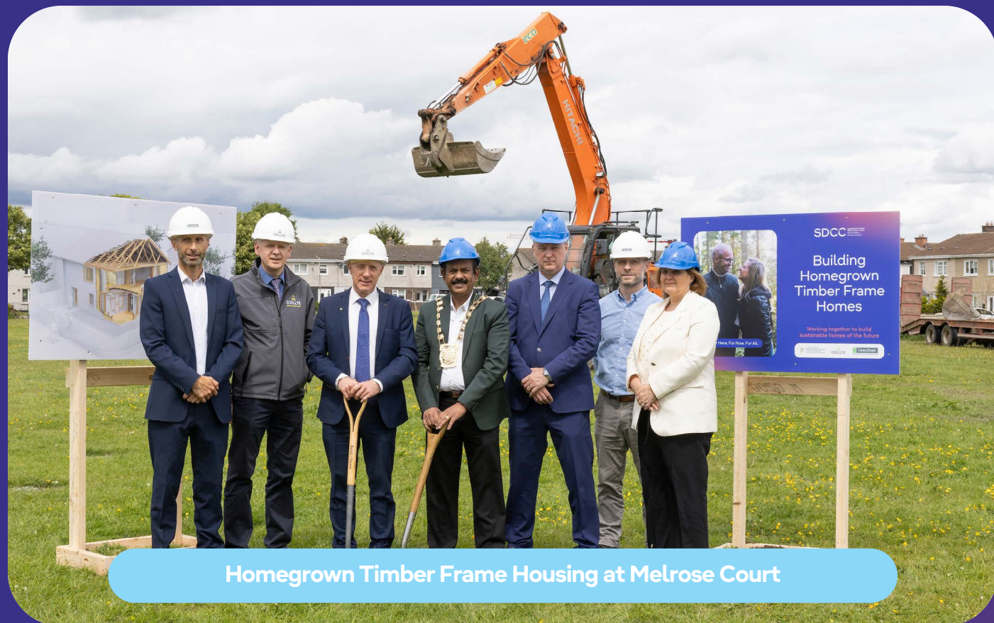
Homegrown Timber Frame Housing at Melrose Court