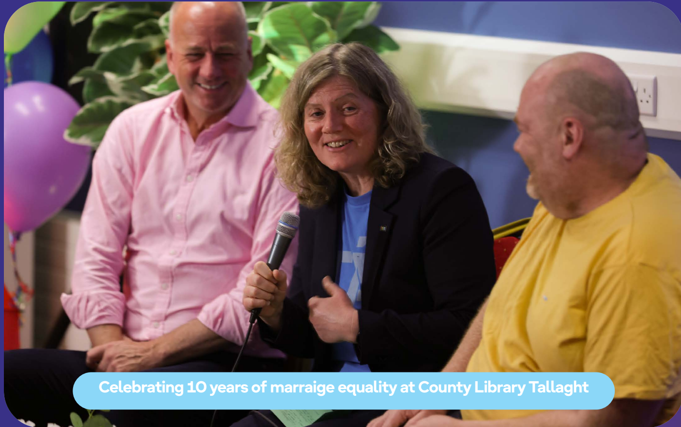
Celebrating 10 years of marriage equality at County Library Tallaght