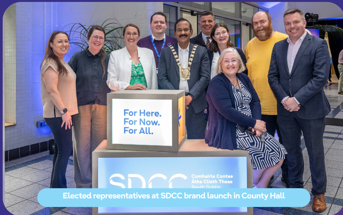
Elected representatives at SDCC brand launch in County Hall