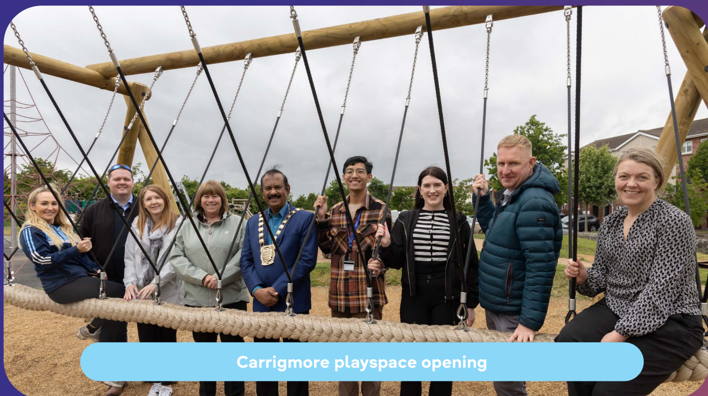
Carrigmore playspace opening