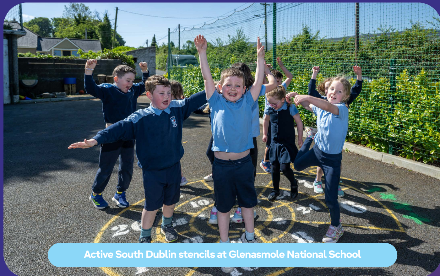
Active South Dublin stencils at Glenasmole National School