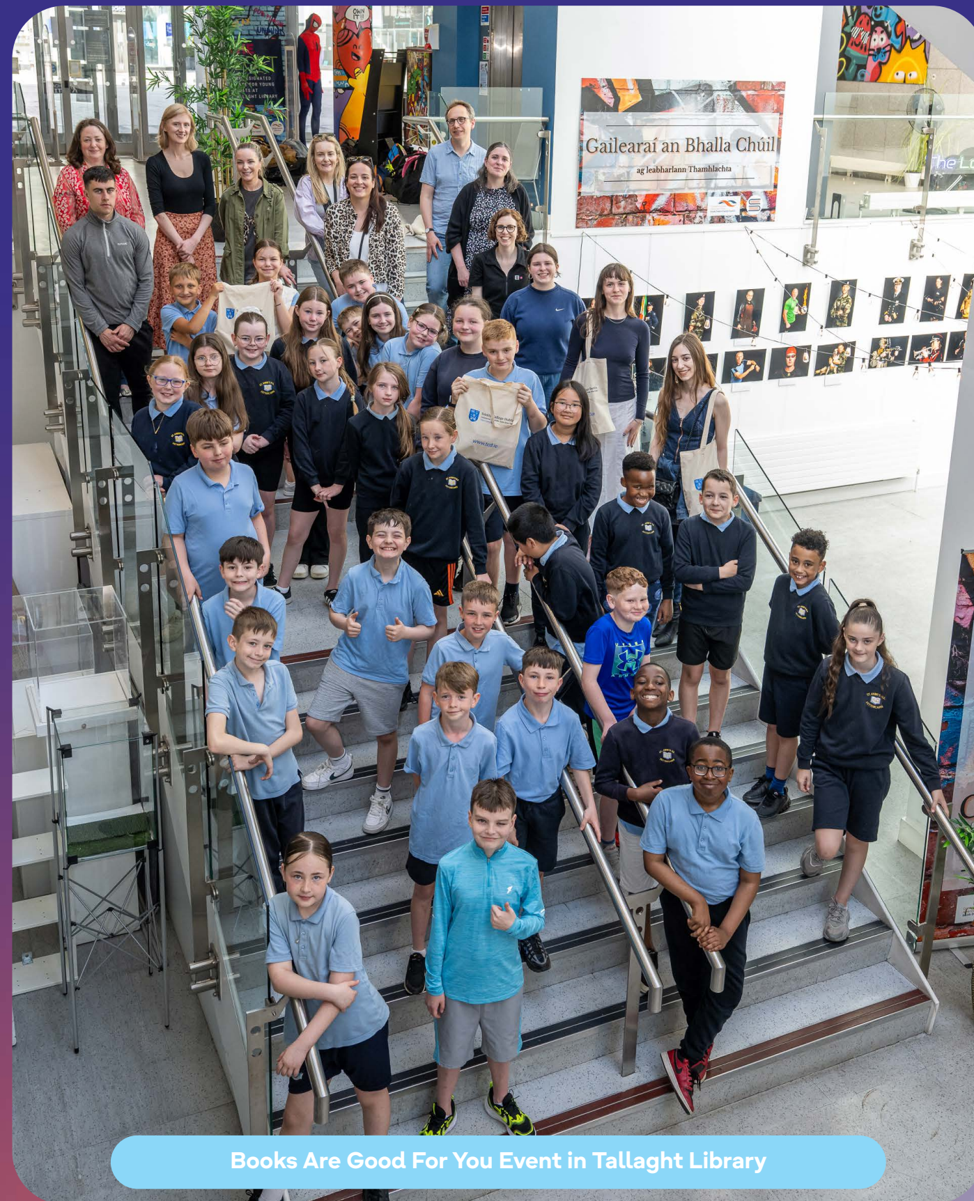
Books Are Good For You Event in Tallaght Library