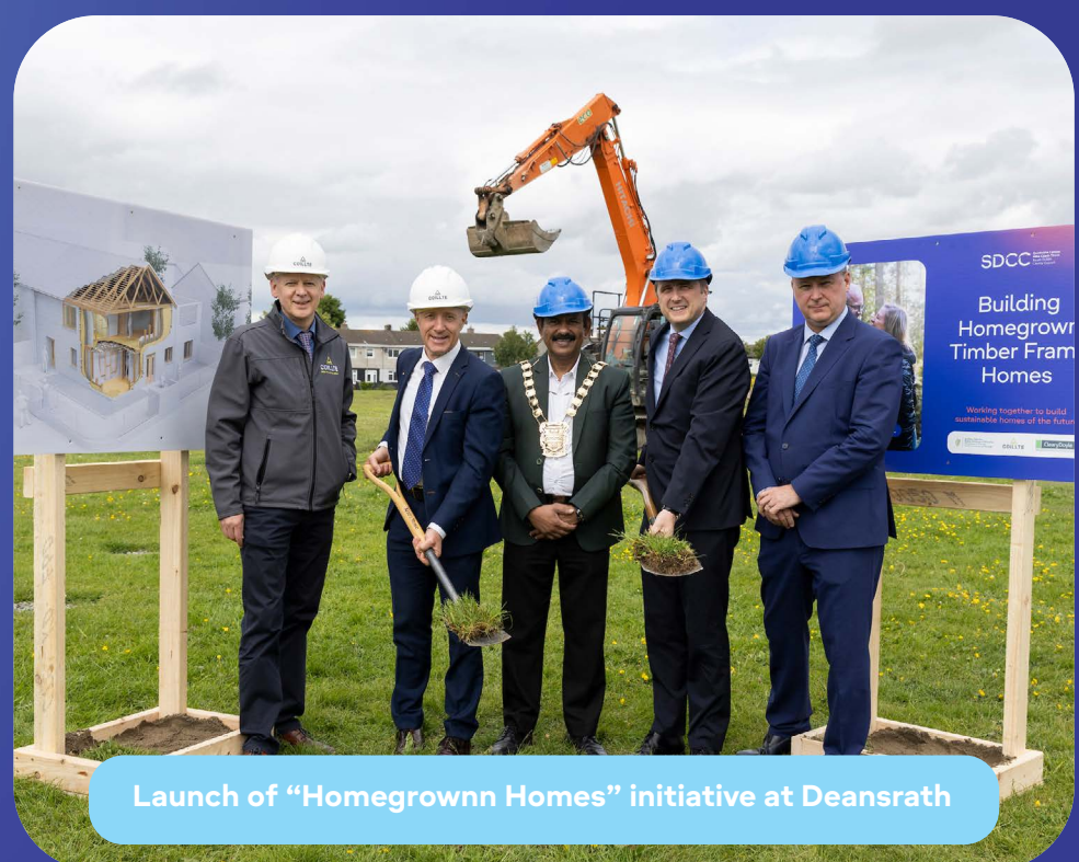
Launch of "Homegrownn Homes" initiative at Deansrath

Funded by the HSE and the Department of Housing, local Government & Heritage under Sláintecare, it offers practical support including guidance on grants, energy upgrades, and entitlements. People can self-refer or be referred for a home visit followed by assessment across six key areas. For more information please see www.agefriendlyireland.ie