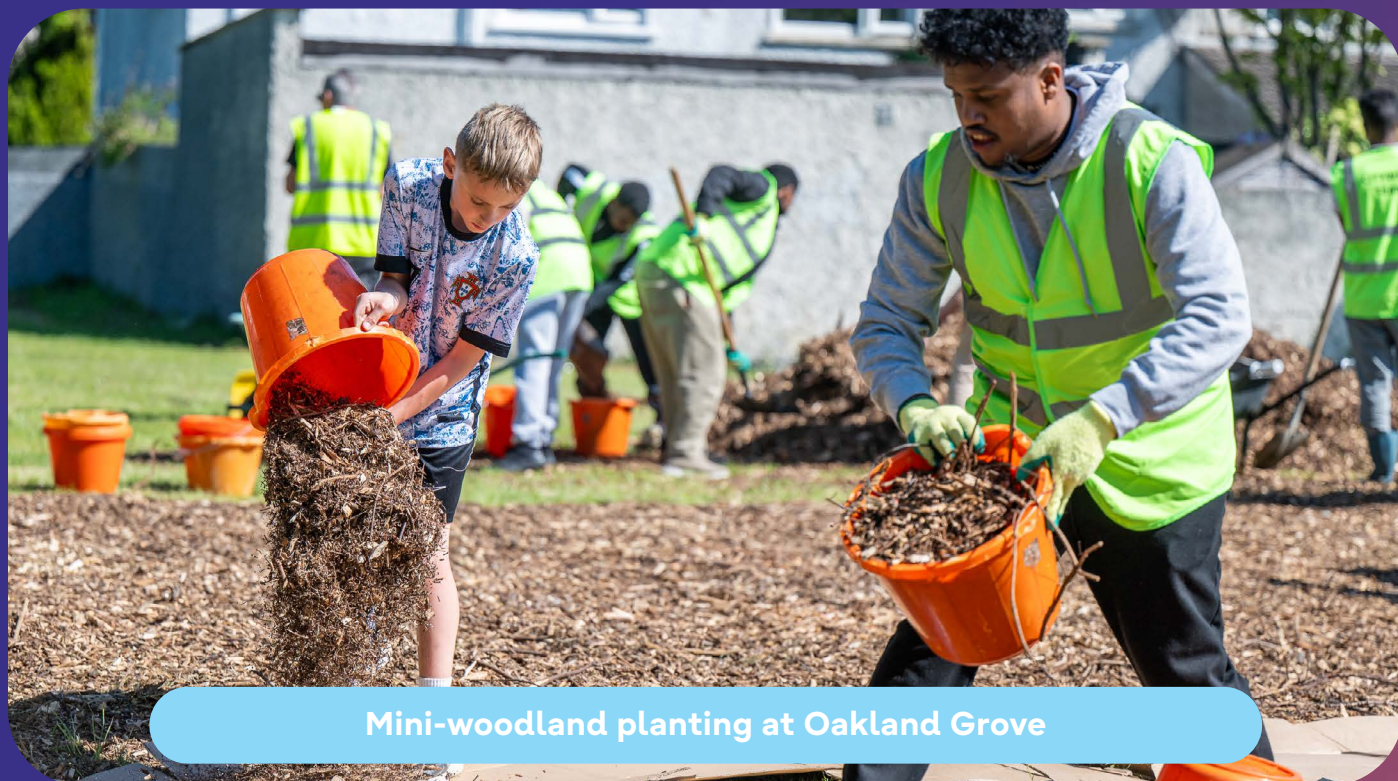
Mini-woodland planting at Oakland Grove