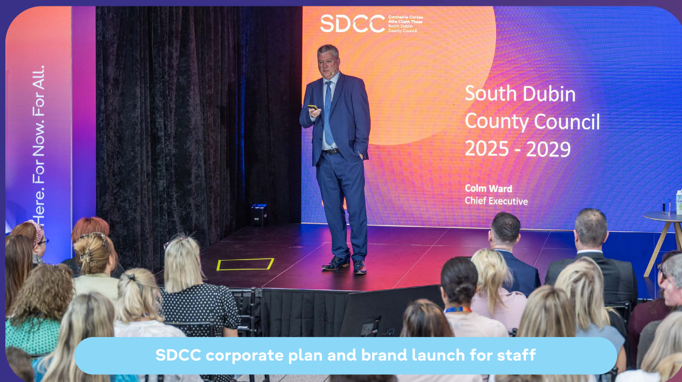
SDCC corporate plan and brand launch for staff