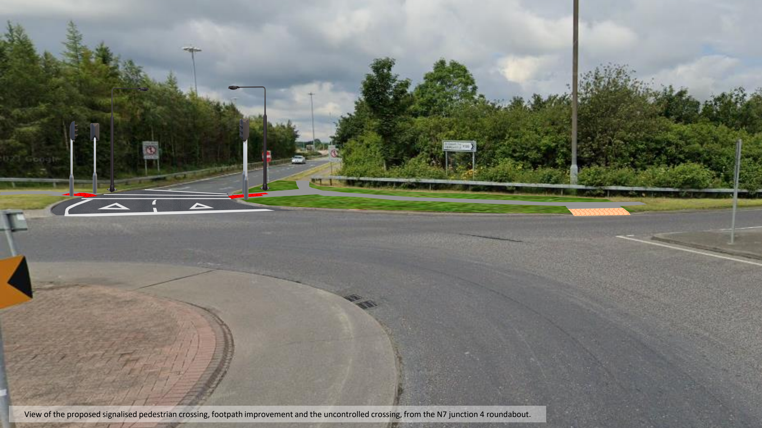
View of the proposed signalised pedestrian crossing, footpath improvement and the uncontrolled crossing, from the N7 junction 4 roundabout.