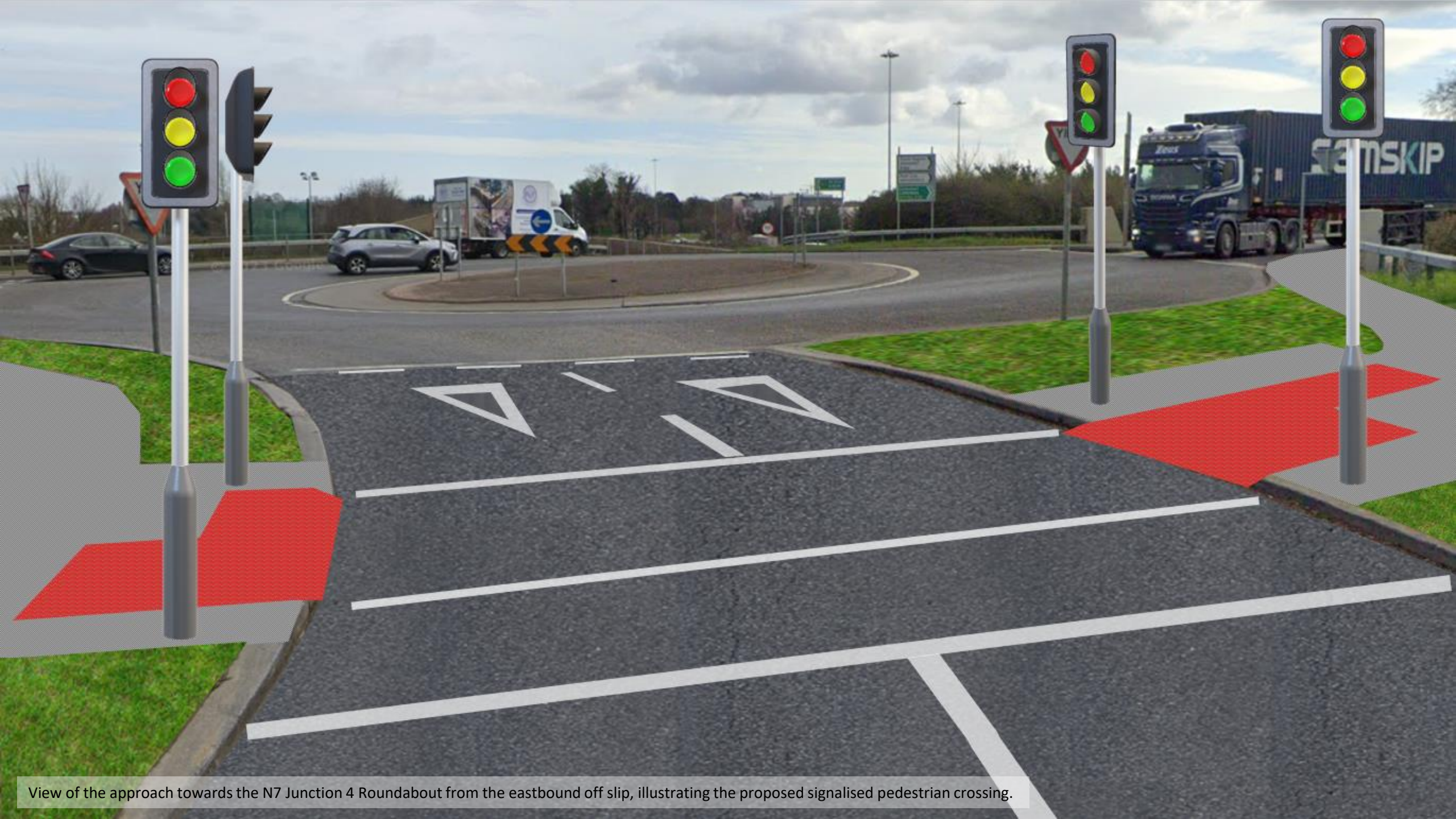
View of the approach towards the N7 Junction 4 Roundabout from the eastbound off slip, illustrating the proposed signalised pedestrian crossing.