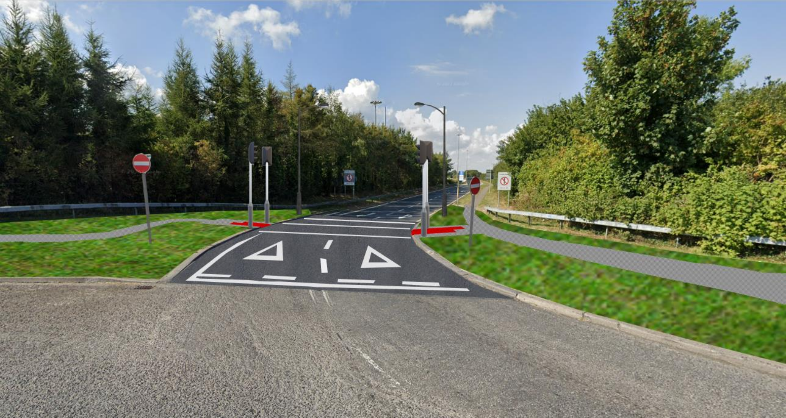
View of the proposed signalised pedestrian crossing from the N7 junction 4 roundabout(facing west).