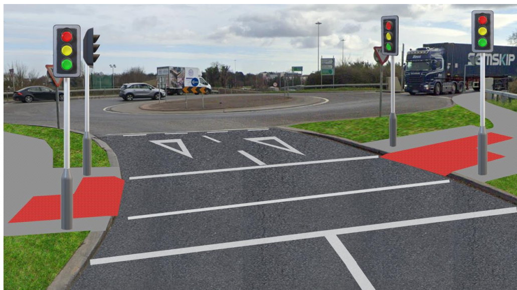
View of the approach towards the N7 Junction 4 Roundabout from the eastbound off slip, illustrating the proposed signalled pedestrian crossing.