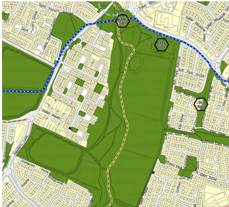
Figure 3. Extract from SDCC County Development Plan 2022-2028 Zoning map