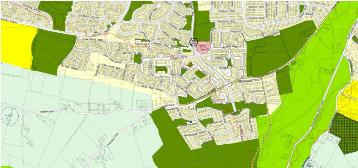
Figure 3. Extract from SDCC County Development Plan 2022-2028 Zoning map