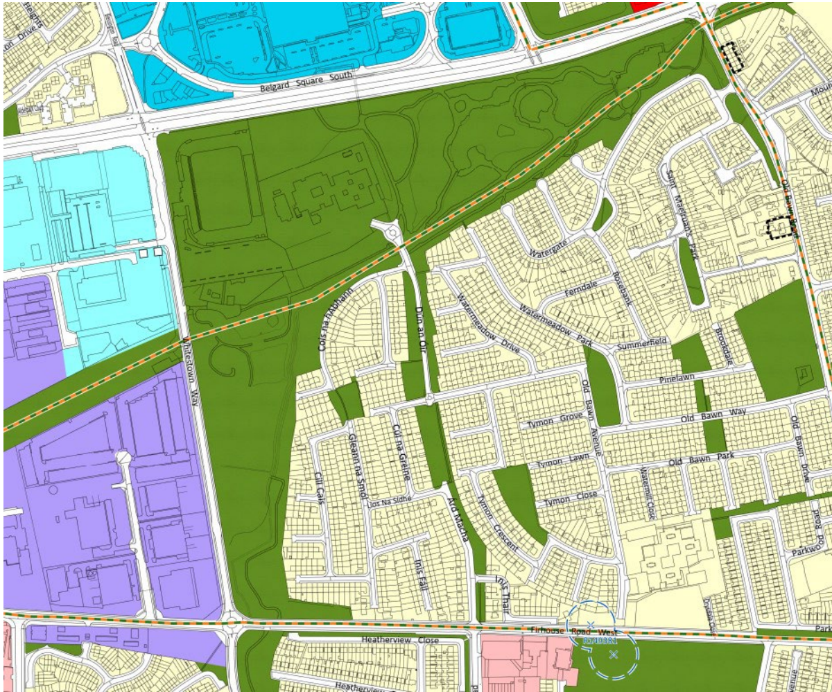
Figure 3. Extract from SDCC County Development Plan 2022-2028 Zoning map