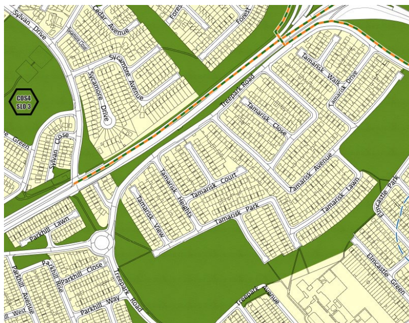
Figure 3. Extract from SDCC County Development Plan 2022-2028 Zoning map

The lands are zoned - South Dublin County Council Development Plan Zoning Objective 'OS': 'To preserve and provide for open space and recreational amenities'