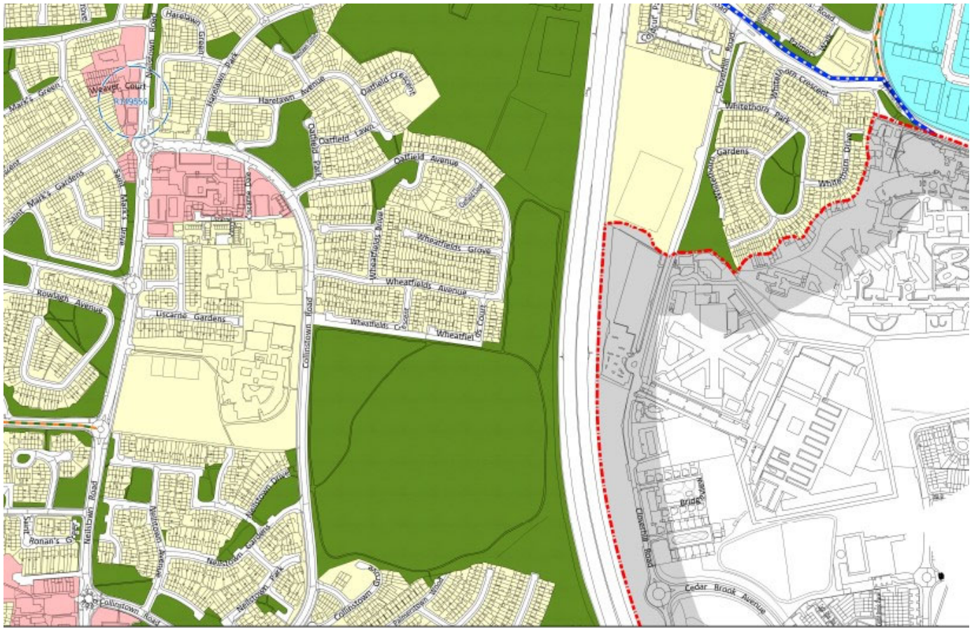
Figure 3. Extract from SDCC County Development Plan 2022-2028 Zoning map