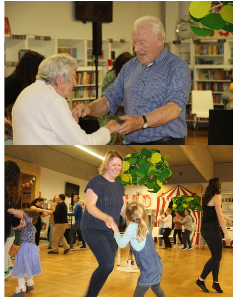
Céilí Mór i Leabharlann Baile uí Ruáin, SnaG 2022