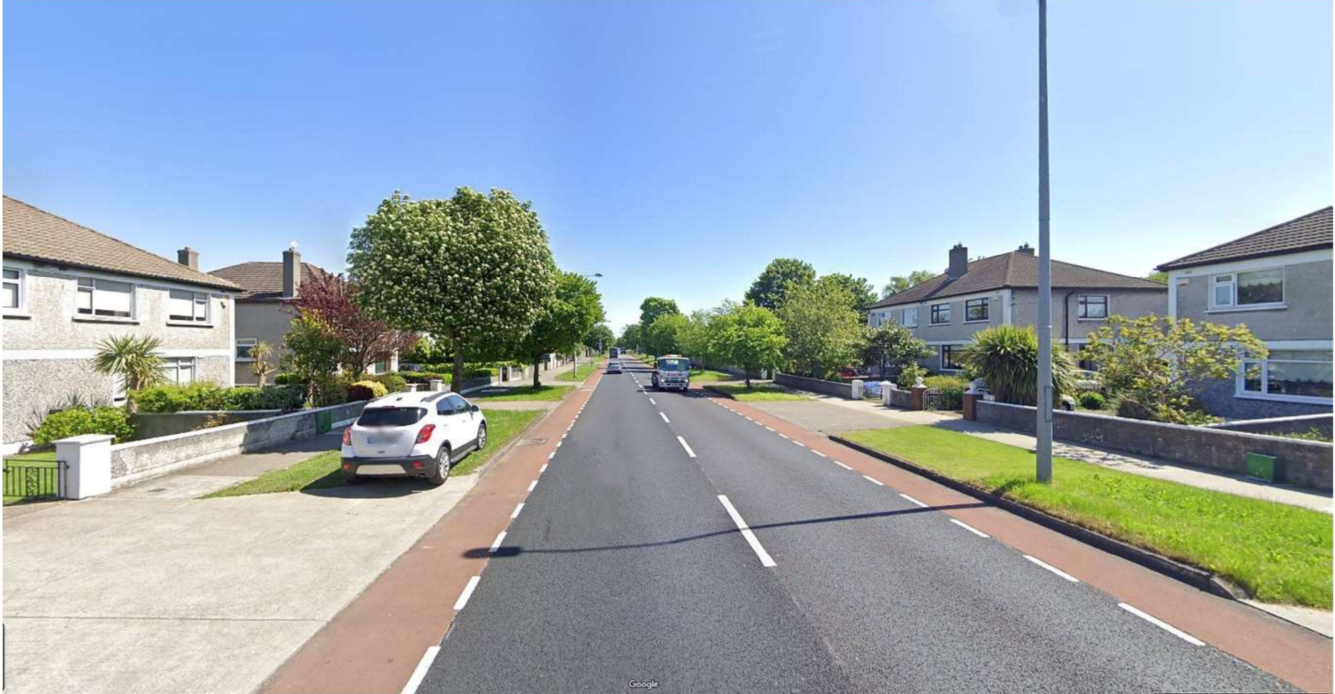
Google Street View Existing (Templeville Road)