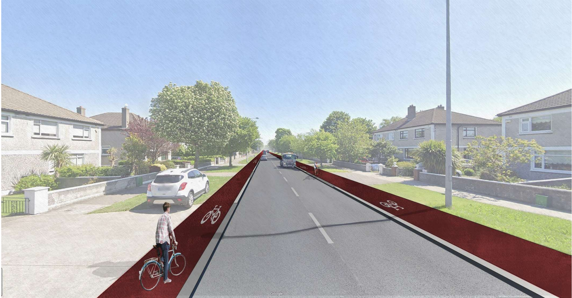
Proposed view (Templeville Road)