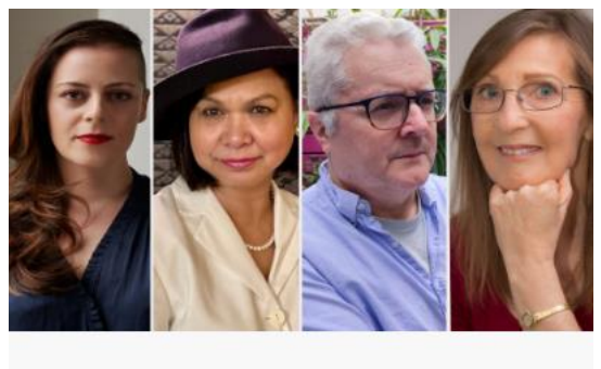
Poetry Night & Poetry Awards