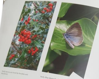
Holly berries are loved by thrushes and blackbirds.