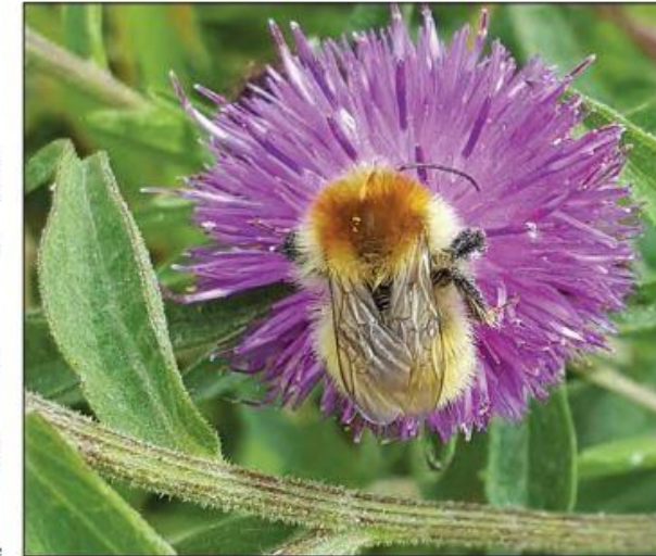
NEAR-THREATENED: The beautiful Moss Carder Bee depends on flower-rich meadows for its survival.

flowering stems of this plant have been gradually increasing in the meadows.