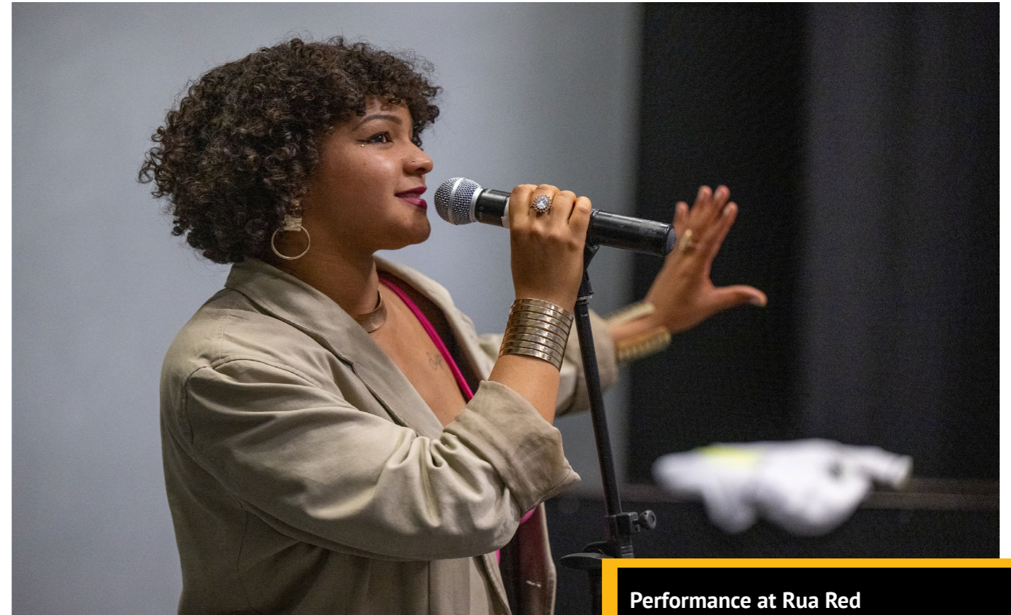
Performance at Rua Red