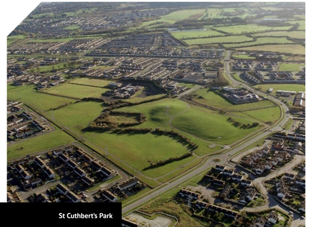
St Cuthbert's Park

South Dublin County Council has appointed a consultancy team led by Nicholas de Jong Associates - Landscape Architects, to develop a masterplan for the upgrade of St Cuthbert's Park, Clondalkin. Initial discussions are taking place with the task force for St Cuthbert's Park, and we are seeking to organise several consultation events to ensure widespread community engagement. Plans for the upgrade will be on display by the end of the summer. Members of the public and all interested parties are encouraged to contribute comments, ideas, or opinions by contacting StCuthberts@sdblincoco.ie .