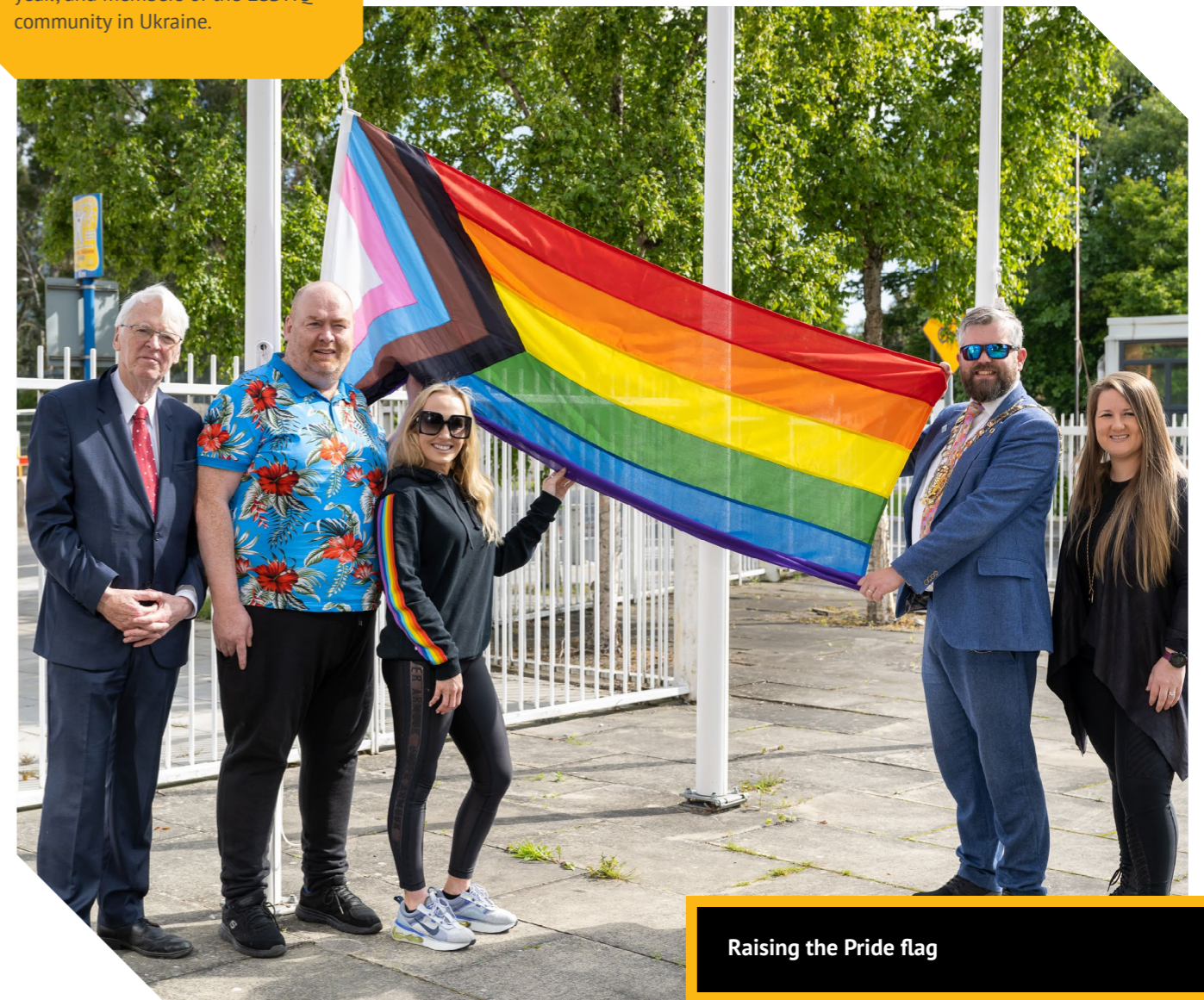
Raising the Pride flag