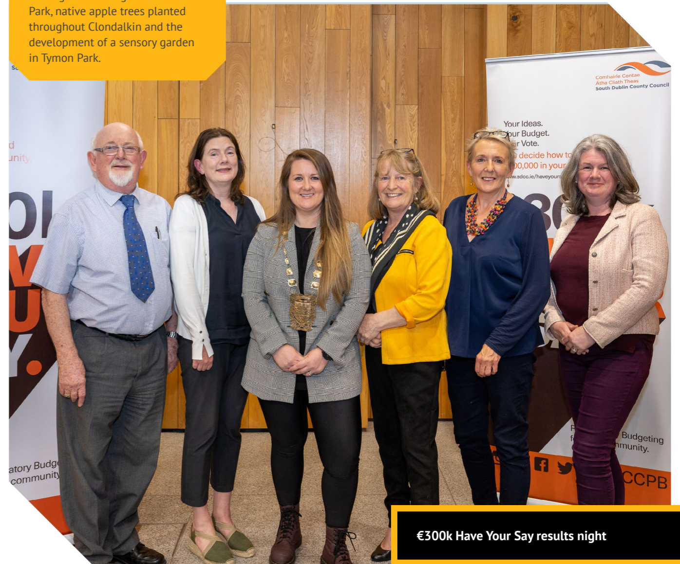
€300k Have Your Say results night

A full breakdown on the votes is given on www.sdcc.ie .