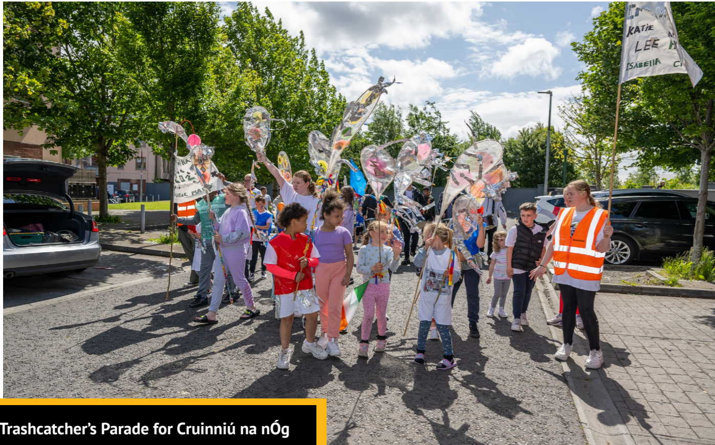
Trashcatcher's Parade for Cruinniú na nÓg