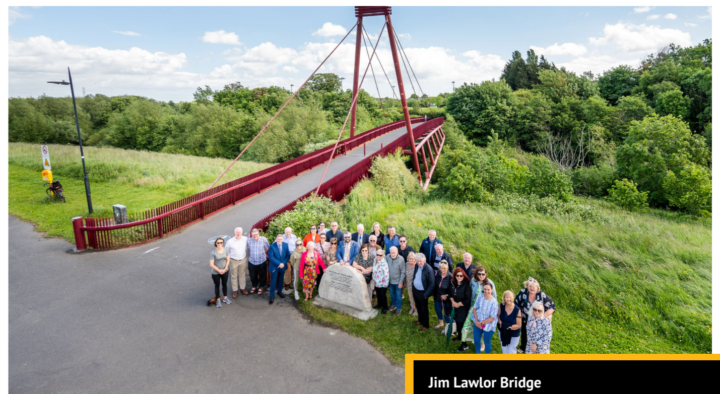
Jim Lawlor Bridge