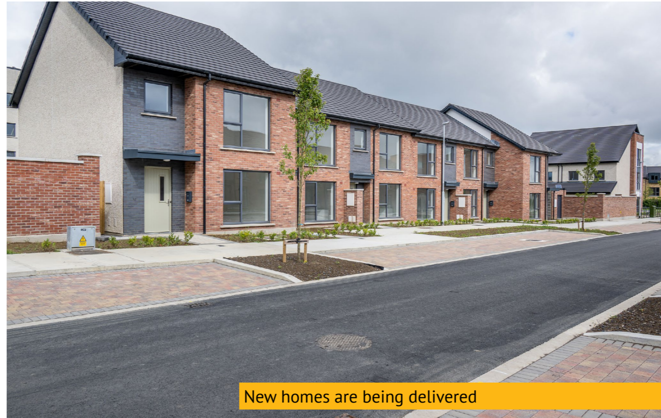
New homes are being delivered

This month will see the occupancy of the first homes at Kilcarbery Grange, Dublin 22.