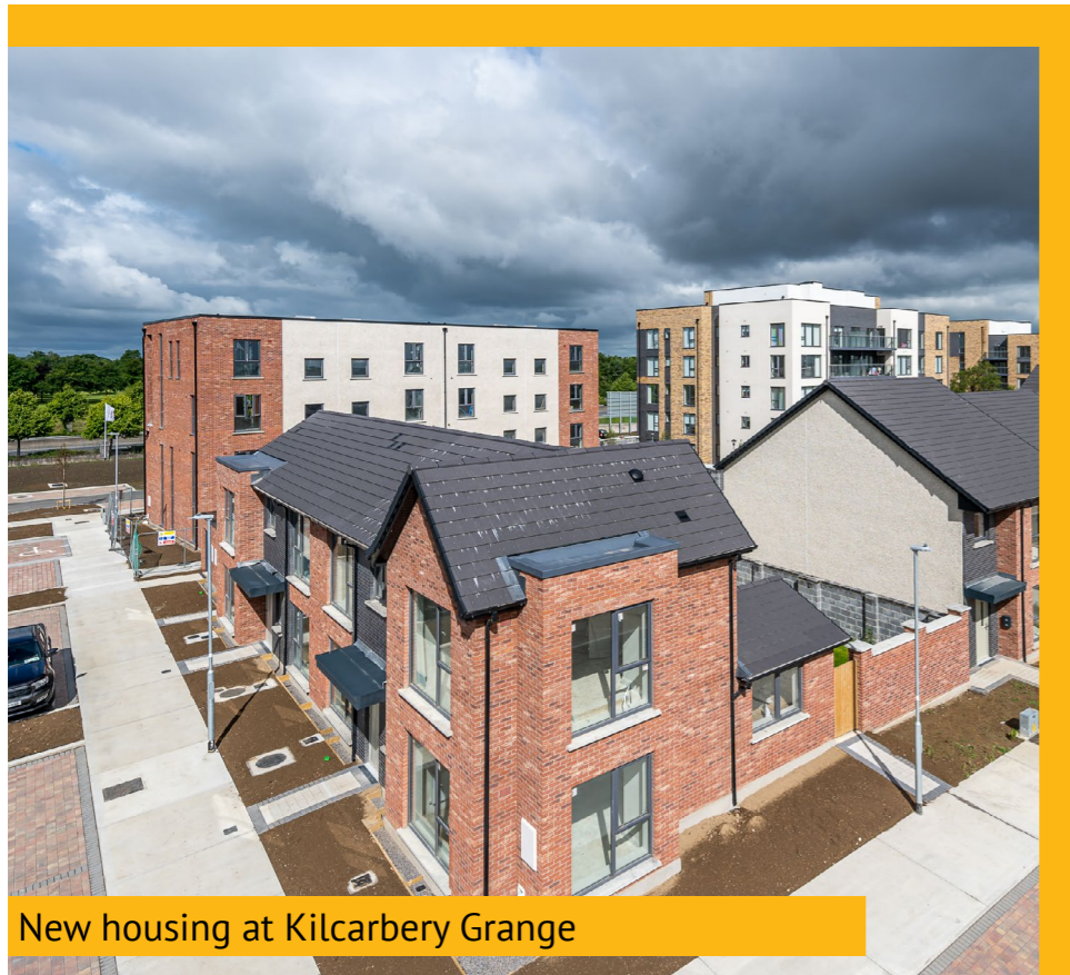
New housing at Kilcarbery Grange