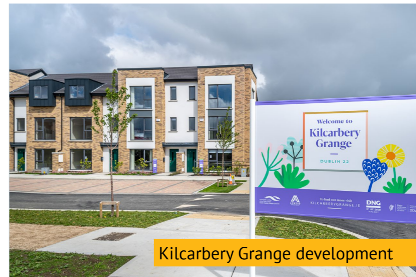
Kilcarbery Grange development

Kilcarbery also features 74 cost rental apartments, managed by Túath Housing, that are currently being occupied by the first cost rental tenants in South Dublin County. This tenure is supported through the DHLGH Cost Rental Equity Loan, a scheme providing significant discounts on market rents for one and two-bedroom apartments.