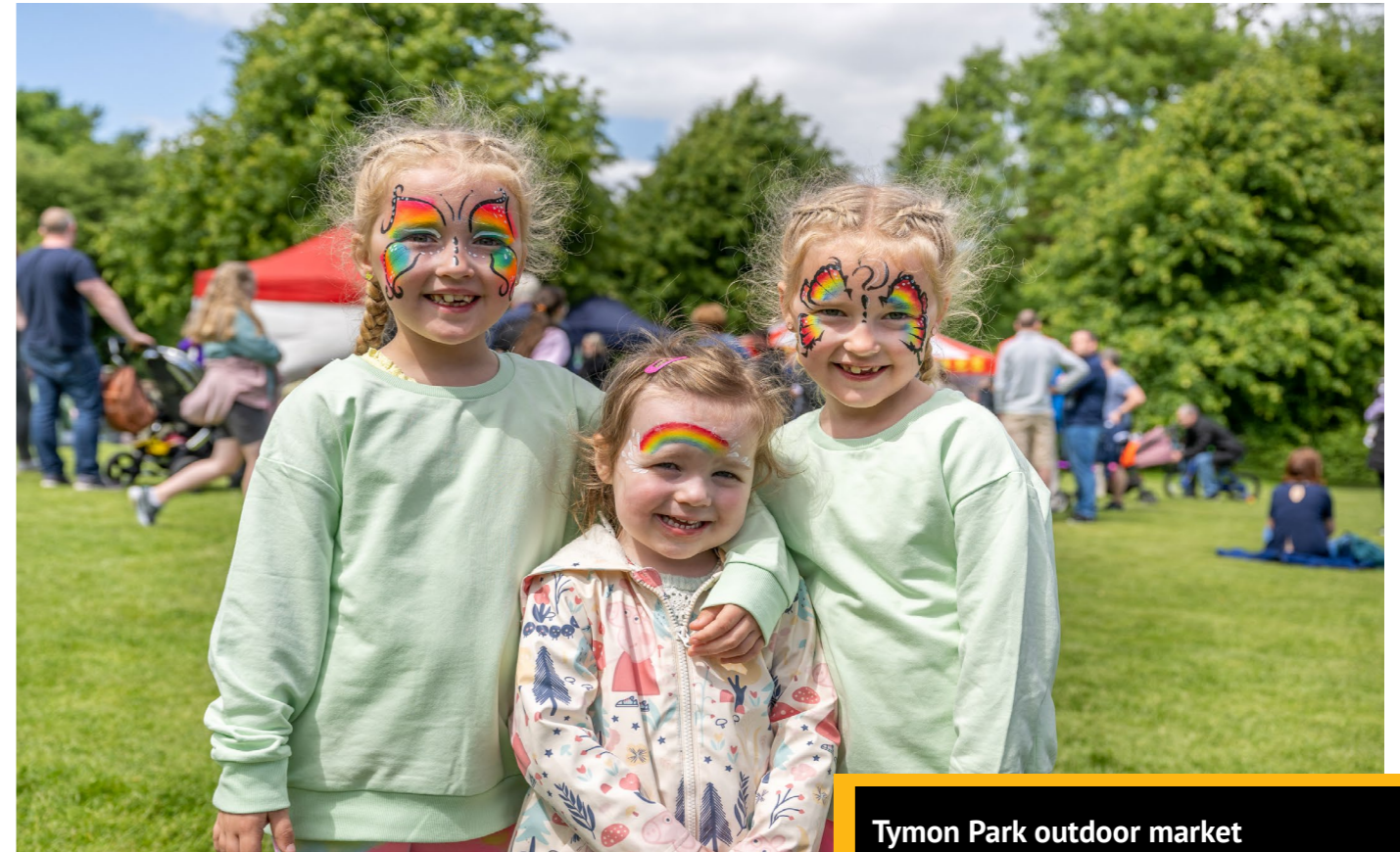
Tymon Park outdoor market