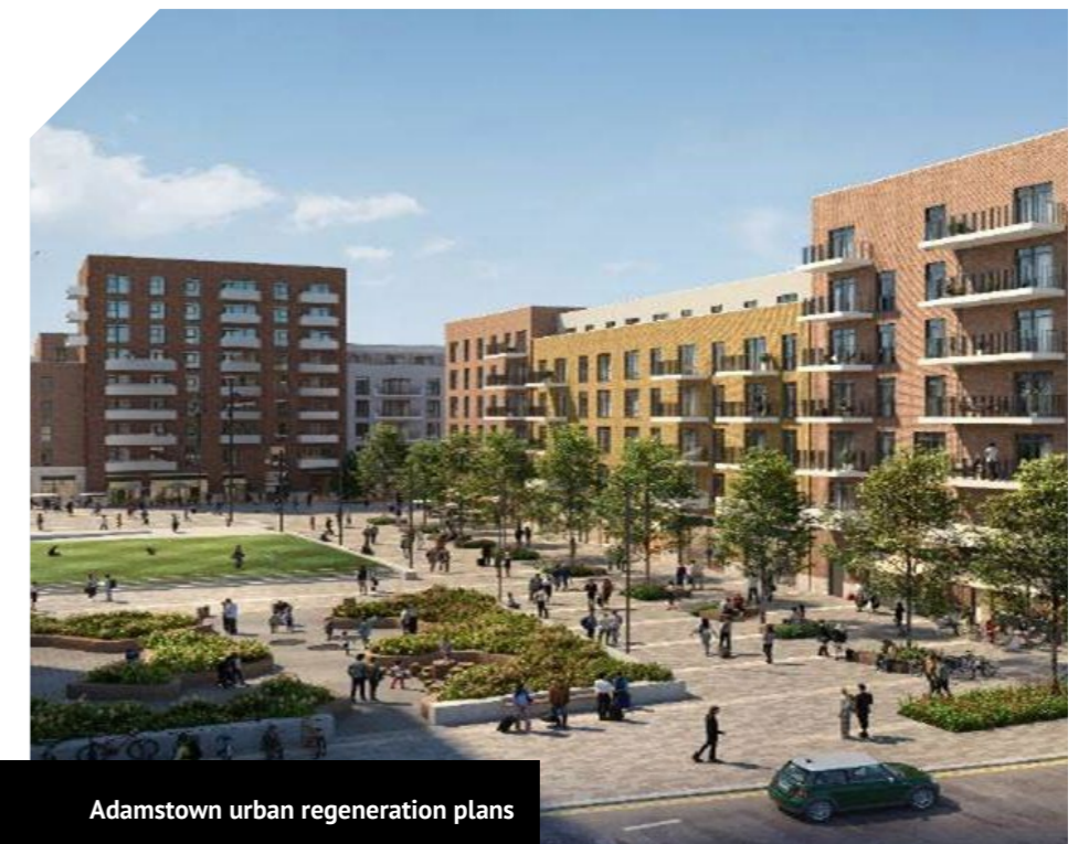
Adamstown urban regeneration plans

Through the Urban Regeneration and Development Funding (URDF), the Council has committed to the delivery of three large-scale infrastructure projects within the Adamstown Strategic Development Zone; Adamstown Plaza, Central Boulevard Park, and a civic building. The Council secured funding approval in June 2022 of €9.97 million from the Department of Housing, Local Government and Heritage and it is intended to commence delivery of the Adamstown Plaza in August/September. The planning and design of the Central Boulevard Park and civic building projects will commence later this