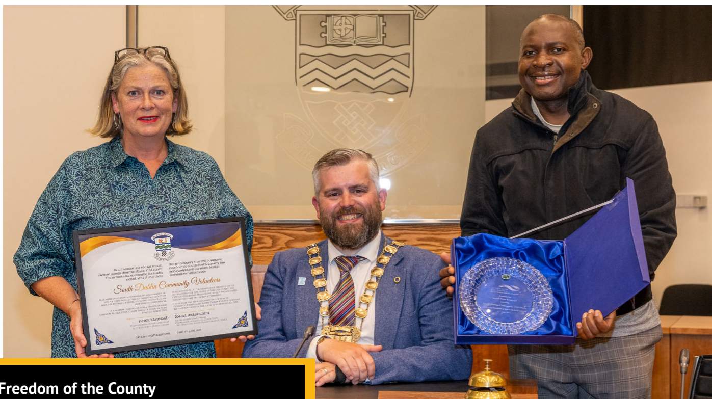
Freedom of the County