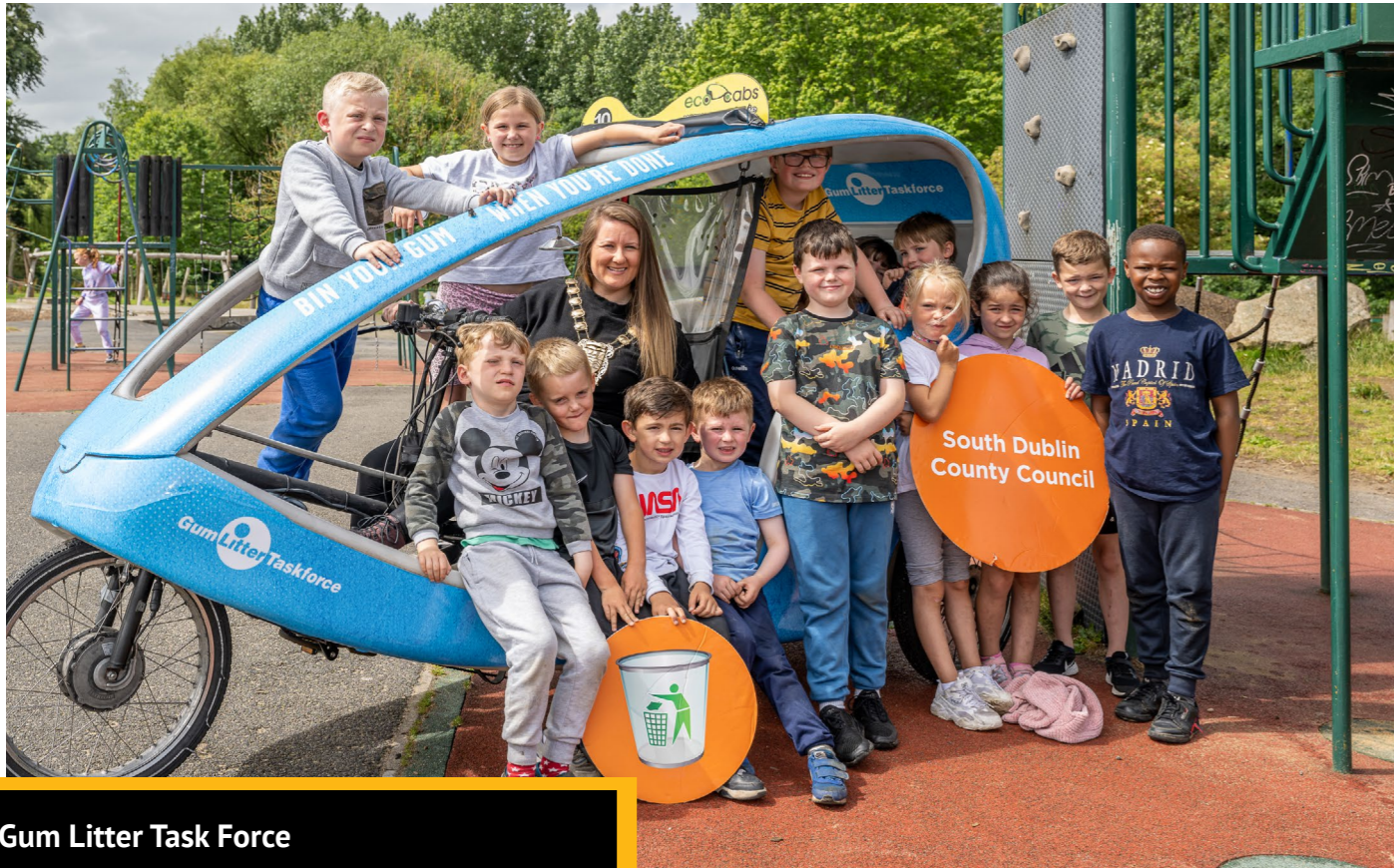
Gum Litter Task Force