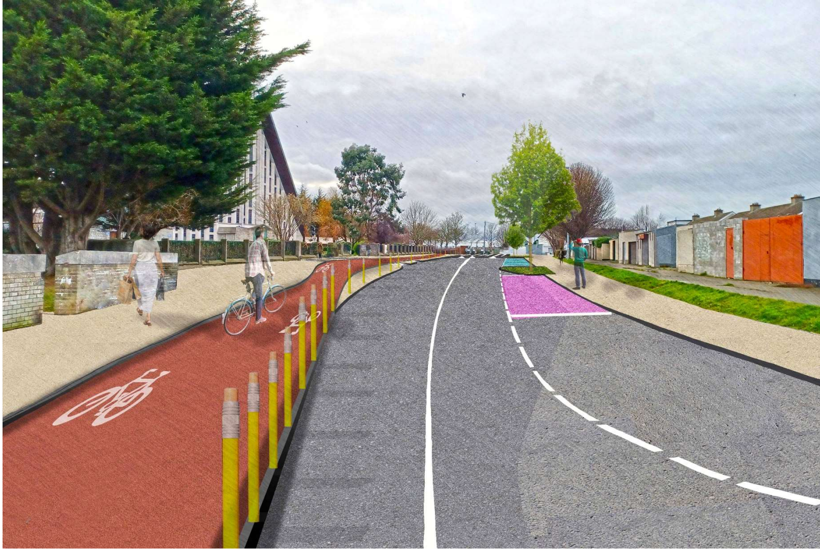
Proposed view on Limekiln Lane outside Holly Spirit Senior School