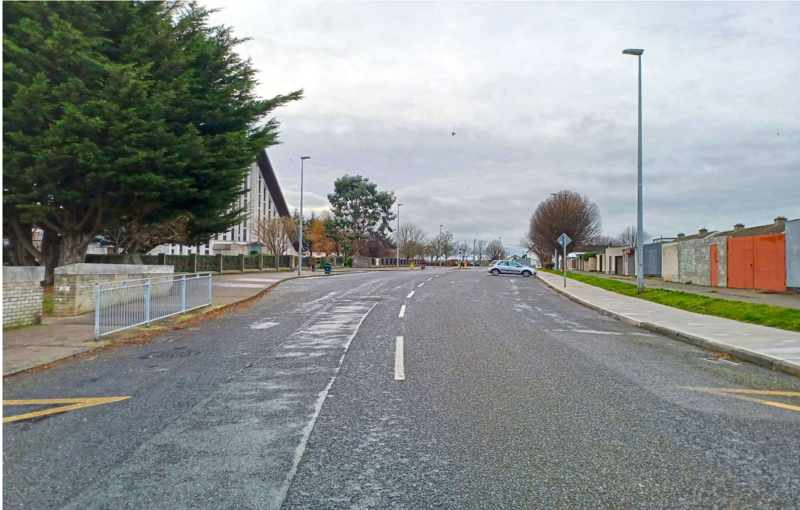
Existing View on Limekiln Lane outside Holly Spirit Senior School