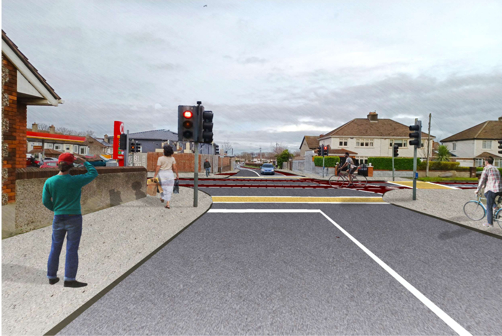
Proposed view at Limekiln Lane/Greentrees Road Junction