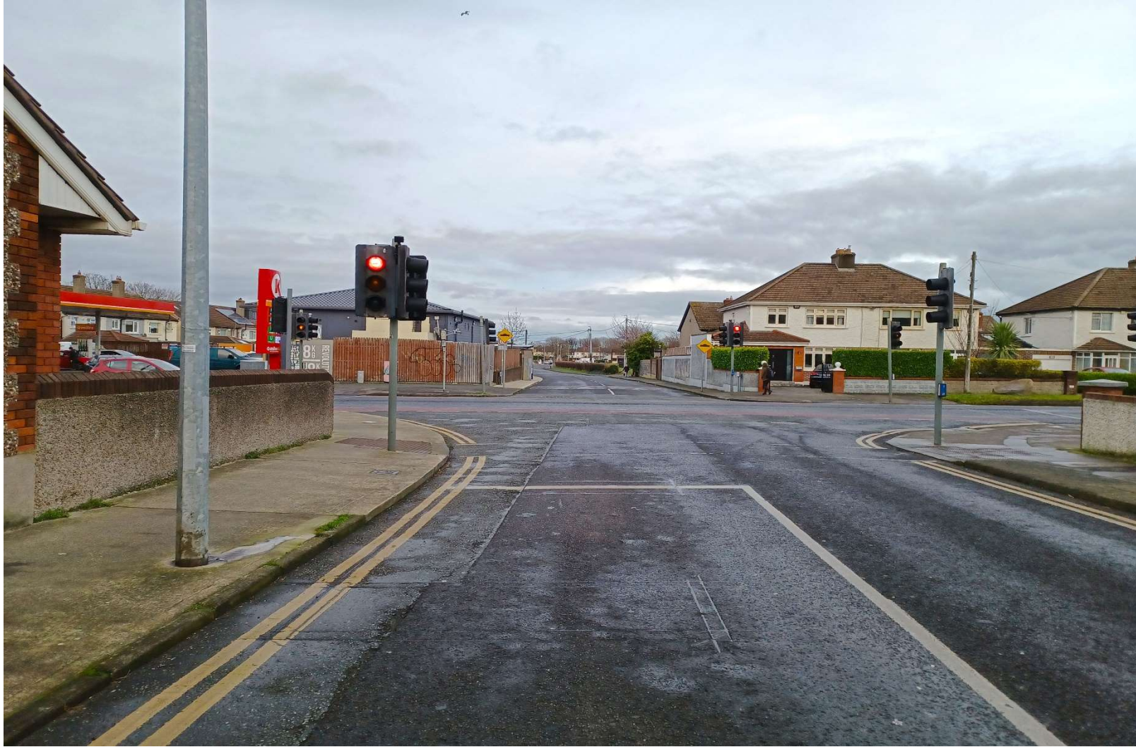
Existing view at Limekiln Lane/Greentrees Road Junction