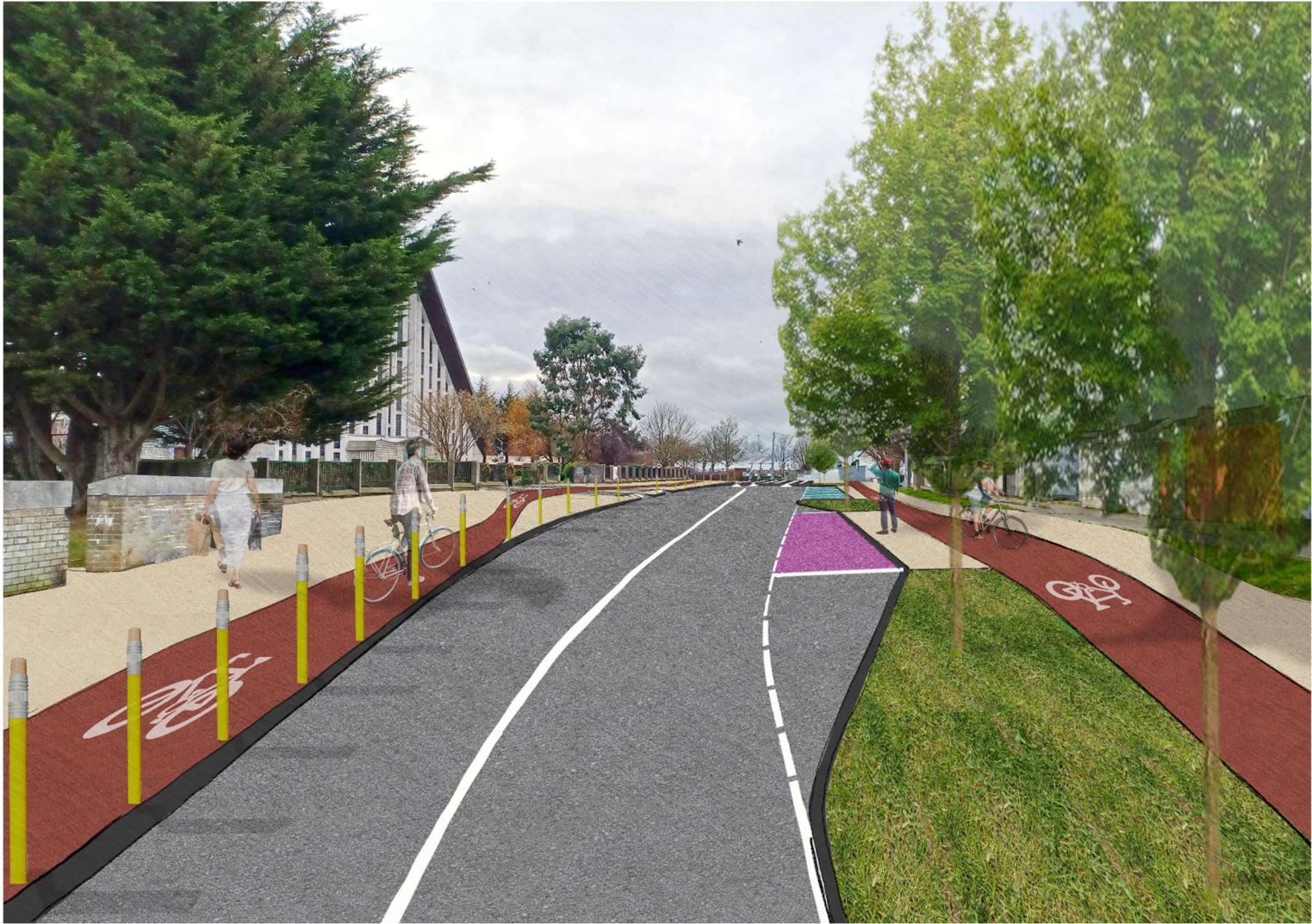
Proposed view on Limekiln Lane outside Holly Spirit Senior School