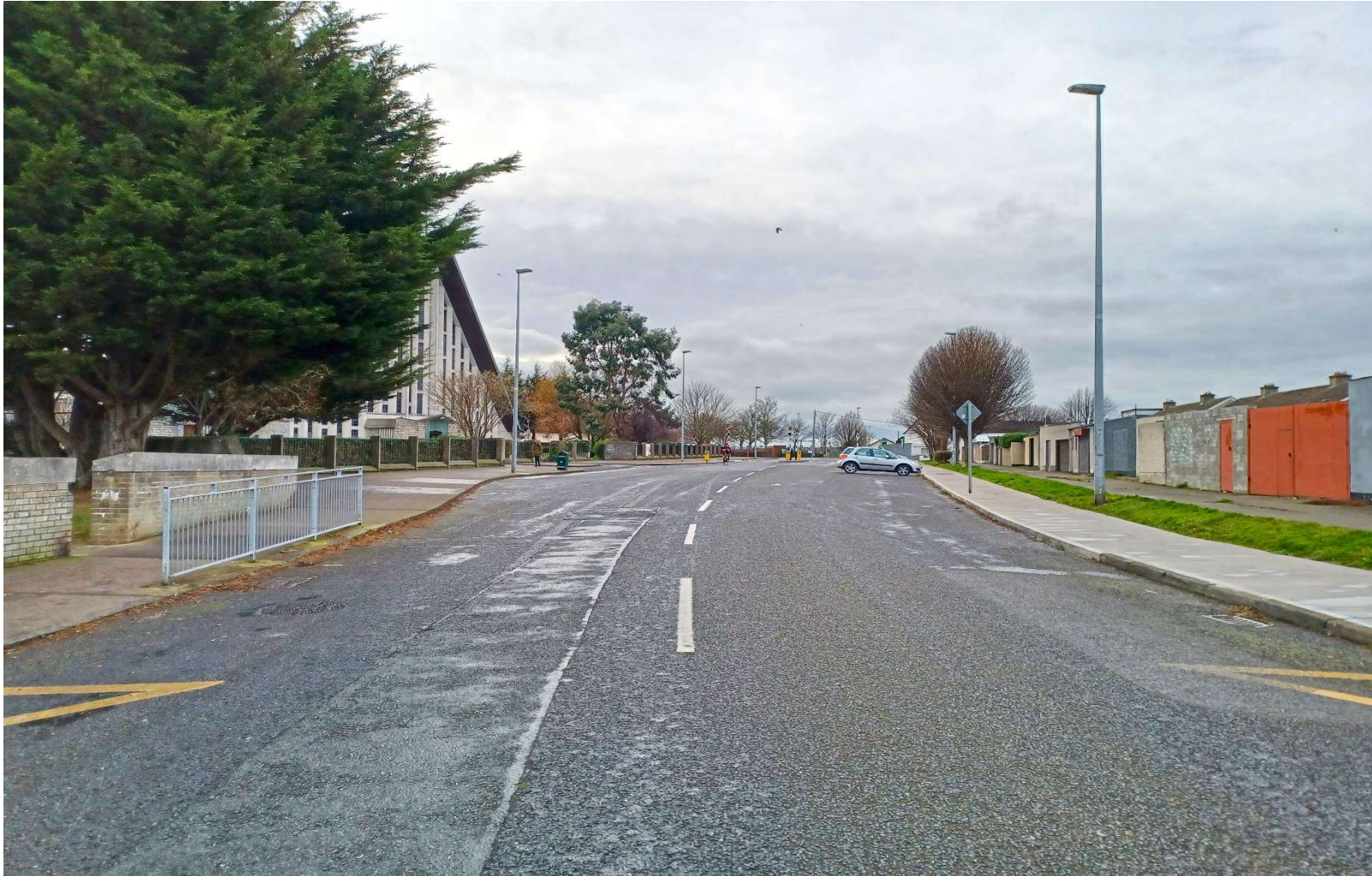
Existing View on Limekiln Lane outside Holly Spirit Senior School