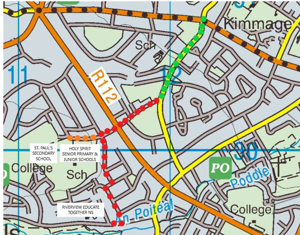
LIMEKILN and WHITEHALL ROAD WEST CYCLE ROUTE