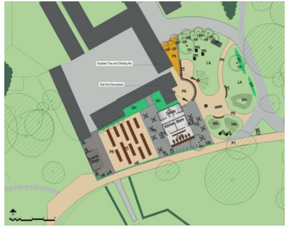
Proposed 'New Hub' Layout Plan