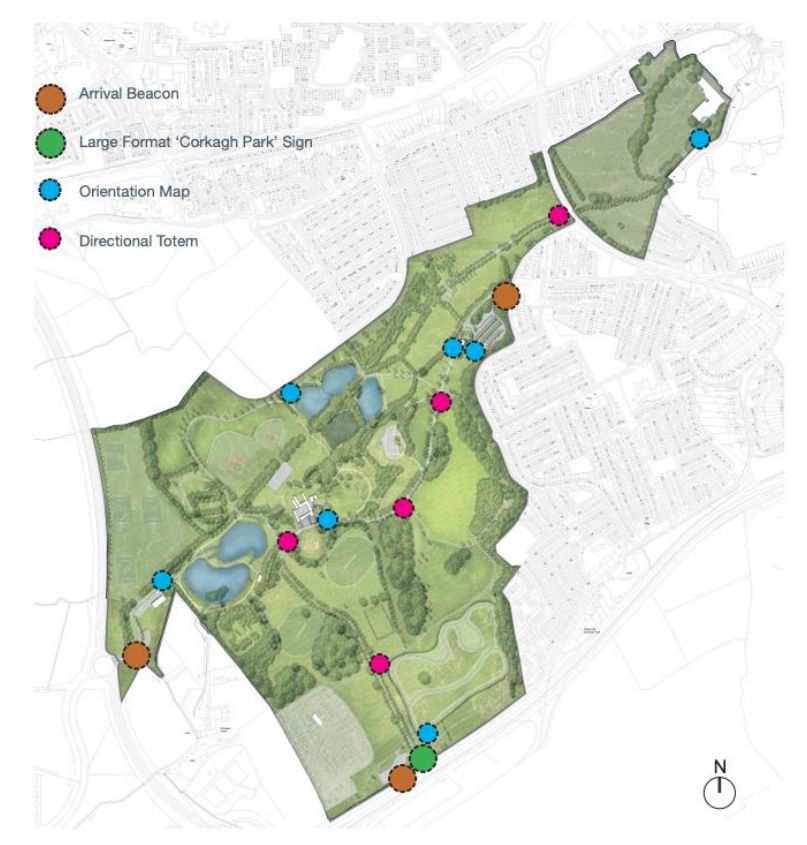
Wayfinding and Signage Strategy