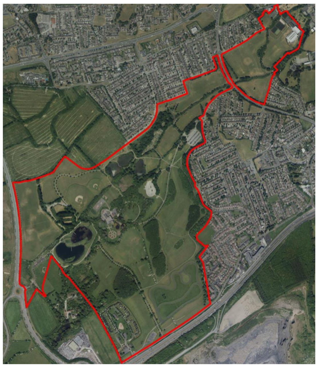
Corkagh Park - Site Outlined in Red

The site, subject of this Part 8 Application, is Corkagh Park, situated in Clondalkin, South Dublin between the N7 and the Old Nangor Road. Corkagh Park is adjoined by the Village of Clondalkin and its mature residential developments. The existing park contains a number of facilities including football pitches, playground, baseball pitches, cricket facilities and purpose built road cycle track. There are also a number of ponds and the River Camac flows through the site. The site extends over 120 ha, and is outlined in the figure below.