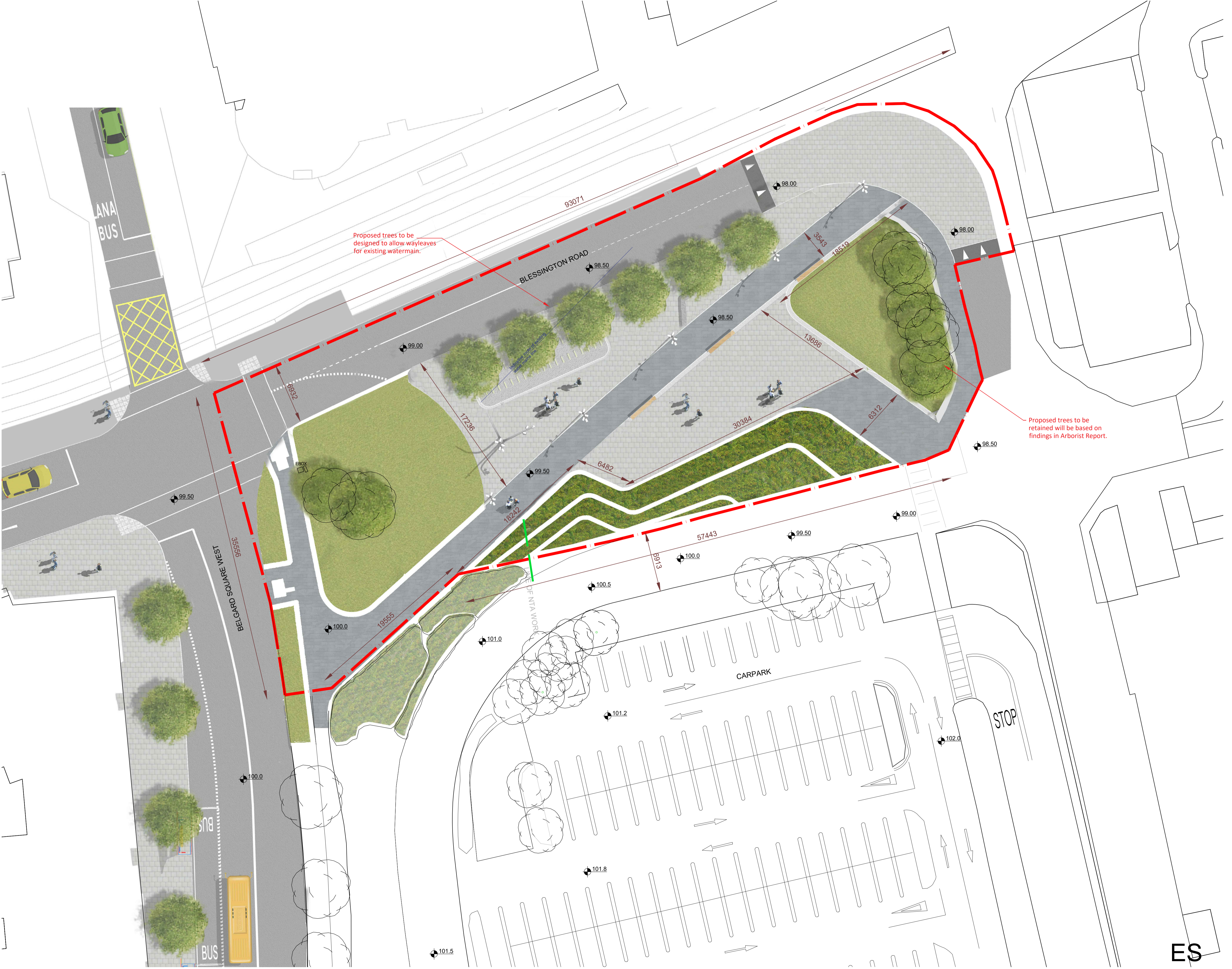
01 SITE LAYOUT PLAN - TALLAGHT LUAS STOP SCALE = 1:200 @A1, 1:400@A3