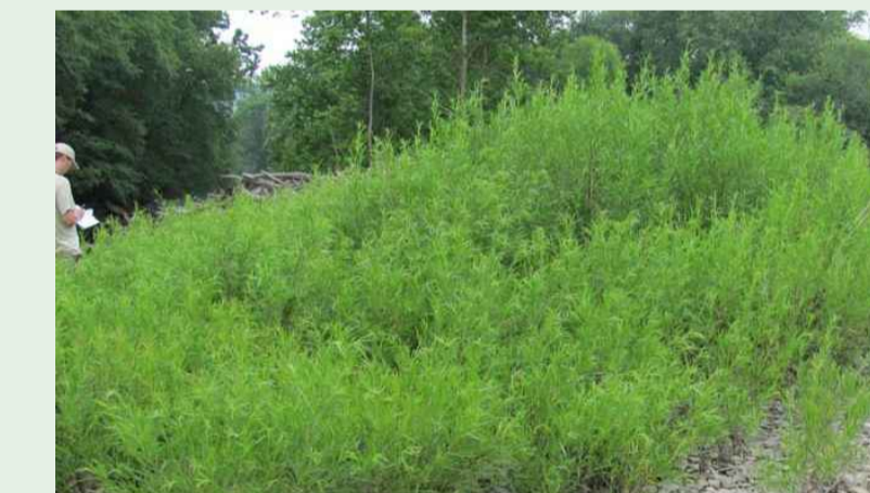
⑬ Scrub Vegetation