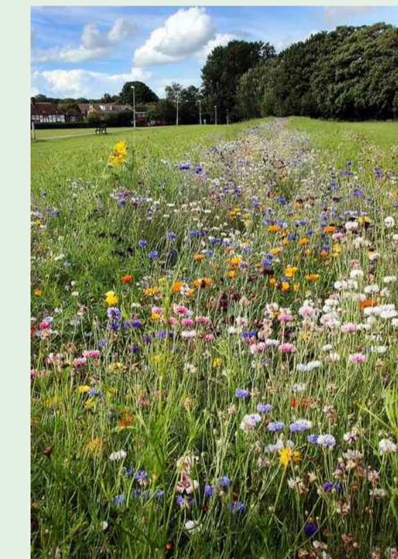
⑫ Wildflower Meadow Grassland