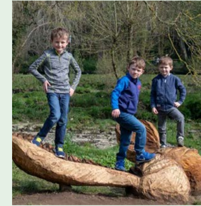
Linear Play Area