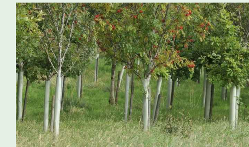
⑪ Native Woodland