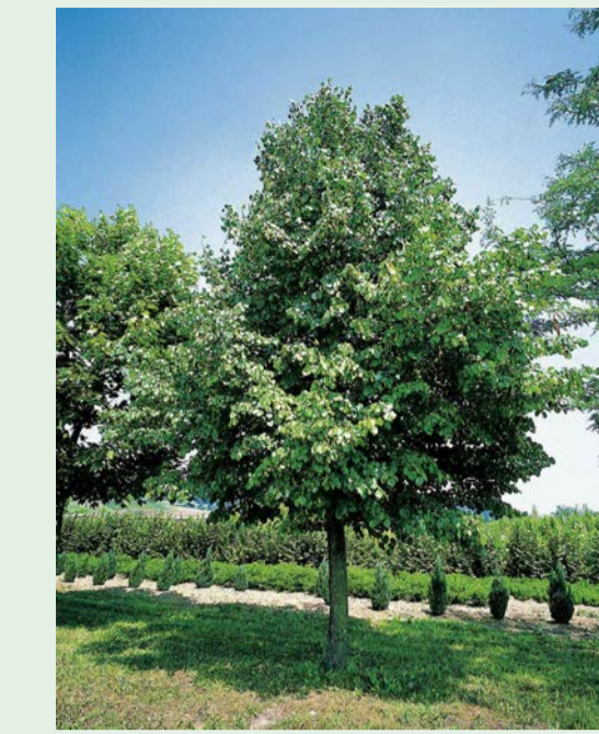
Signature Tree- Formal Avenue