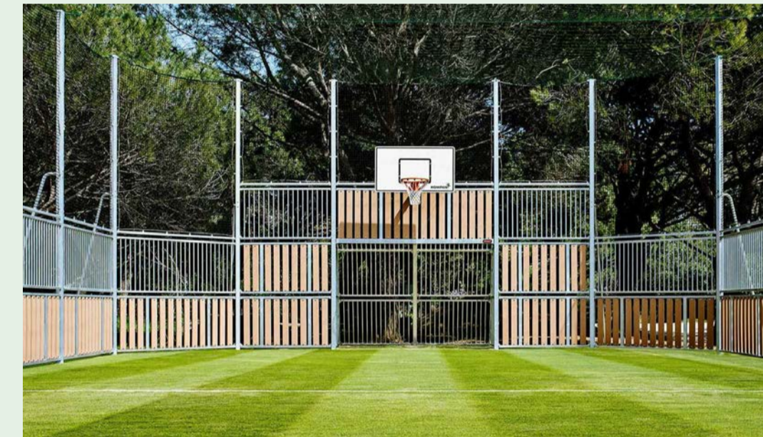
Muti Use Games Area (MUGA)