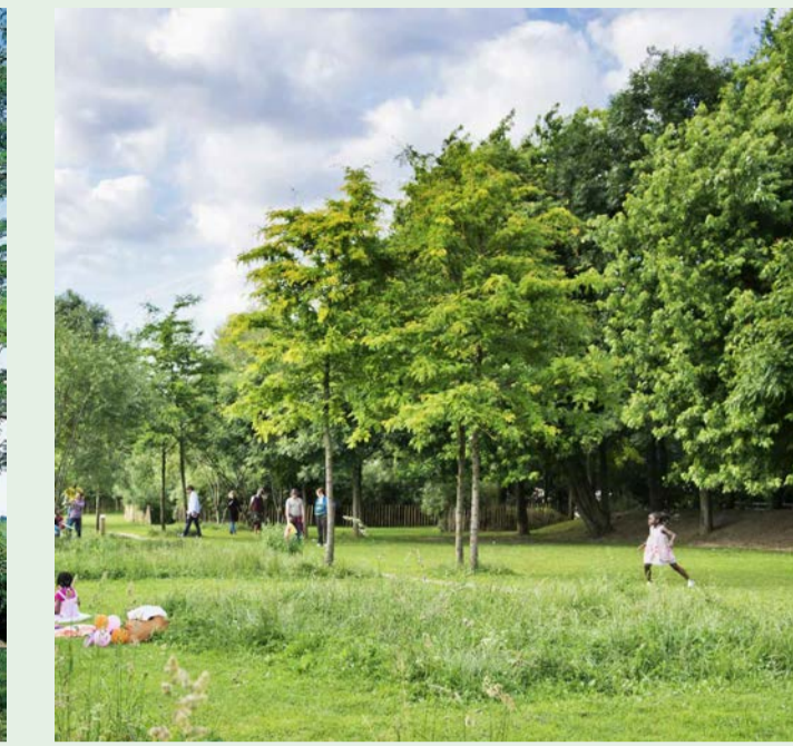
Select Standard- Trees in informal groups