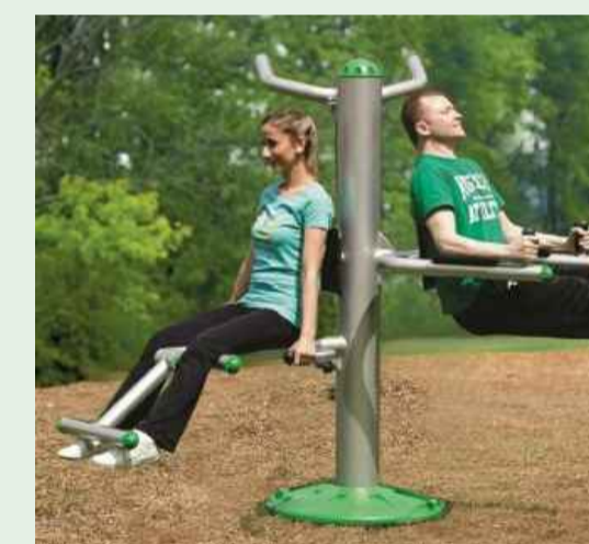
Outdoor Fitness Station