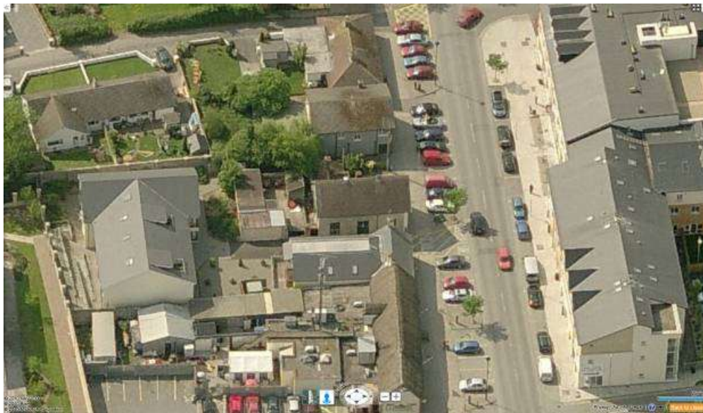
An aerial view of the courthouse