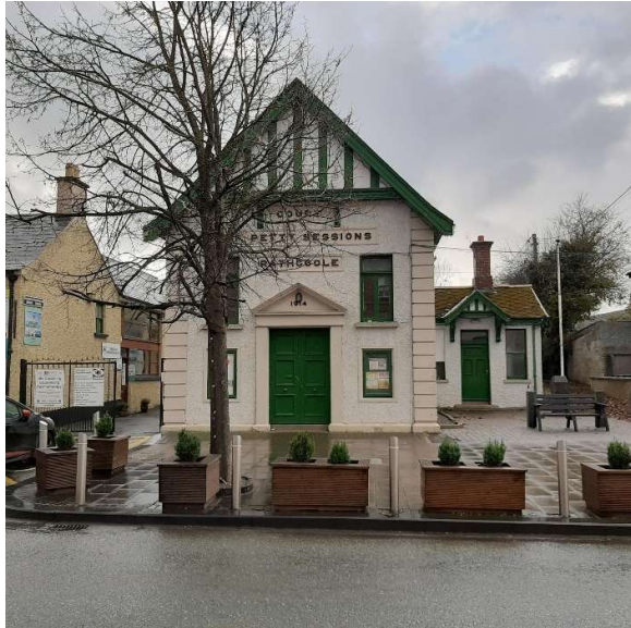
The former courthouse, as existing

Recommendation Stage for Council issued following the conclusion of the Consultation Process.