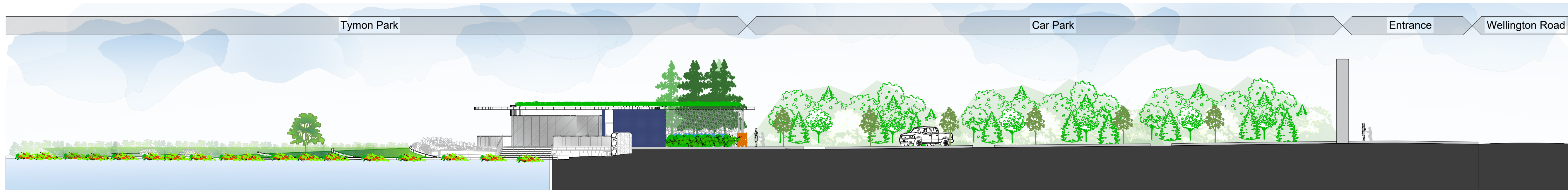
04 PROPOSED SITE SECTION / ELEVATION C P05 SCALE = 1:200 @A1, 1: @A3