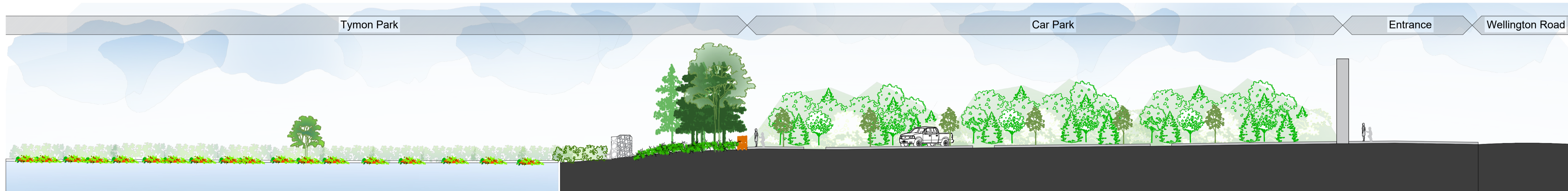
03 EXISTING SITE SECTION / ELEVATION C P05 SCALE = 1:200 @A1, 1: @A3