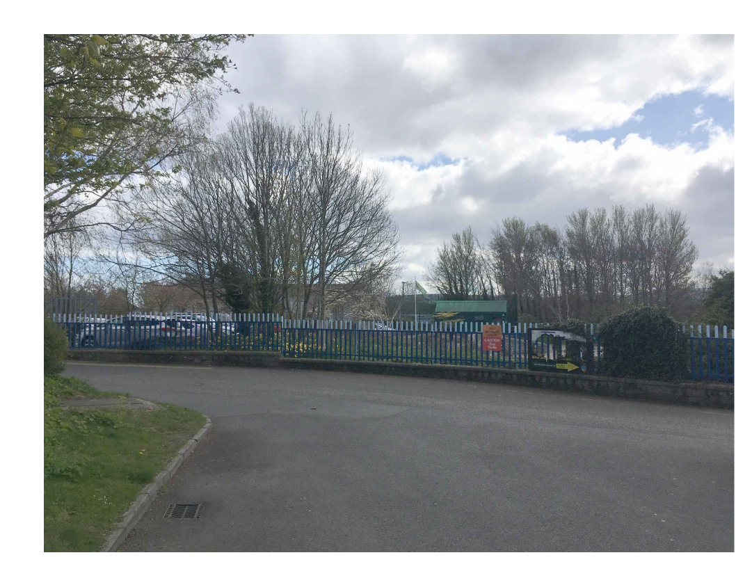
VIEW OF SITE FROM REAR/ NORTH O5 P04 SITE CONTEXT IMAGES