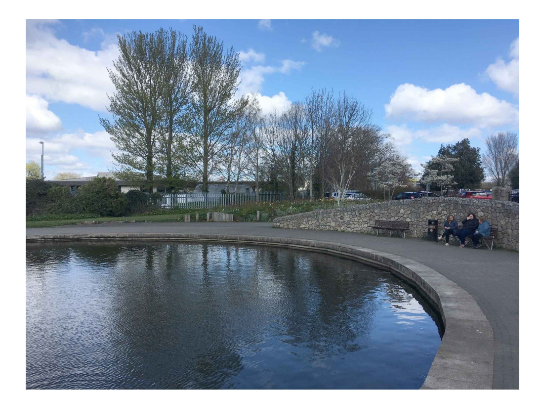
VIEW OF SITE FROM PARK/ SOUTH