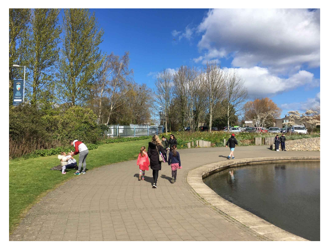
VIEW OF SITE FROM PARK/ WEST