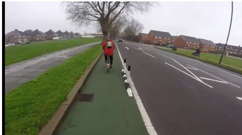
Example of a low-level segregation bollard