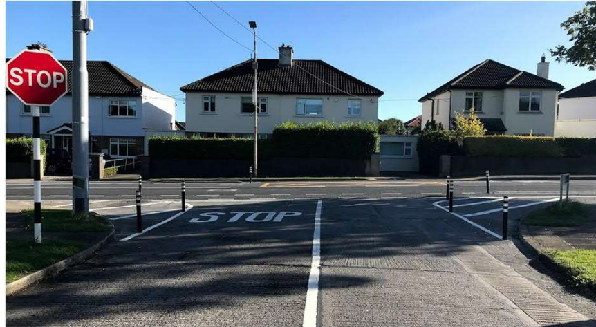
Tightened corner radii at side roads