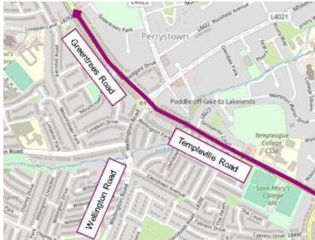
Phase 1 (Limekiln Lane and Templeogue College)