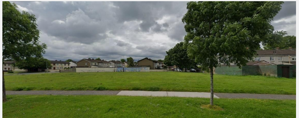
View from Bawnogue Road [ 1 ]