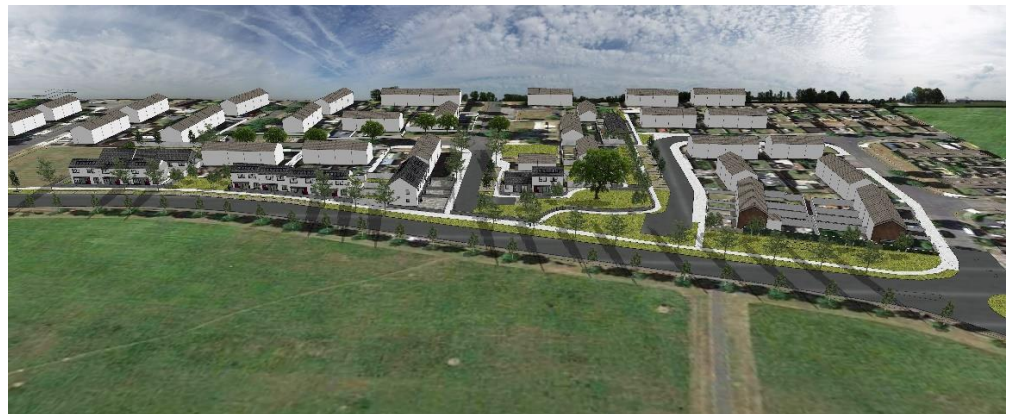
View from canal