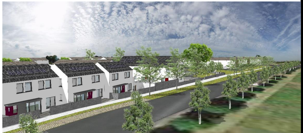
Two storey housing to main road, additional traffic calming to be agreed