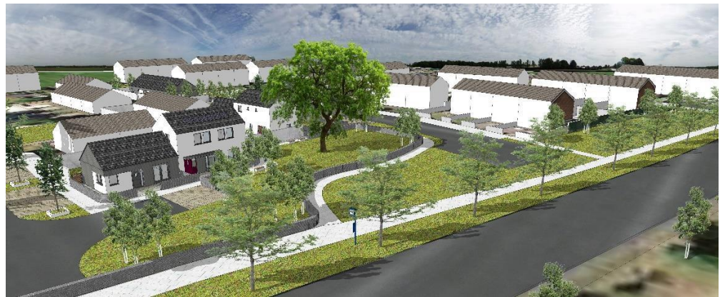
Retained oak tree and landscaped area