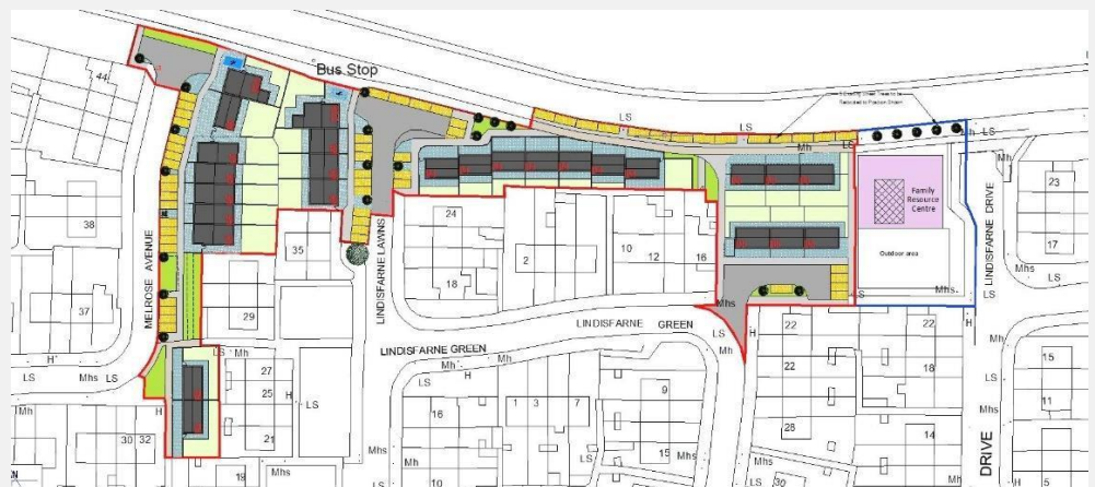
Plan of Proposal

The proposed housing is orientated to overlook road access to the new units, addressing existing issues of housing backing onto green space and roadways, with a backdrop of new or existing planting. The design of house types backing on to existing houses has been modified to ensure no overlooking from first floor windows occurs.