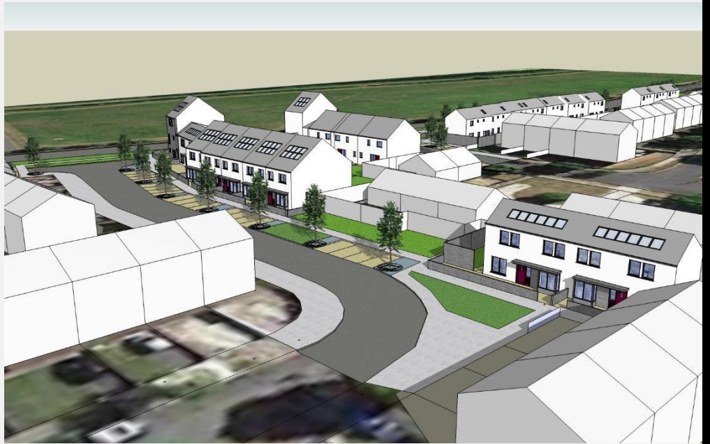
Image of Proposal from Melrose