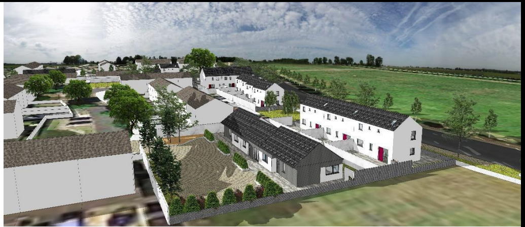
Single storey courtyard housing of Lindisfarne Green – 2 Storey to main road