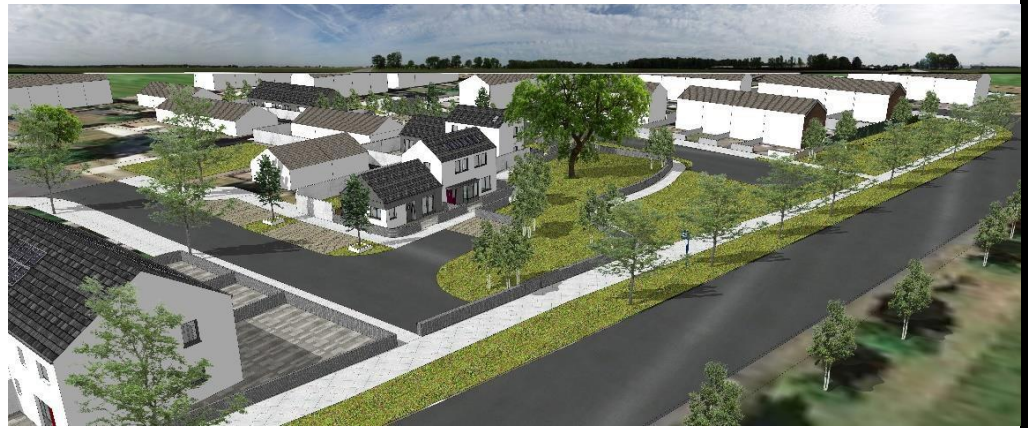
Lindisfarne Lawn and new housing facing landscaped area / bus stop