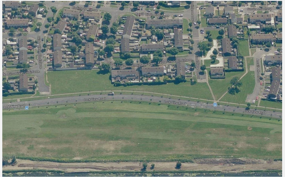
Aerial view 2