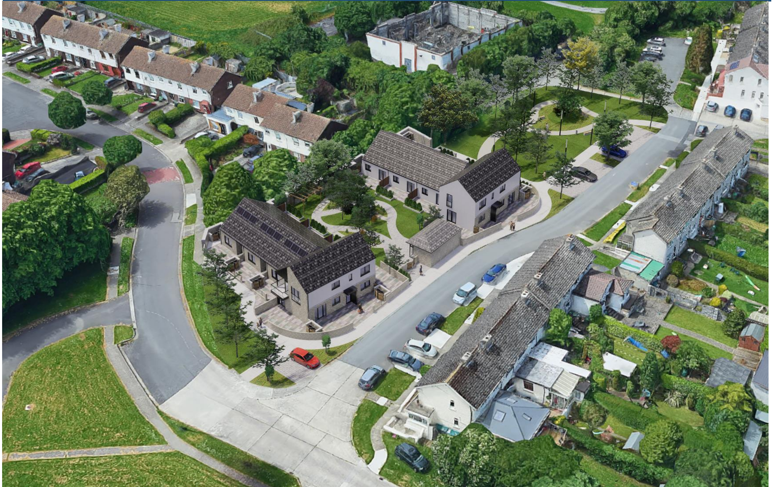
PROPOSED AERIAL VIEW