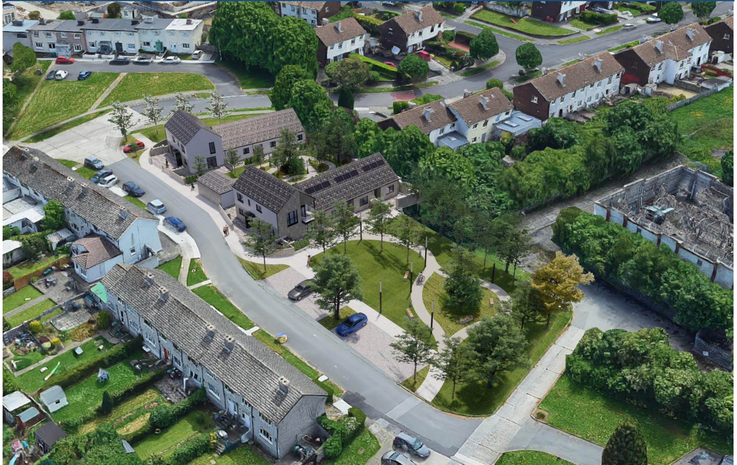
PROPOSED AERIAL VIEW