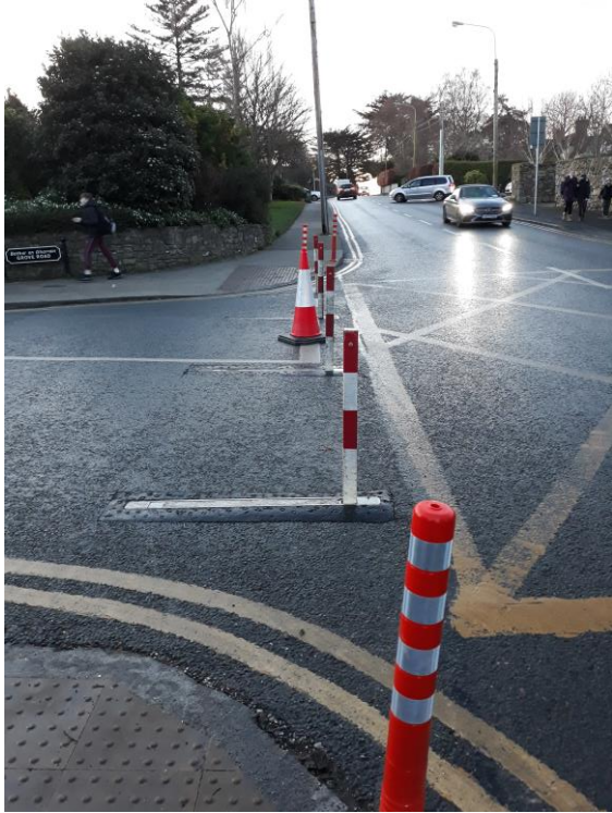
Rising bollards, Grove Road.