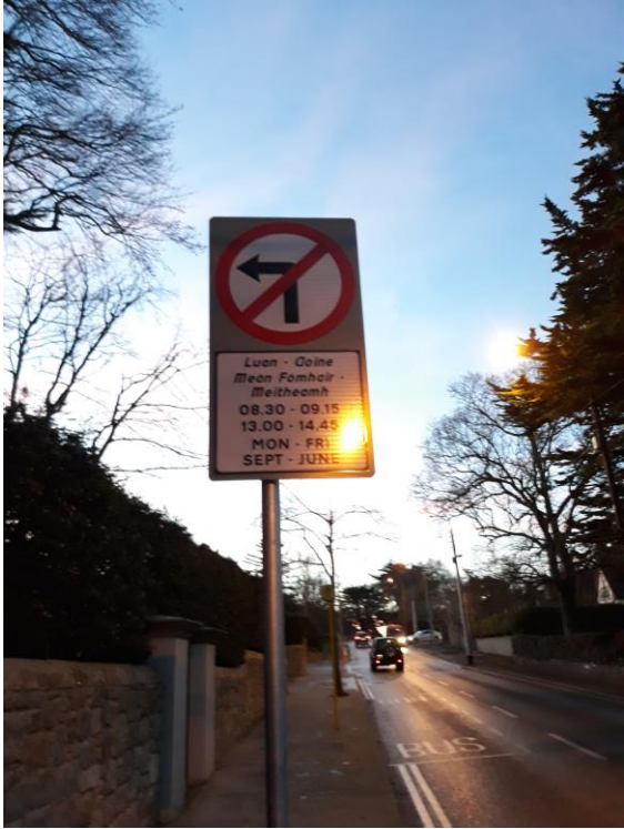
No left turn, Church Road.