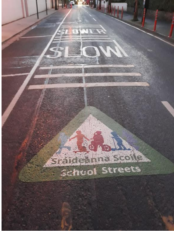
School Street Logo, Grove Road.