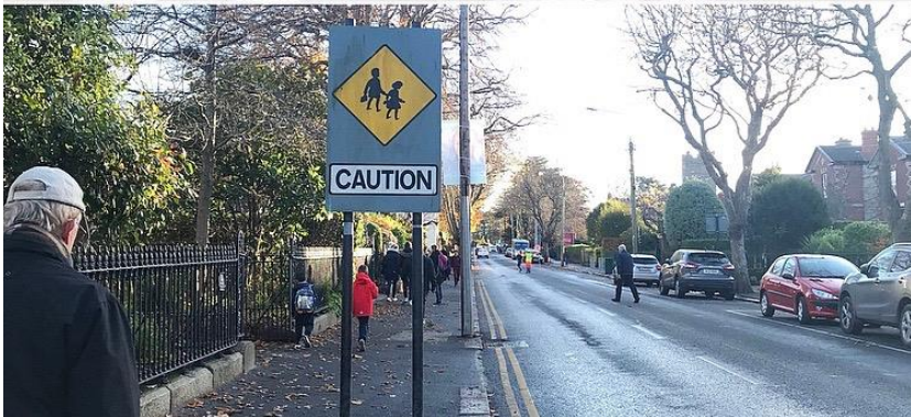
Church Rd. Before & After.