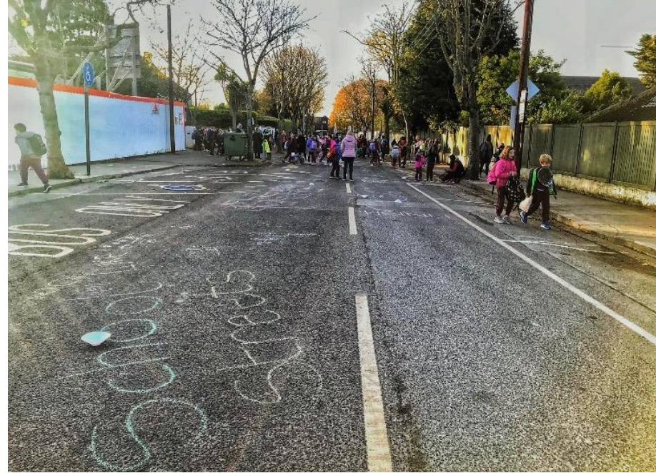
Grove Road, Malahide.

A school street is a road outside a school, or schools, with a temporary restriction on motorised traffic during school drop-off and pick-up times. The restriction, generally, applies to school related traffic and through traffic.