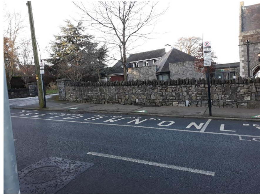
Set-down facilities, Church Road.