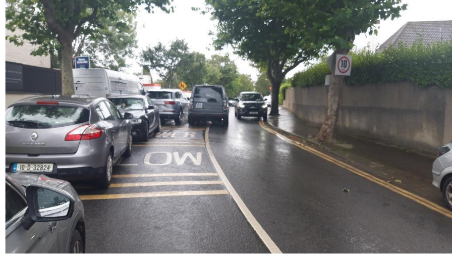
Grove Road, Malahide.

Health - traffic free environments encourage more people to walk and cycle which improves our physical and mental health.