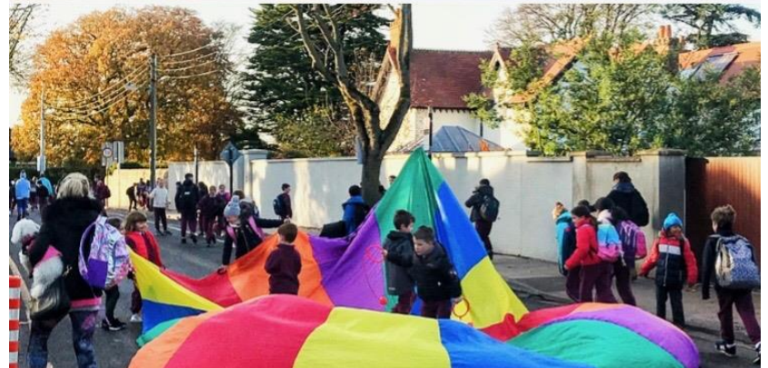
Grove Rd. Before & After.