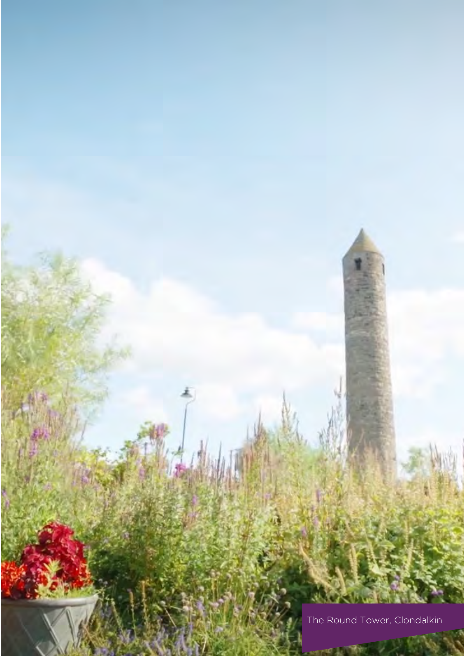
The Round Tower, Clondalkin