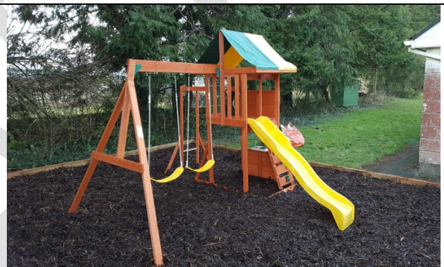
CASP Respite House Playground