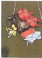
16 Drakes Pride Bowls & extras