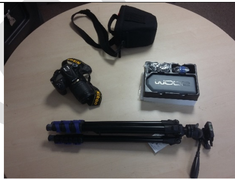
Muscular Dystrophy Ireland Equipment