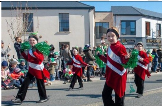
Tallaght Marching Band Equipment