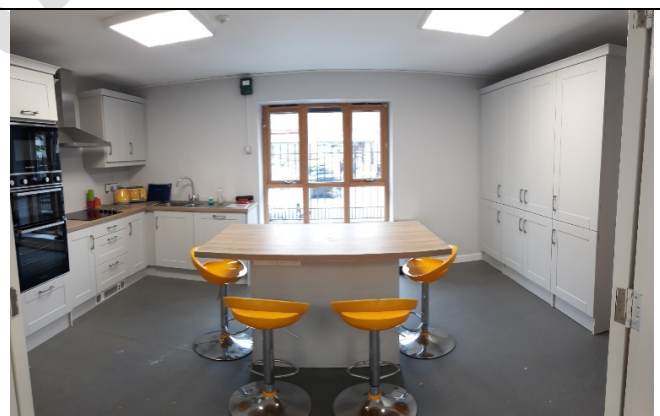
Kiltalown Foroige Kitchen