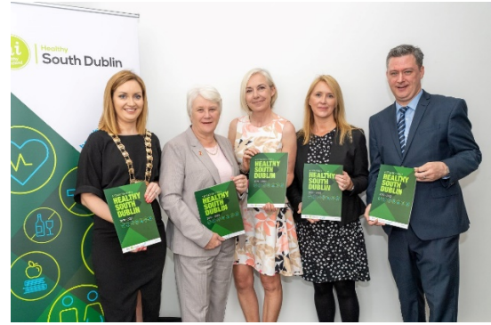
Insert Caption and names L-R]