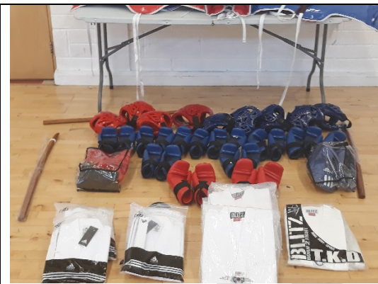
Fettercairn Mudo Club Equipment

[insert explanation of project – images below]