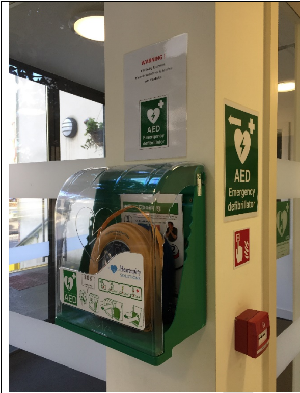
St John of Gods Defibrillator