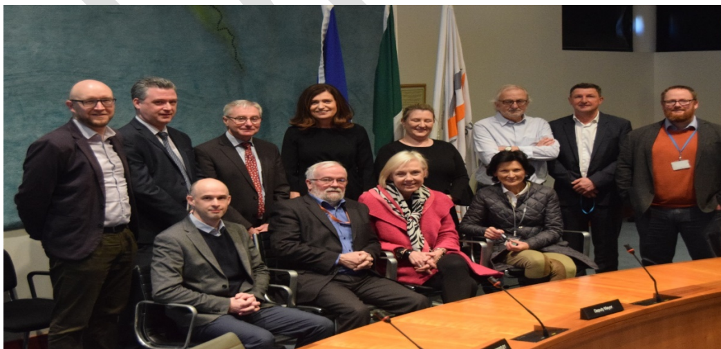
[insert caption and names Backrow L-R front row L-R]