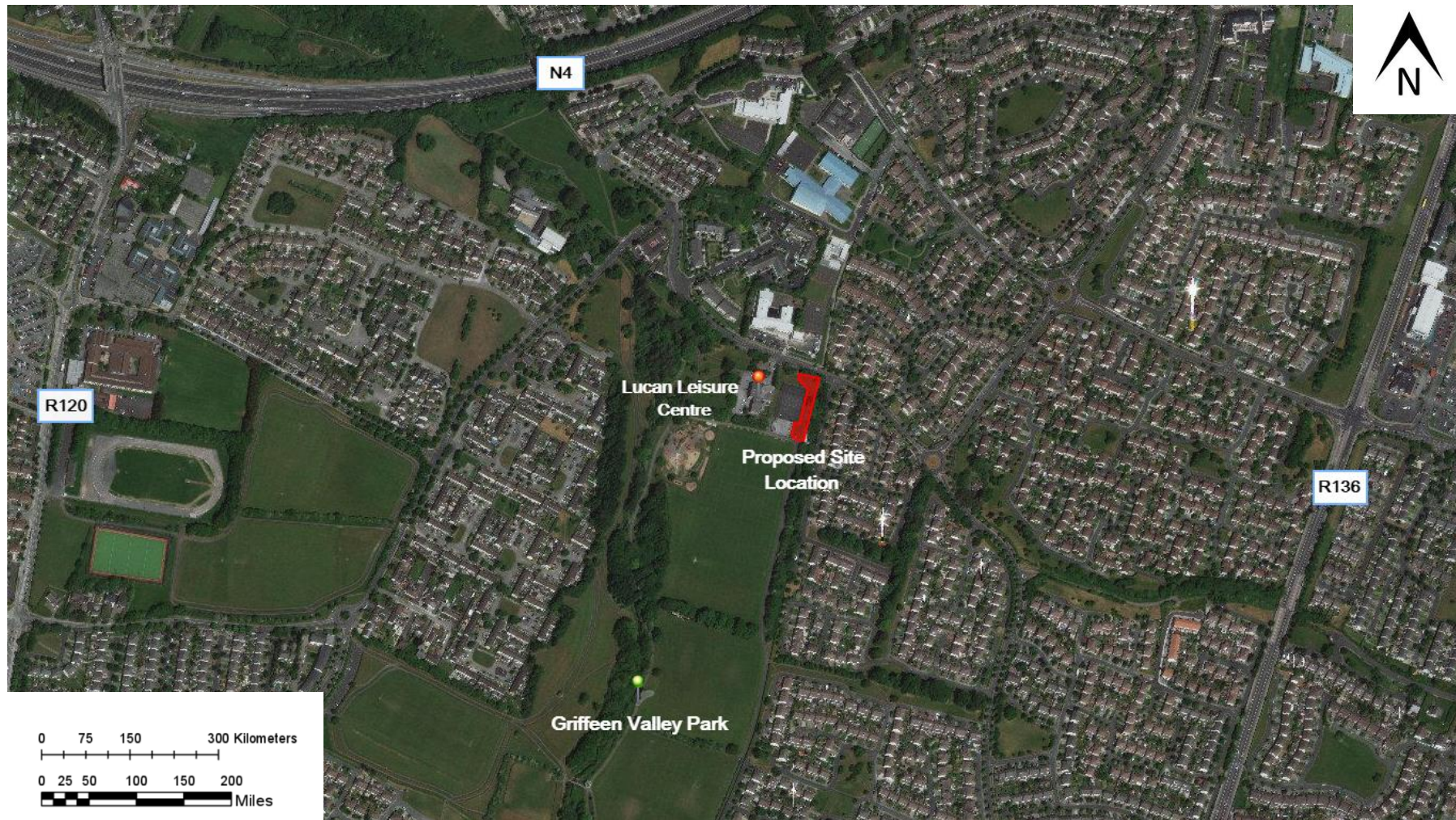
Figure 1 - Location Map