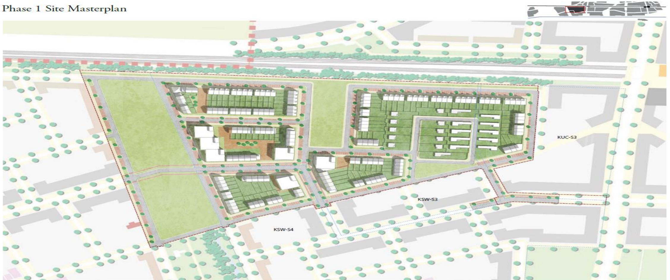
Phase 1 Site Masterplan