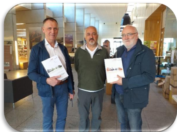
Figure 2.2: Photographs from the Library Public Consultations