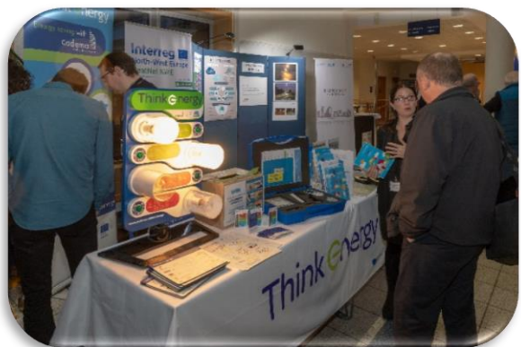
Figure 2.1: Photographs from County Hall Public Event 19-02-2019 hosted by South Dublin County Council