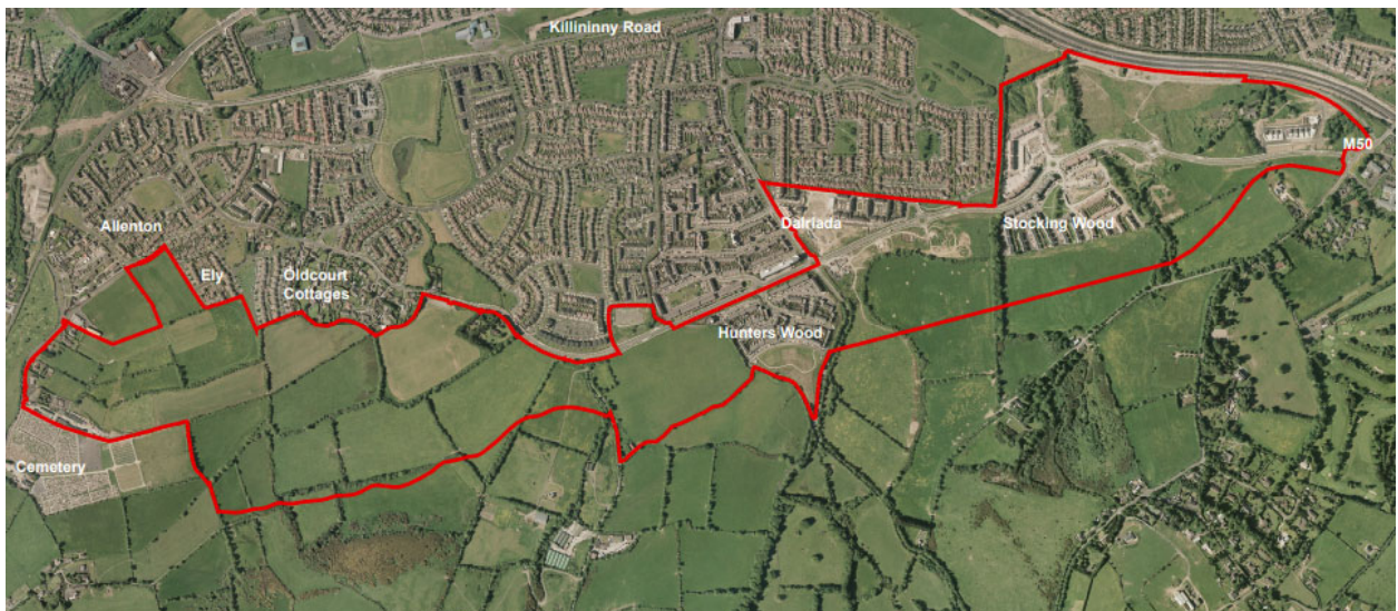
Figure 1: Ballycullen-Oldcourt LAP Plan Area

The Ballycullen-Oldcourt LAP was adopted in May 2014. Figure 1 illustrates the Plan area. It will remain in force for 6 years from its adoption until 2020. The procedure introduced under Section 12 of the Planning and Development Act 2010 gives the Council the option to extend the Ballycullen-Oldcourt LAP to May 2024 provided the Planning Authority resolve to do this before 20 th June 2019 (an additional 45 days are allowable relating to the Christmas period for each year of the life of the Plan as per Section 251 of the Planning and Development Acts 2000-2015).