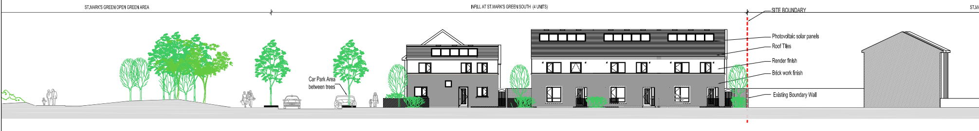
03 STREET ELEVATION ST MARKS GREEN SOUTH - VIEW D 1:200 (A1)