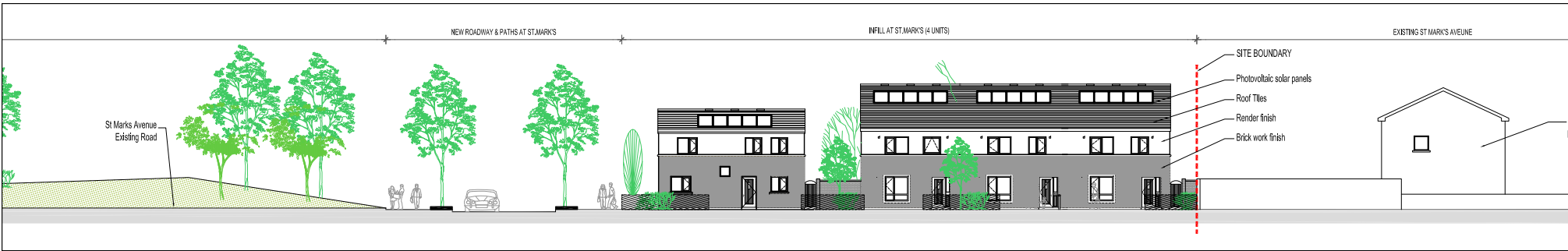
03 STREET ELEVATION ST MARKS AVENUE - VIEW A 1:200 (A1)