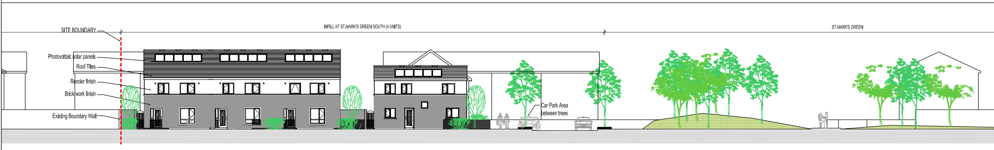
03 STREET ELEVATION ST MARKS GREEN SOUTH - VIEW C 1:200 (A1)