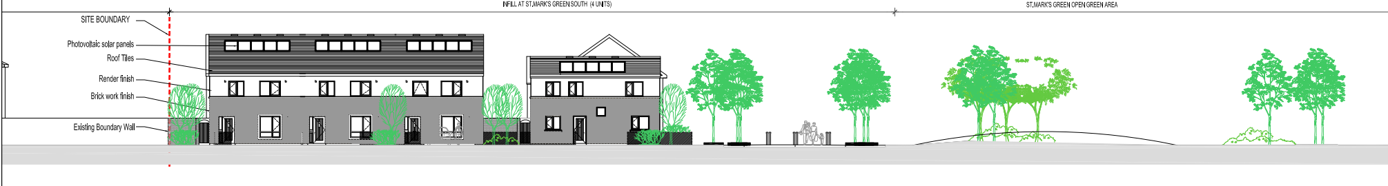
03 STREET ELEVATION ST MARKS GREEN SOUTH - VIEW E 1:200 (A1)