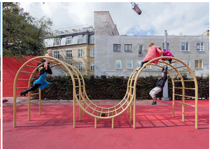
Combination of seating/climbing and exercise/gym equipment