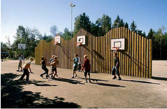
Informal games wall