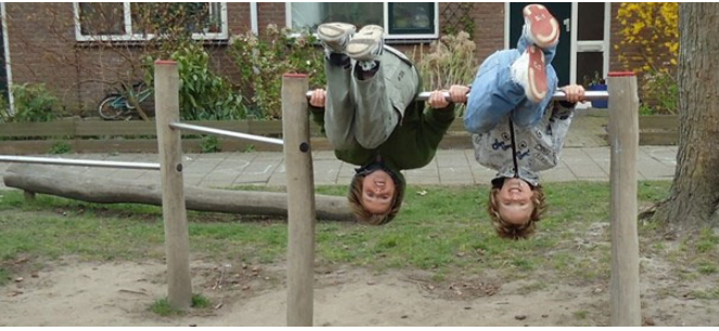
Tumble bars provide an opportunity for fun and exercise