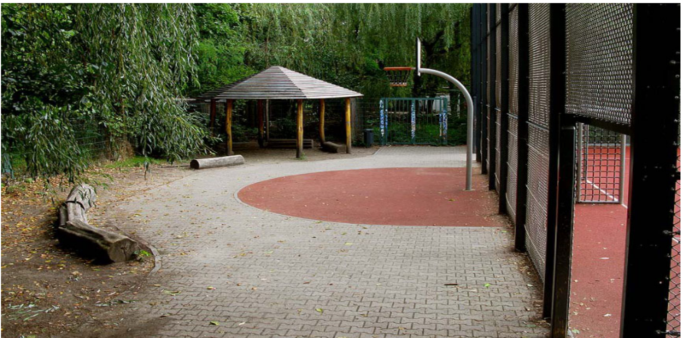
Area with a combination of ball court, shelter and seating in a park setting