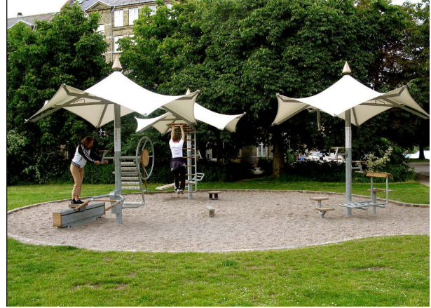
Sheltered exercise area/seating point