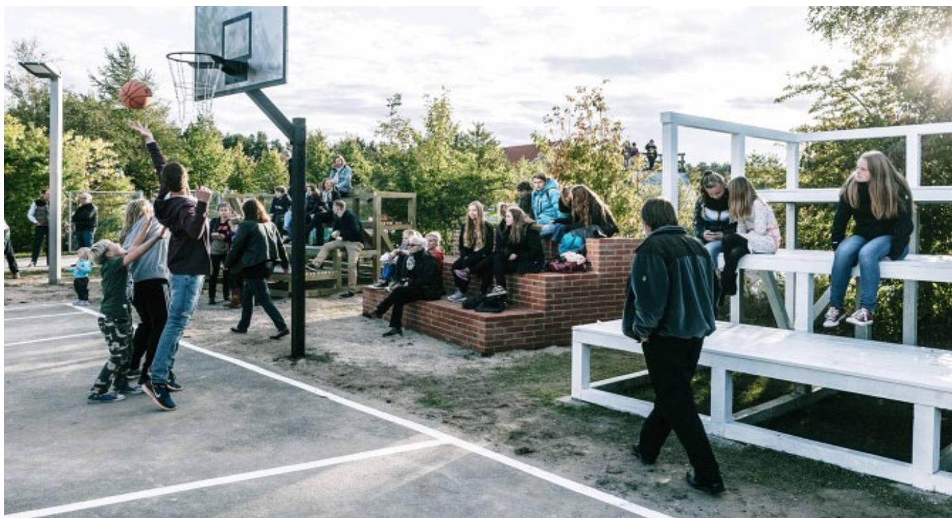
Basketball courts with seating above. Exercise Park below

These areas allow for self-directed activity rather than organised sport but require some sports infrastructure. All-weather pitches, MUGAS and Astro pitches were the most popular followed by skate-parks, biking facilities, basketball courts and outdoor fitness areas. These areas should have associated seating allowing teenagers to drop in and out of the activity or just observe.