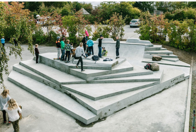
Skateboarding area & hangout combined