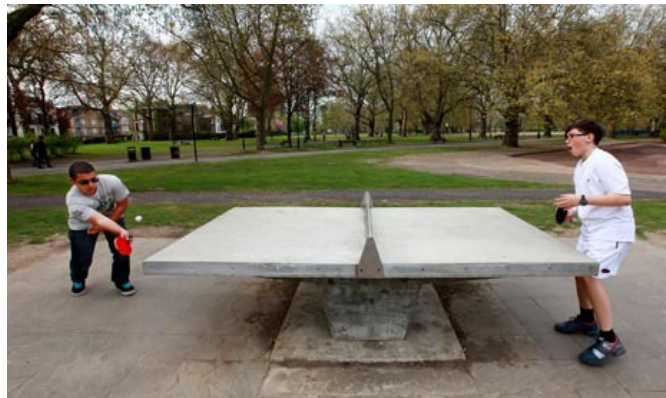
Table Tennis tables