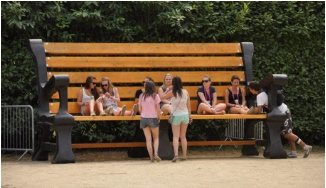
Non formal Seating can liven up public space and can make for a fun hangout spot- a place to be seen.