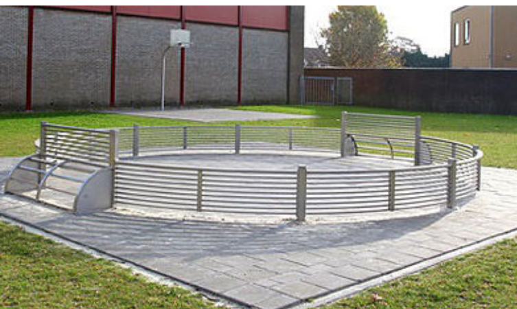
Informal kickabout area