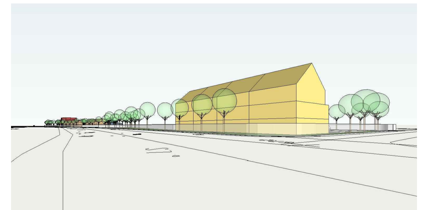
View of western end of proposal from New Nangor Road