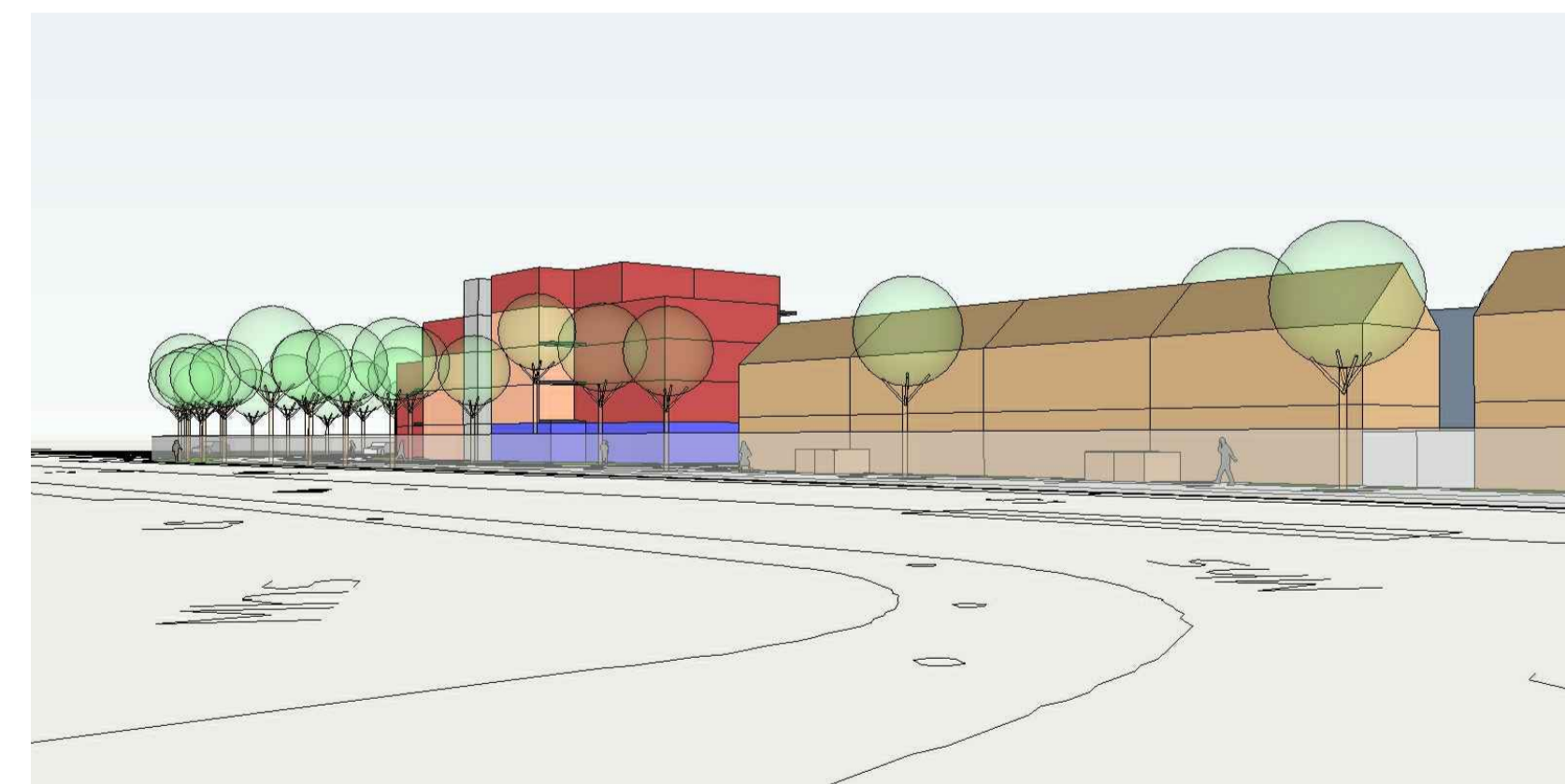
View of proposal from New Nangor Road, looking towards the roundabout