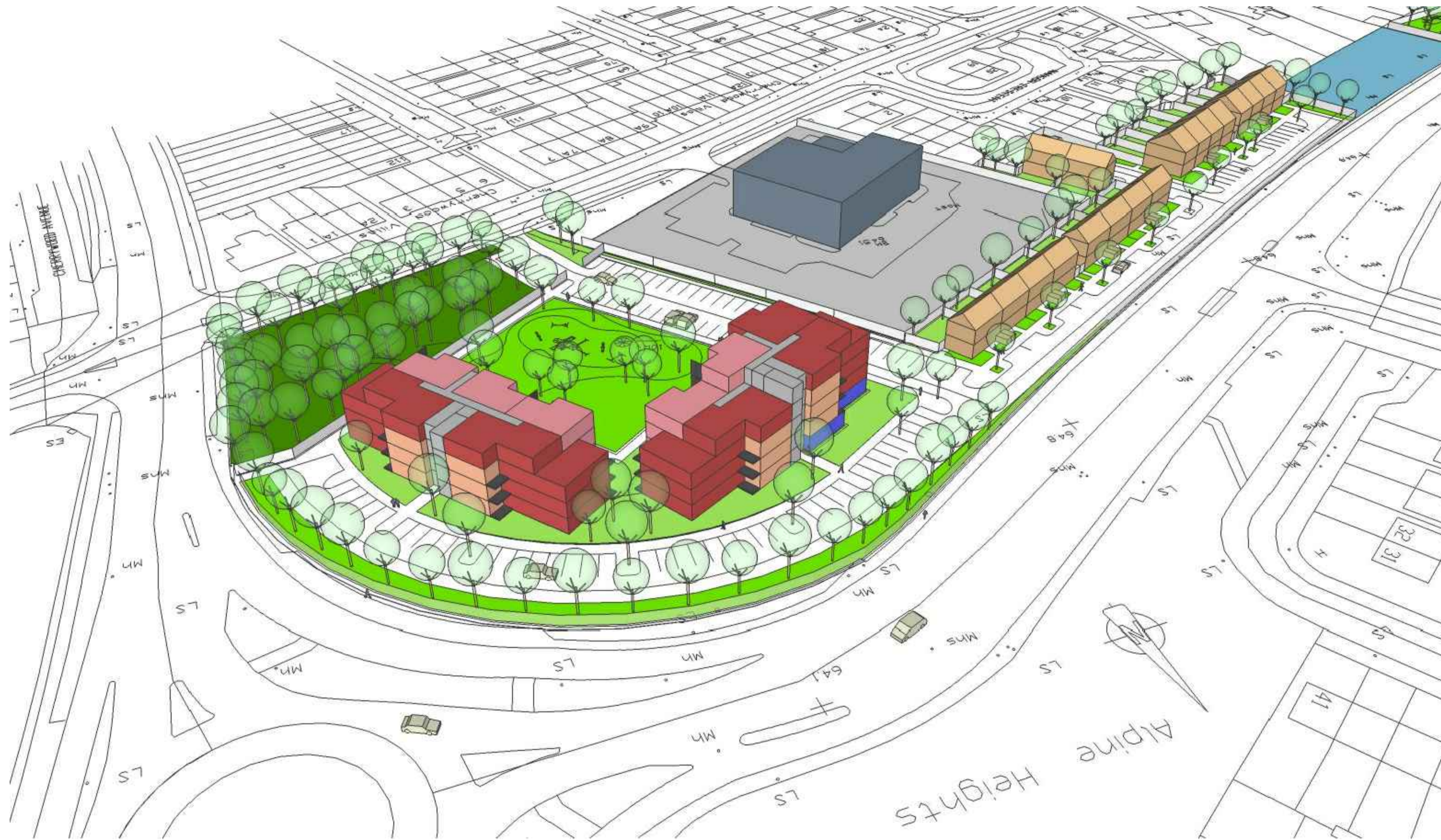
Aerial view of proposal from North