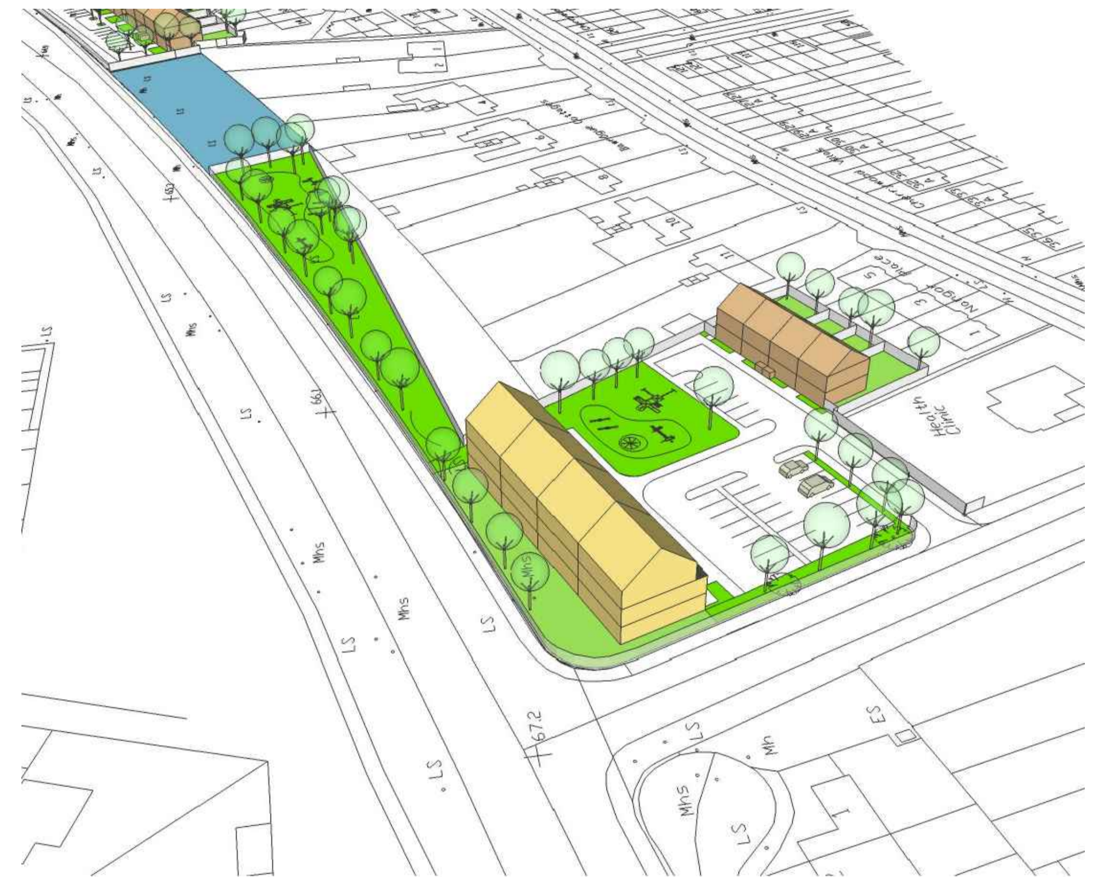
Aerial view of proposal from West