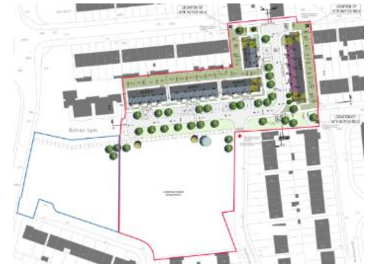
Fernwood – 23 Units