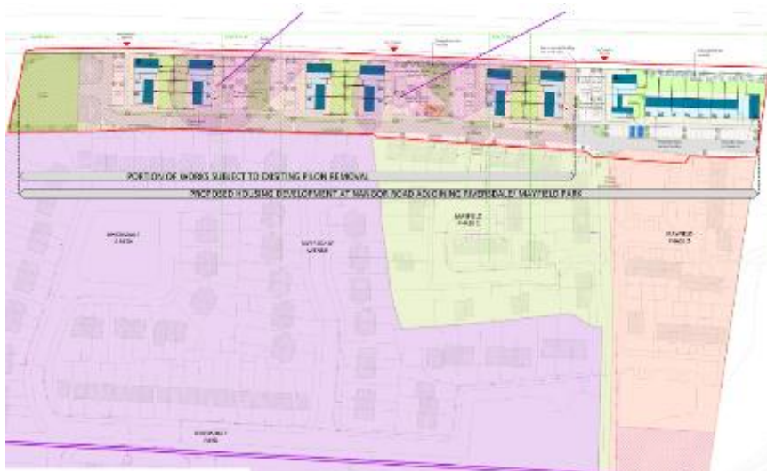
Riversdale - 44 Units