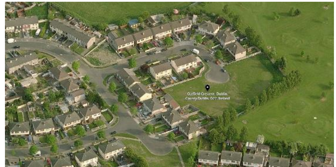
Oatfield Crescent, Clondalkin