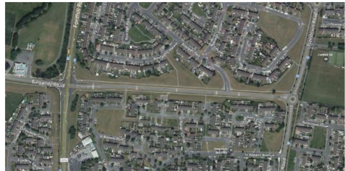
St. Marks Link Road (Ramp Road)