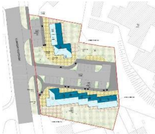
St. Catherines, Knockmore – 13 Units