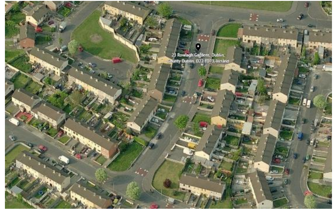
Rowlagh Gardens, Clondalkin (Specific Site Location tbc)