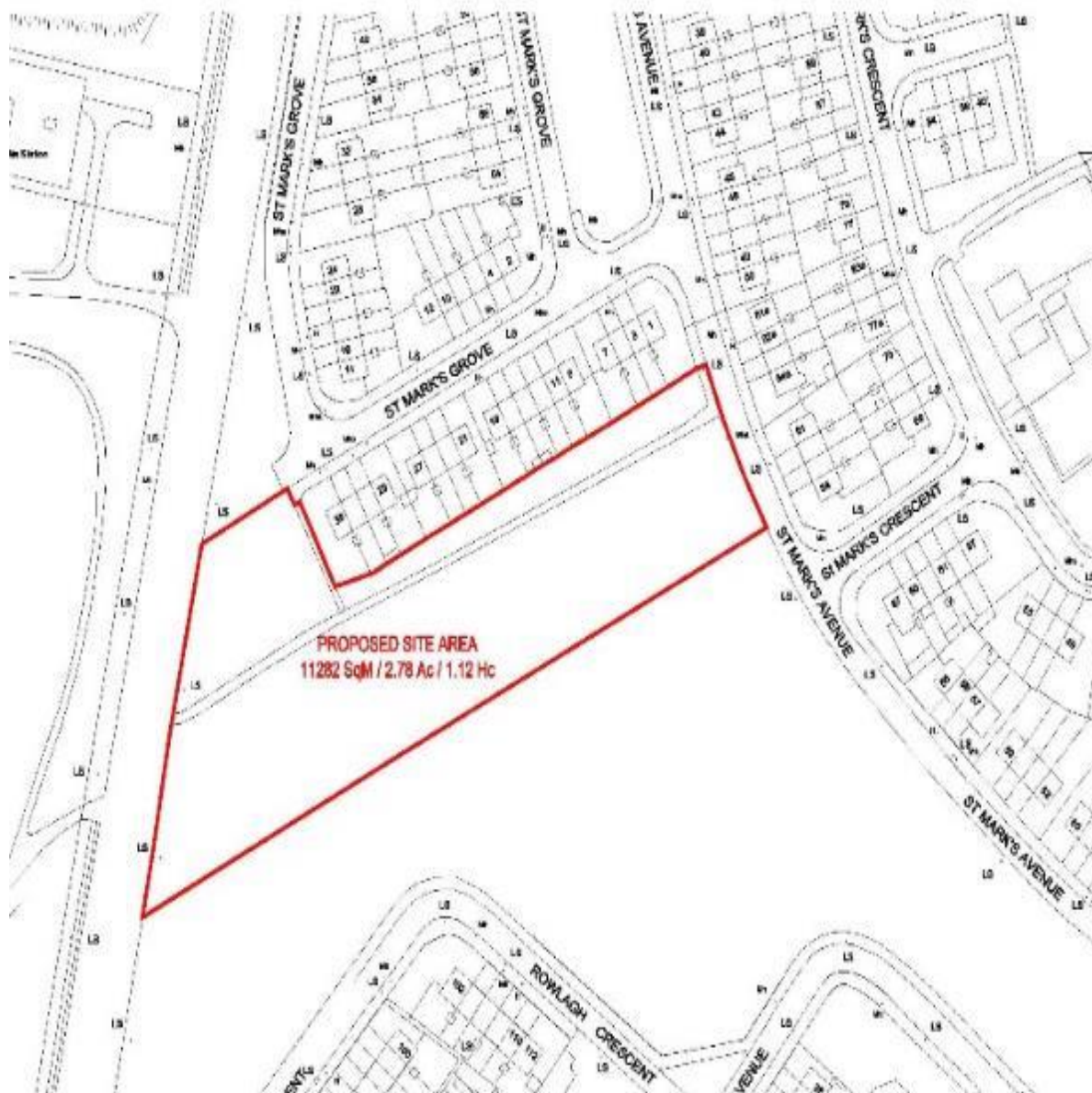
St. Marks Avenue