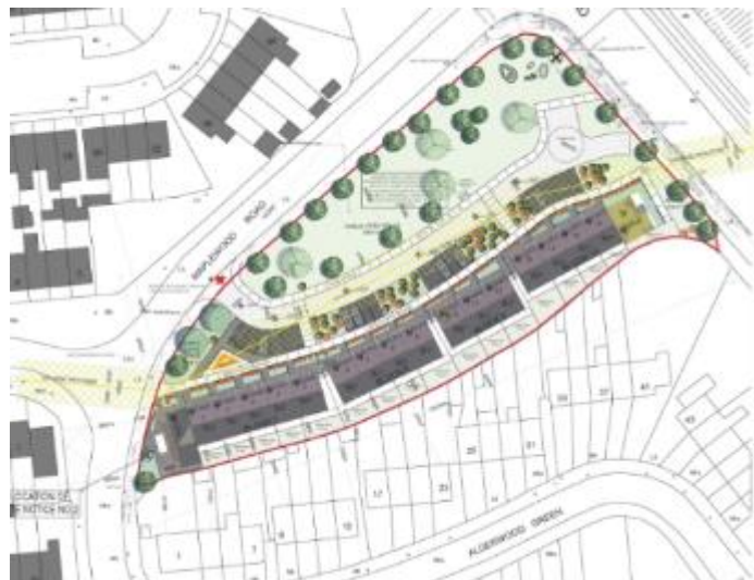
Maplewood - 17 Units