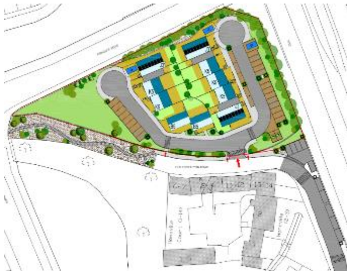
Homeville - 16 Units