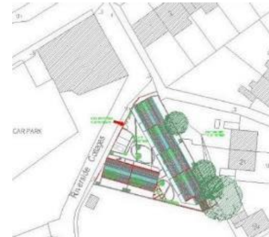
Templeogue – 11 Units