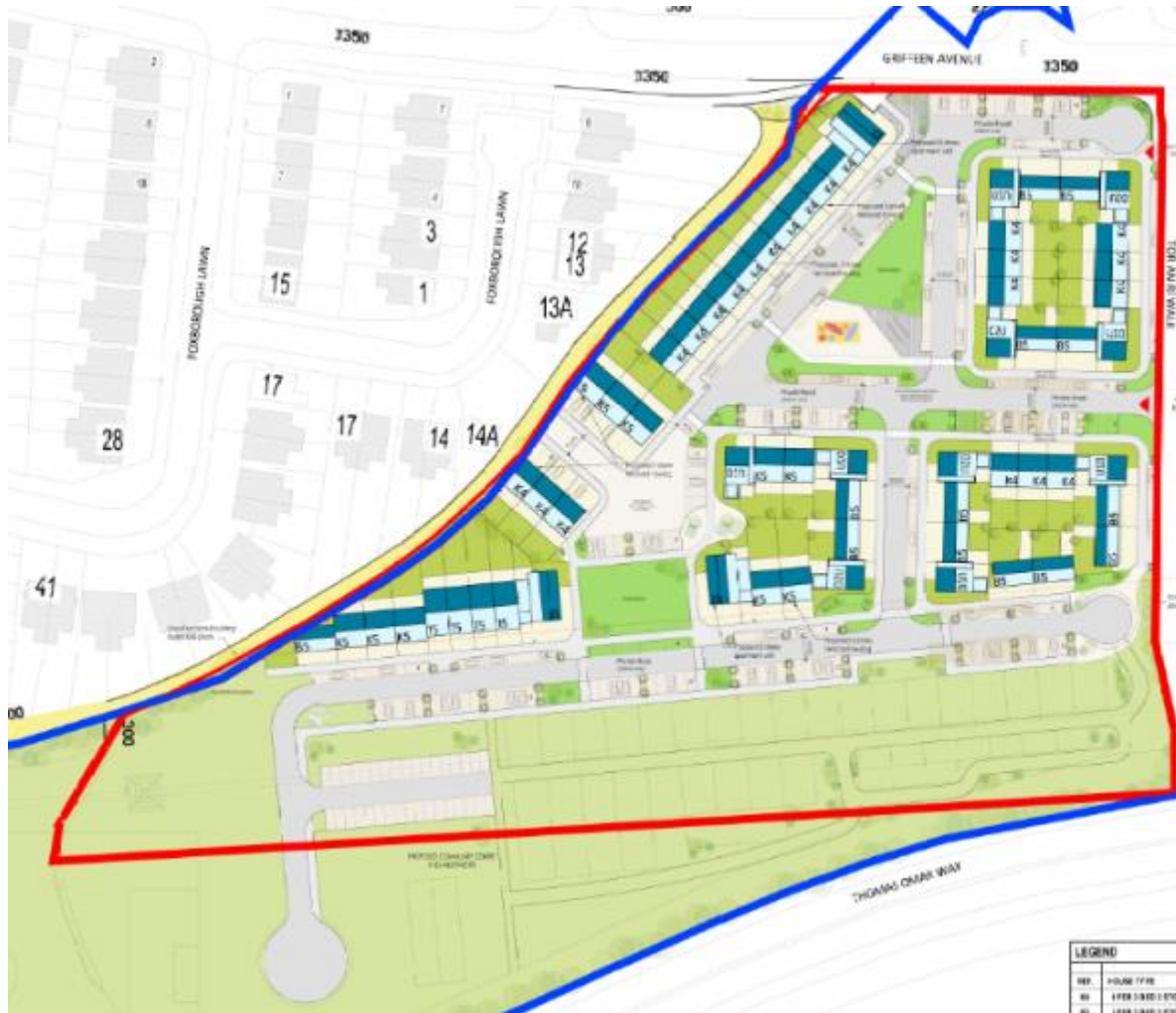
Balgaddy – Proposed