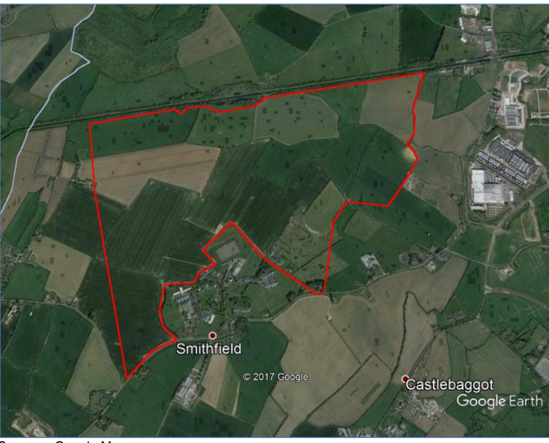
Figure 2.1 – Site Location (approximate boundary only)

The site rises in elevation moving south away from the canal with a high point of 86m A.O.D located close to Peamount Hospital. It currently exists as mixed agricultural land predominately used for arable farming.