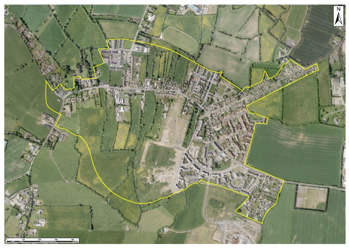
Figure 1: Newcastle LAP Plan Area

The Newcastle LAP was adopted by the Elected Representatives of South Dublin County Council in November 2012. Figure 1 below illustrates the Plan area. It will remain in force for 6 years from its adoption until 2018. The procedure introduced under Section 12 of the Planning and Development Act 2010 gives the Council the option to extend the Newcastle LAP for a further period of five years until 2022.