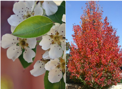
Ornamental Pear Tree