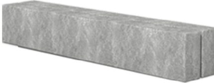
Natural Stone Bench