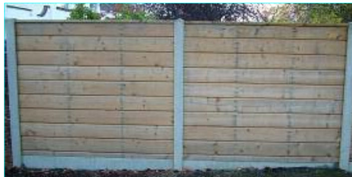
Boundary Type B and C - 2m high and 1.2m high concrete post and timber panel fencing