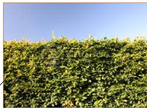
Boundary Type D - Beech Hedge with post and wire fencing behind