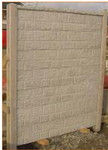
Boundary Type A - Freindly Fencing