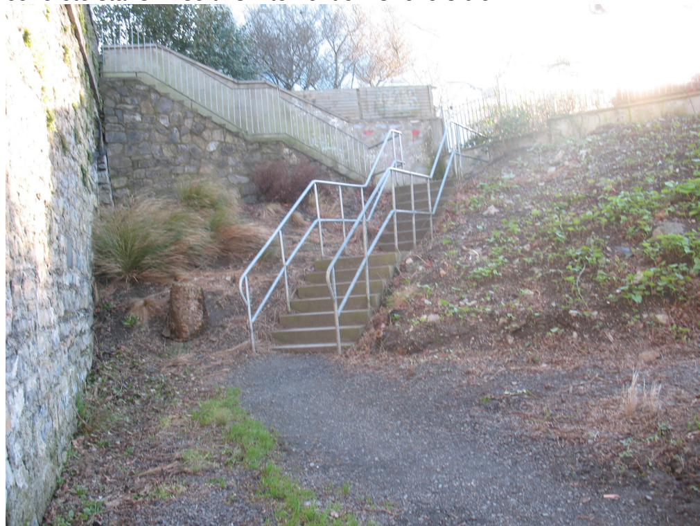
Recent photo of existing concrete stairs

The proposed works to install a new public stairs and access platform will not materially affect the external appearance or the character of this structure. The works will require the removal of a 480mm long section of existing calp limestone wall and granite coping along the south approach to Lucan bridge. The works will be carried out by a qualified stone mason using traditional skills and materials and the opening will be properly dressed and finished so as to appear consistent with the surrounding wall. In mitigation, the proposed works are to a wall which has been altered in the recent past; an opening in the wall has been made previously to permit access to the existing concrete stairs. Also this intervention is reversible.