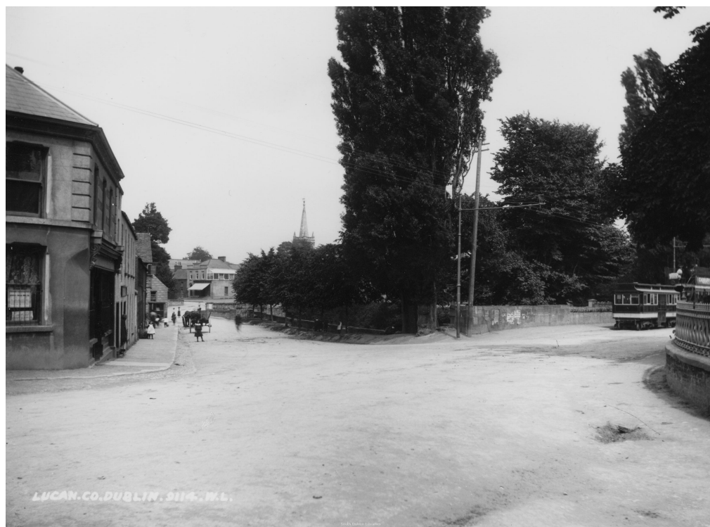
Photo taken from Griffeen Bridge looking toward Vesey Bridge in early 1900s

The proposed works to install a bridge crossing the canalised river and to make an opening in the wall will materially affect the external appearance or the character of this structure. The works will require the removal of a 3.5 metre long section of existing calp limestone wall along Main Street. The works will be carried out by a qualified stone mason and the opening will be properly dressed and finished so as to appear consistent with the surrounding wall. In mitigation, the proposed works are to a wall which has been altered in the recent past; the wall has been raised in height. Also this intervention is reversible.