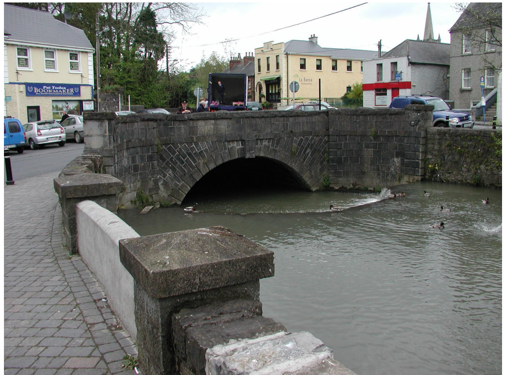
Photo showing blocked up opening in section of wall at Vesey Bridge in 2000