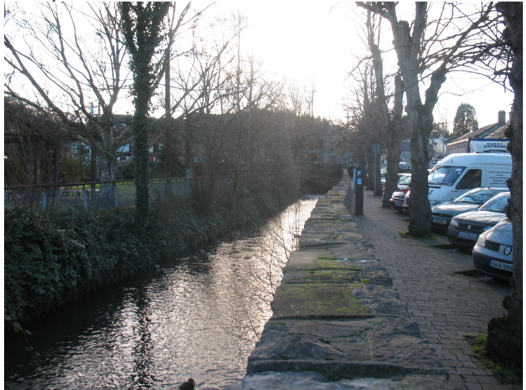
Recent photo of river showing raised wall and railings