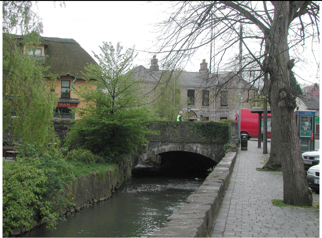
Photo of canalised section of river looking toward Griffeen Bridge taken in the past decade before wall was raised