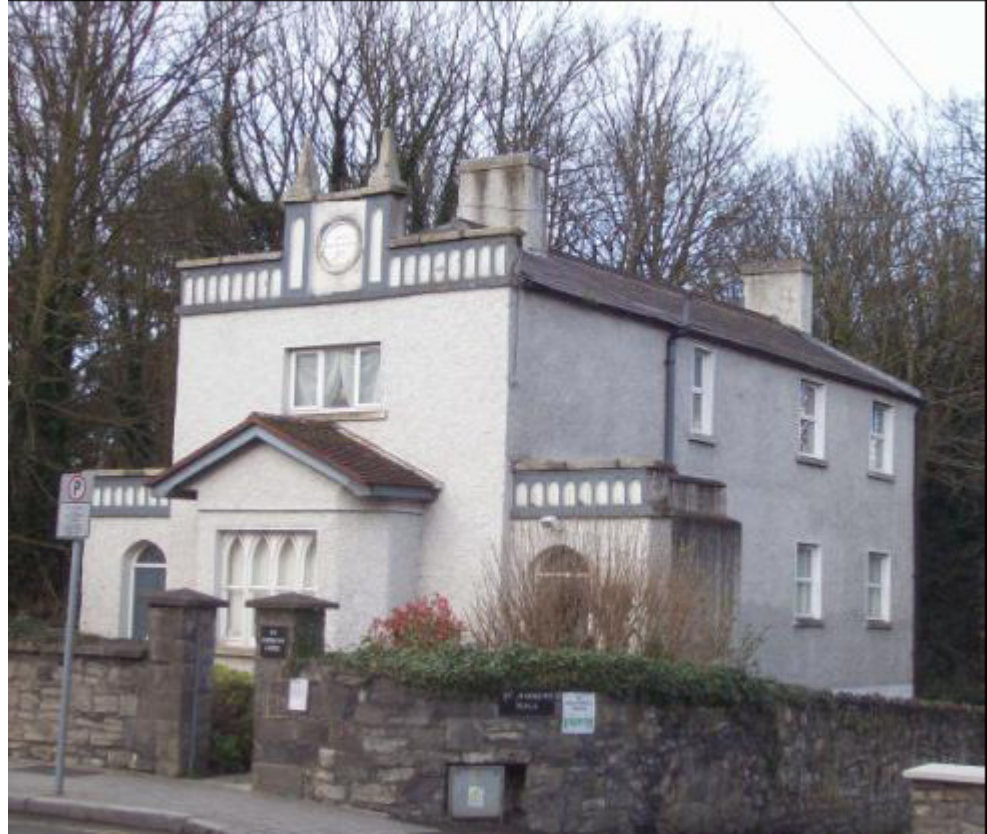
Recent photo of St. Andrews Lodge

In addition to the above statutory protection, Lucan village is a Zone of Archaeological Potential and is therefore subject to statutory protection in the Record of Monuments and Places, established under Section 12 of the National Monuments (Amendment) Act 1994. This is referred to in the Council's Record of Monuments and Places (R.M.P.) (Recorded Monument Reference No.