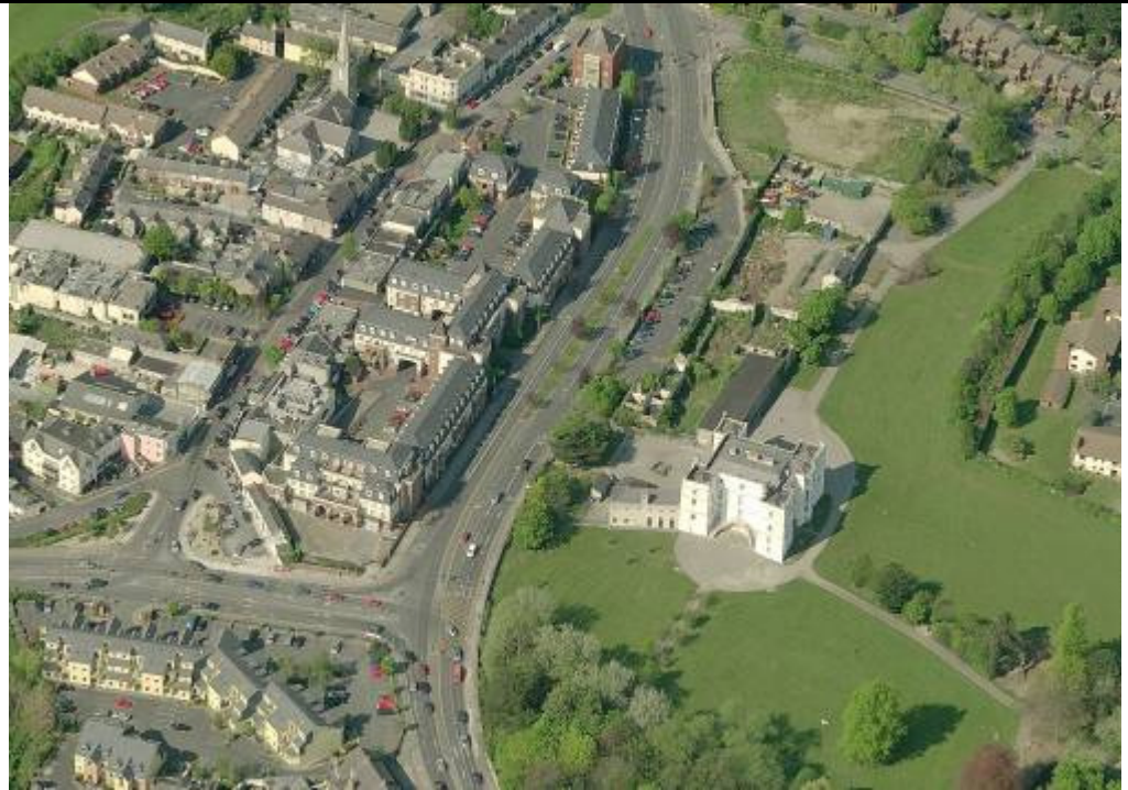
An aerial view of the proposed development site from the south-east. The castle and tea rooms are visible in the bottom right of the photo, the existing car park and former stable buildings further north. The village main street extends from the lower left side to upper middle of the photo. The car park operates a one-way system, entrance from the northern end and exit from the south.