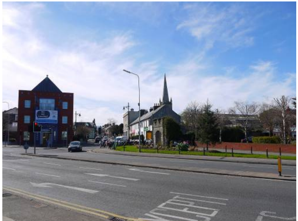
A view of the junction of Rathfarnham road, a bypass road with the old village main street. The site of the proposed project is very exposed and poorly contained. The proposed project will screen the area with a new limestone wall and with new planted trees.

The pedestrian crossing point to the credit union building is very wide. The proposed project will reduce the radius of the junction of Rathfarnham road and Main street by approximately 5 metres and will reduce the road width also at this point, extending and widening the public footpath while also allowing vehicular traffic to safely exit the village onto the dual carriageway. The public footpath will be made wider and the crossing point narrower and easier to cross.