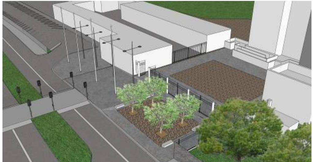
An aerial view of the proposed project beside Rathfarnham castle from the south-west