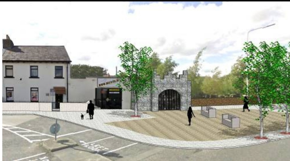
A view of the proposed project beside the entrance to Rathfarnham old graveyard from the east