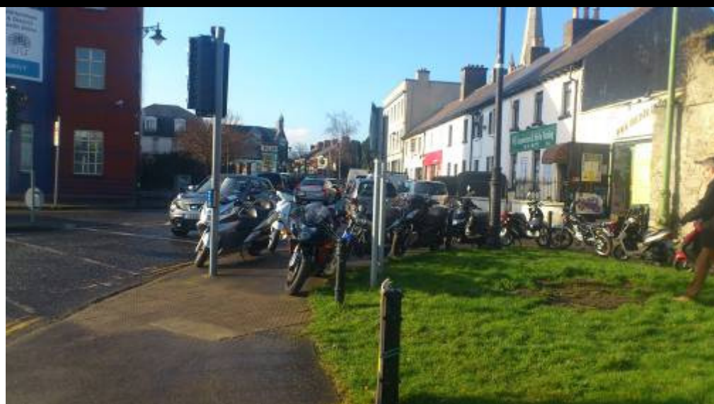
A view of the north end of Main Street, Rathfarnham village. The castellated entrance to the old graveyard is on the extreme right side of the photo.

The project proposes the extension and improvement of the approach to Rathfarnham castle to improve its accessibility, security and presentation. No works are proposed to Rathfarnham castle itself which is owned by the State. Responsibility for its maintenance is devolved by the Minister of Arts Heritage and the Gaeltacht to the Office of Public Works.