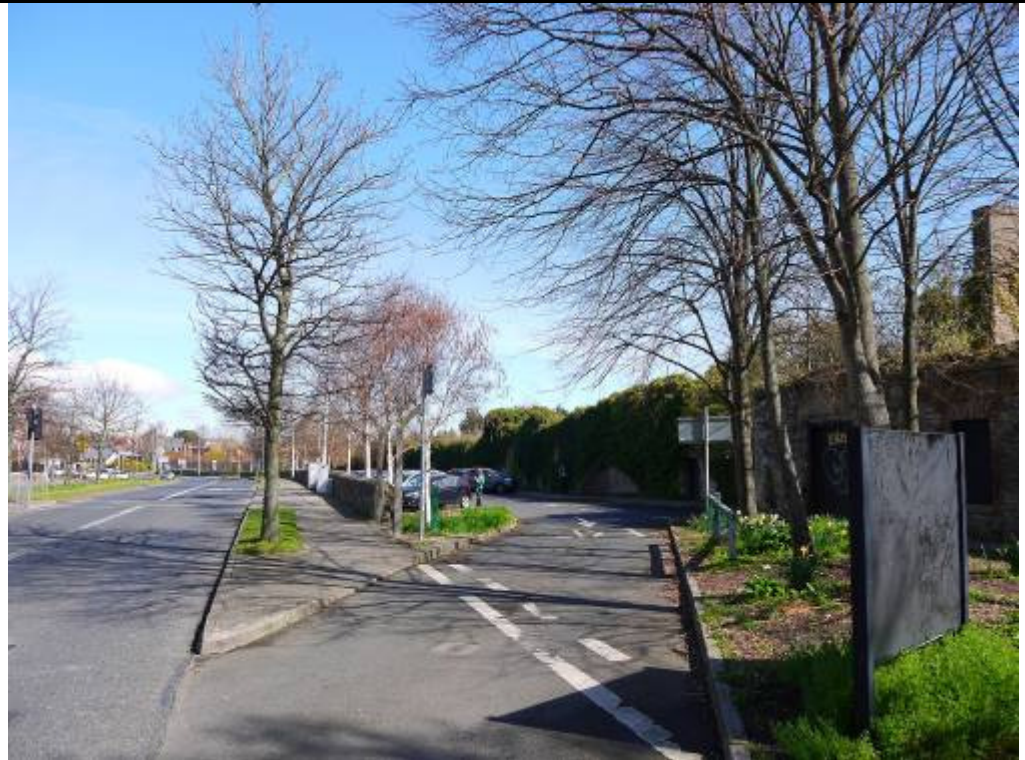
The proposed development site beside Rathfarnham castle viewed from the south. At present pedestrians from the village need to make two road crossings over each dual carriageway and then cross the exit road from the car park. The approach and view is also marred by the trees, ivy and shrubs which have colonised the former stable buildings.