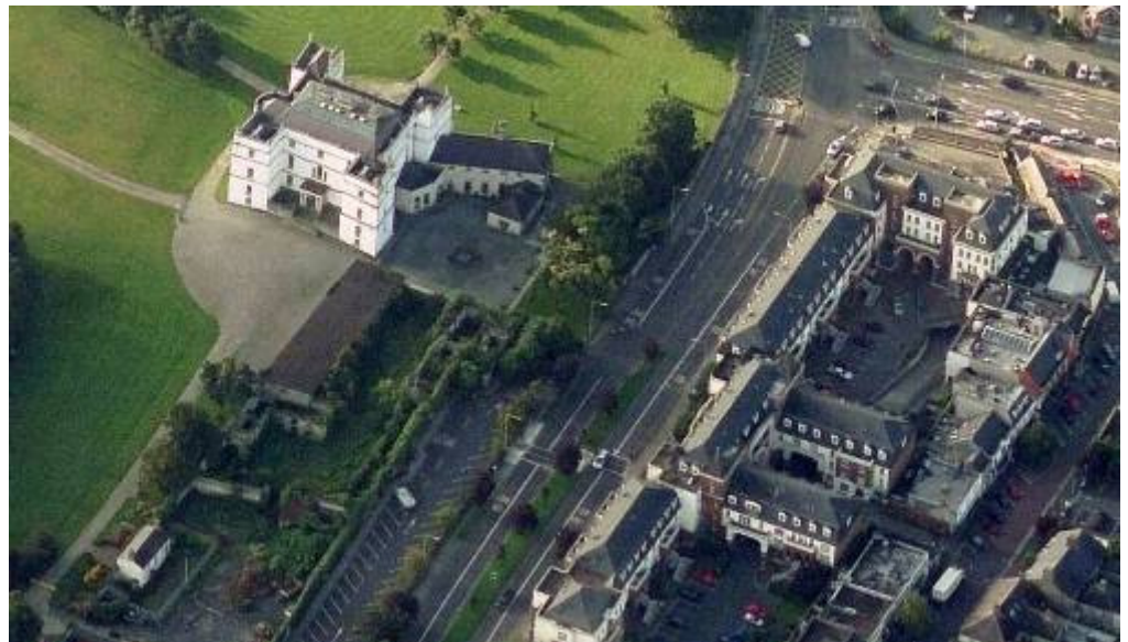
An aerial view of the proposed development site from the north-west. The existing road crossing points are in the centre of the photo. The village main street is on the lower right side of the photo.