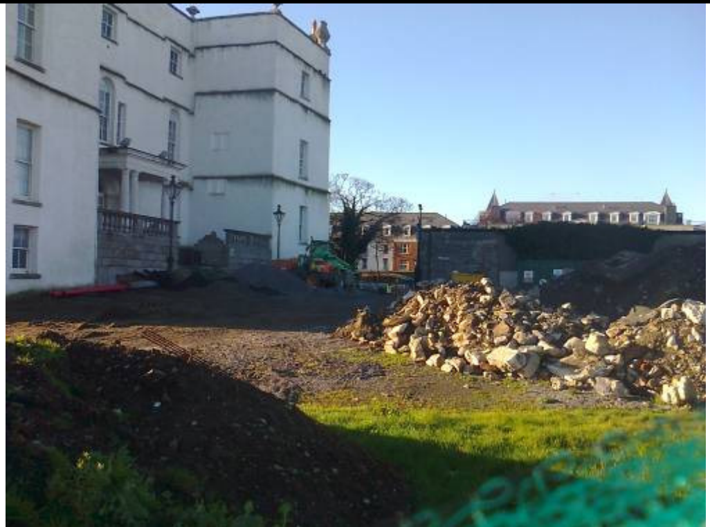
Works on site to improve the forecourt of Rathfarnham castle by the Office of Public Works viewed from the north-east. Photo taken on 6 th January 2015

The proposed project would cross the existing north-south route of the dual carriageway with an improved east-west link for pedestrians between the historic core of the village and the castle. The number of road crossings would be reduced from three (as exists at present) to one. The proposed project will extend the pedestrian zone around the castle and forecourt and will complement and extend the works being done by the Office of Public Works at present. The works will also improve access to the castle and its public park by mobility impaired visitors by creating two new car parking spaces at the forecourt. It is proposed to retain two of the three existing trees on the site. Further information on this aspect of the project is provided in the Design, Condition and Impact Assessment Report, which is attached to this report as an appendix.