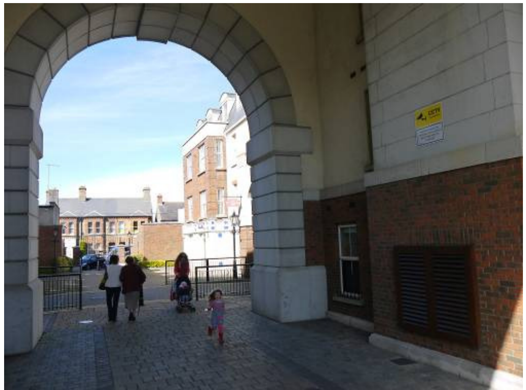
The existing connection from the village to the dual carriage way and castle through the Castlecourt development.