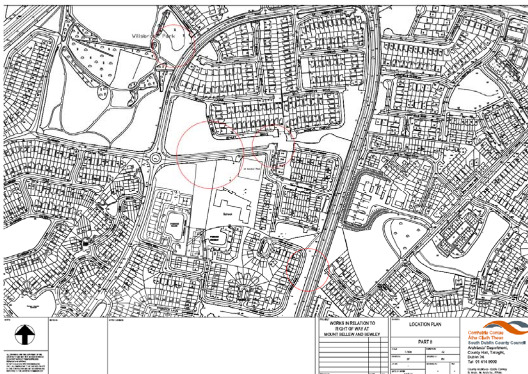
Figure 2.1 Lands proposed for the works in relation to the right of way, including option of closure and option to enhance the route and provide car parking at Willsbrook Park, the Outer Ring Road and on Mount Bellew Way at Ballyowen, Lucan, outlined in red.