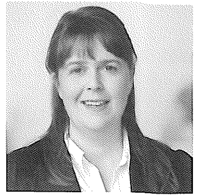
Joanna Tuffy, TD