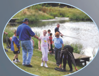
Corkagh Fishery Iascach Chorcaí