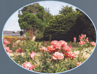
Rose Garden Corkagh, Clondalkin Gáirdín na Rós i gCorkach, Cluain Dolcáin