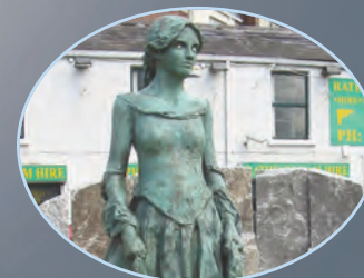
Anne Devlin, Rathfarnham Áine Ní Dhoibhlín, Ráth Fearnáin