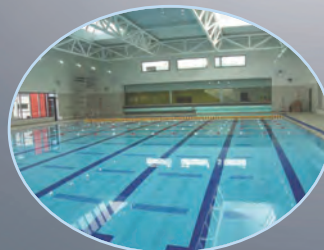
Tallaght Swimming Pool Linn Snámha Thamhlachta