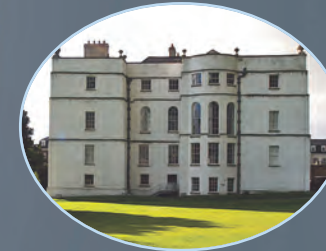
Rathfarnham Castle Caisleán Ráth Fearnáin