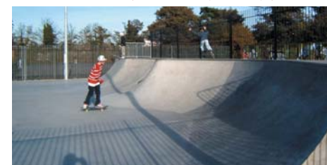
Skate on over to South Dublin Countys first dedicated Skatepark at Griffeen in Lucan. The facility is now open and is being enjoyed by skaters from all across the County.