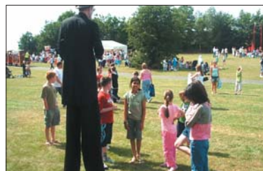
Family Days in the Parks.

2006 has been a year of achievement and celebration of new infrastructural and community developments and initiatives throughout our County.