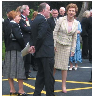
Her Excellency President Mary McAleese visits Kiltalown House in Tallaght.