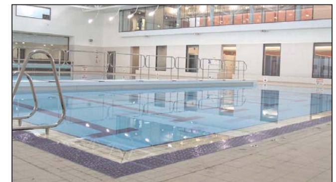
The swimming pool in the new centre.

There's an express fitness suite for those in a hurry, then there's the full size basketball hall which can also accommodate badminton, football and many more indoor activities. South Dublin County Council provides