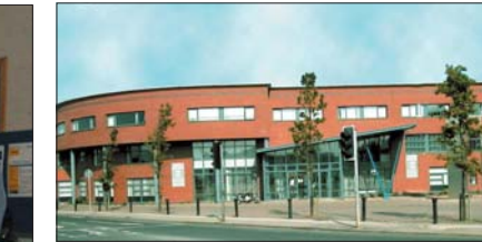
Civic Centre, Clondalkin, Dublin 22.

In addition its responsibilities involve looking to the future development of the County through forward planning, and the promotion of inward economic investment.