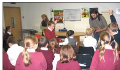
Science Week at County Library.