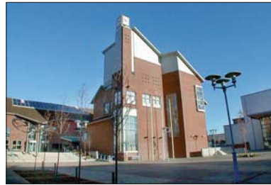
County Hall, Tallaght, Dublin 24.