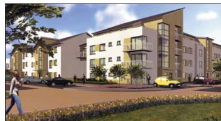
Rath Gael development, Clonsilla.

Properties currently being sold are 20 units in the highly sought after Loftus Hall in Tallaght Town Centre and 18 units in Rathgael, Clonsilla.