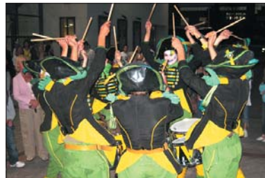
Fused Festival Summer 06