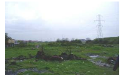
Fettercairn – Looking towards Cheeverstown/ Outer Ring Road Quarry still to right of picture (north) Low density housing to right (south) New business park in distance (centre right of photo)