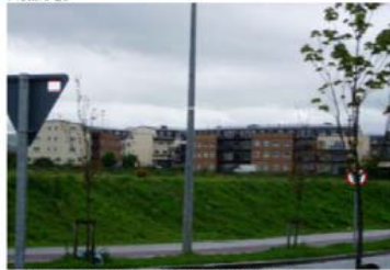
Fortunestown Lane looking towards Carrigmore Shopping Centre site to left (south) Alignment proposed adjacent to road