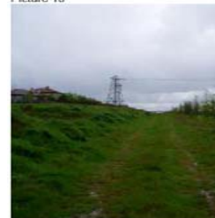
Brookview – Looking towards City West Alignment on proposed track Brookview Estate to left (south)