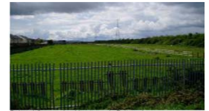
Belgard Green – Looking towards Fettercairn Alignment proposed to left of photo adjacent to estate wall.