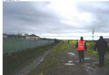
Ardmore – Looking towards City West Drainage ditch to left (south)