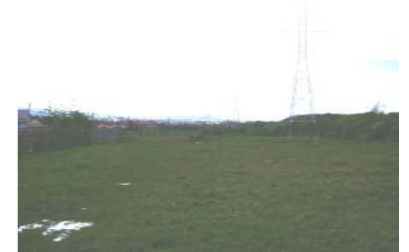
Fettercairn – Looking towards Community Centre Quarry still to right of picture (north)