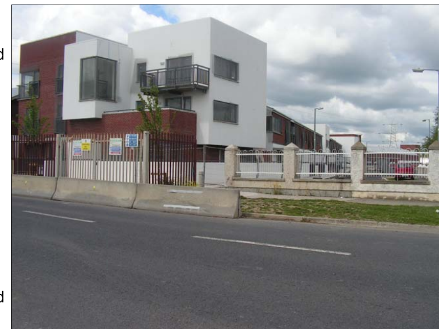
View from St Cuthbert's Road

The pedestrian access point to Kilcronan Court from St. Cuthbert's Road